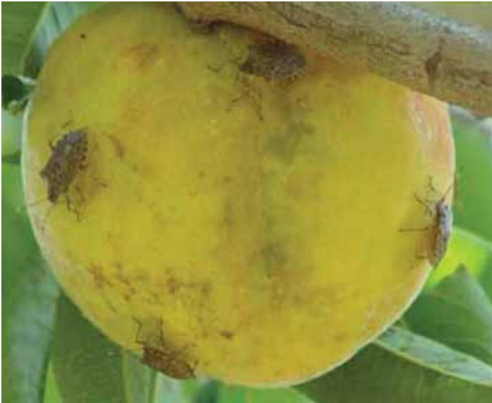
Figure 9. Adults of the brown marmorated stink bug, Halyomorpha halys Stål feeding on peach in Allentown, Pennsylvania. Characteristic damage is evident.