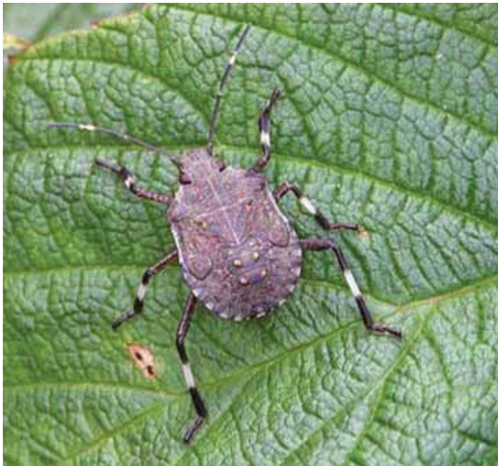
Figure 4. Fifth instar nymph of the brown marmorated stink bug, Halyomorpha halys Ståhl, on raspberry in Allentown, Pennsylvania.

Additionally, the head and pronotum are covered with patches of coppery or bluish metallic-colored punctures and the margins of the pronotum are smooth as compared to the toothed, jagged pronotal margin of Brochymena (Hoebeke 2002). The exposed lateral margins of the abdomen are marked with alternate bands of brown and white. Faint white bands are also evident on the legs.