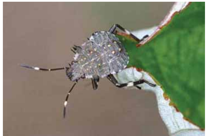
Figure 3. A 2nd instar nymph of the brown marmorated stink bug, Halyomorpha halys Ståhl. The white marking on the antennae is possibly the best field identification characteristic.