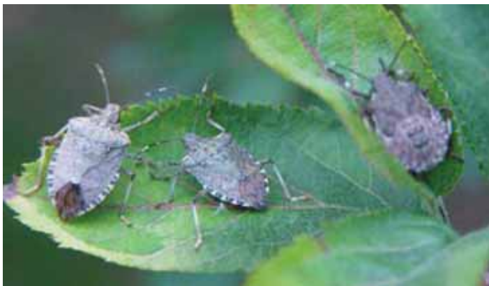
Figure 5. Two adults and one 5th instar nymph of the brown marmorated stink bug, Halyomorpha halys Ståhl, in Allentown, Pennsylvania on crab apple.

Additionally, the head and pronotum are covered with patches of coppery or bluish metallic-colored punctures and the margins of the pronotum are smooth as compared to the toothed, jagged pronotal margin of Brochymena (Hoebeke 2002). The exposed lateral margins of the abdomen are marked with alternate bands of brown and white. Faint white bands are also evident on the legs.