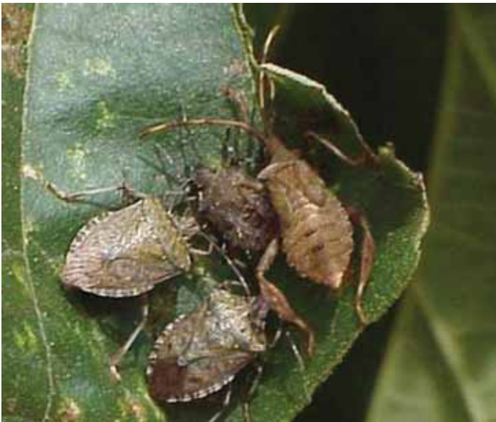
Figure 10. Two adults and a nymph of the brown marmorated stink bug, Halyomorpha halys Stål, feeding on one of its main hosts, princess tree in Allentown, Pennsylvania. Characteristic feeding damage of the brown marmorated stink bug is also evident. Late instar nymphs of leaf-footed bugs (Hemiptera: Coreidae) are often mistakenly submitted as brown marmorated stink bug samples. The Coreidae pictured is probably the western conifer seed bug, Leptoglossus occidentalis Heidemann.