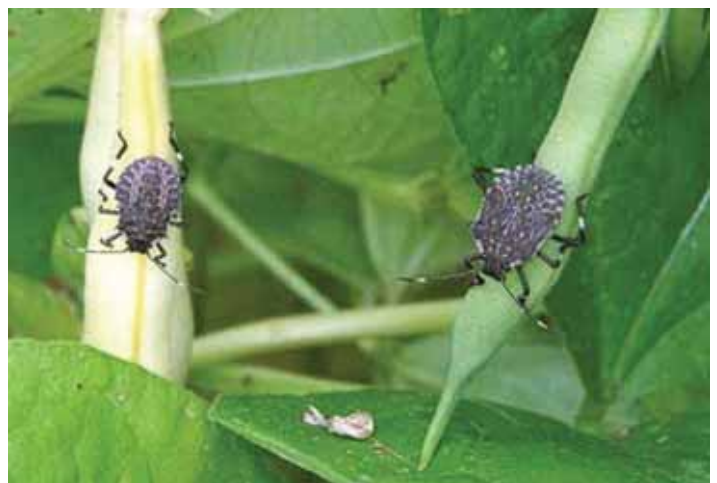
Figure 8. Nymphs of the brown marmorated stink bug, Halyomorpha halys Stål, feeding on green beans in Allentown, Pennsylvania.