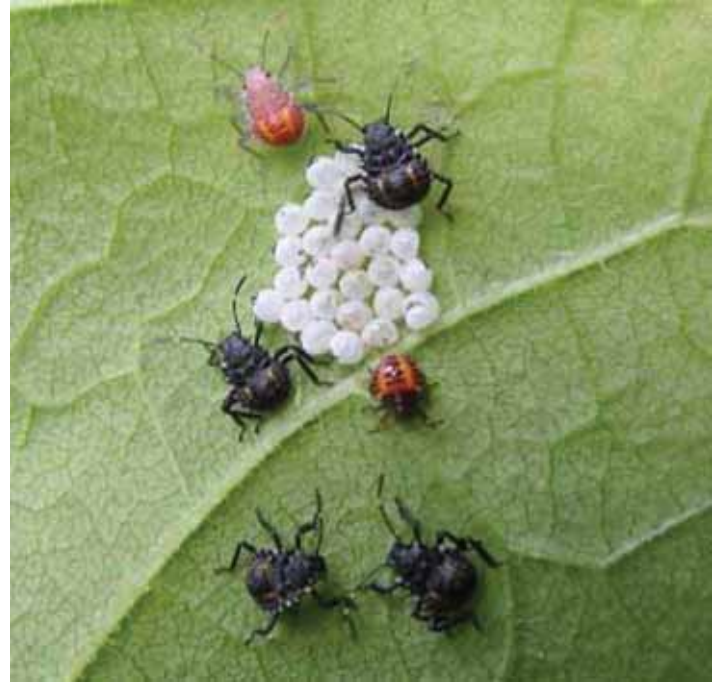
Figure 2. First and 2nd instar nymphs are shown dispersing from an egg mass of the brown marmorated stink bug, Halyomorpha halys Ståhl, in Allentown, Pennsylvania.

Adults: Adults are 12 to 17 mm long (approximately 1/2 inch), and have a mottled appearance. Alternating dark and light bands occur on the last two antennal segments.