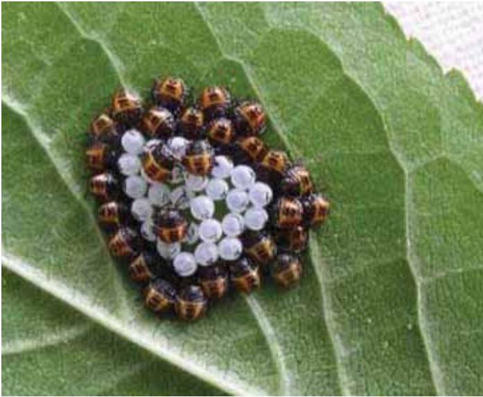
Figure 1. An egg mass of the brown marmorated stink bug, Halyomorpha halys Ståhl, and newly emerged 1st instar nymphs are shown.

Eggs: The white or pale green barrel-shaped eggs are laid in clusters on the undersides of leaves. Egg masses have about 25 eggs that are only about 1 mm in diameter but become apparent when nymphs have recently emerged, as they will stay at the egg mass for several days. In Pennsylvania, eggs first appeared in late June, but females continued to lay egg masses until September. Although only one generation was observed, there are likely to be multiple generations as the distribution spreads south (Bernon et al. 2004).