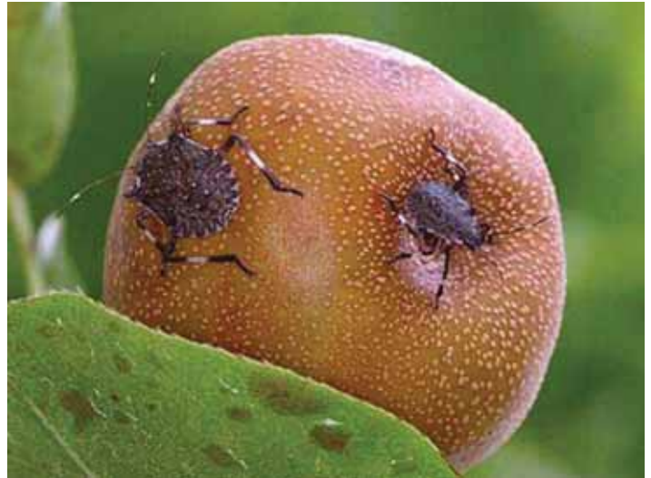
Figure 7. Early and late instar nymphs of the brown marmorated stink bug, Halyomorpha halys Stål, feeding on Asian pear in Allentown, Pennsylvania.

study of BMSB populations at farms in New Jersey and Pennsylvania, and found approximately 25% damage per fruit tree. These studies critically indicate the potentially increasing pest pressure that may occur in tree fruits, particularly pears, apples, and peaches, as a result of the introduction of BMSB. Nielson and Hamilton (2009) predict that pest pressure from BMSB could be more severe in southern U.S. peach-producing states, as it is possible that two generations per year would occur in warmer climates.