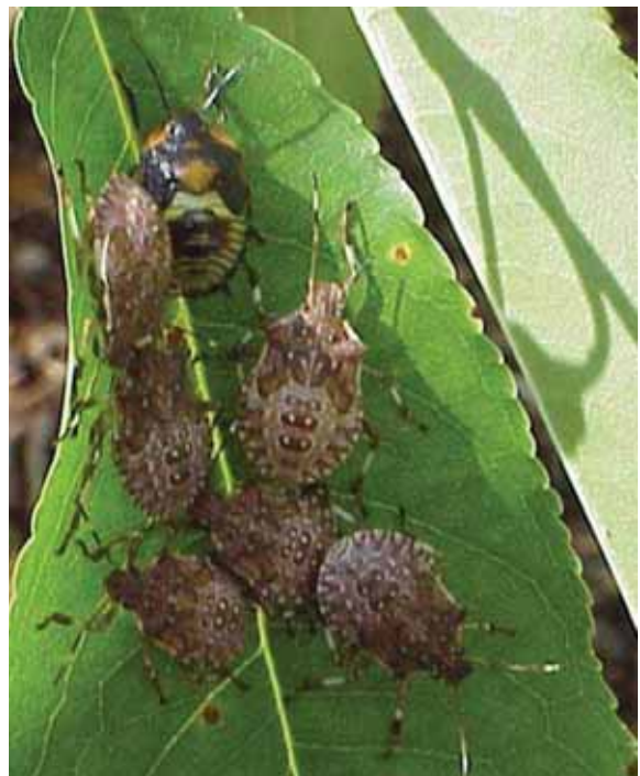
Figure 6. Six 5th instar nymphs of brown marmorated stink bug, Halyomorpha halys Ståhl, with one 5th instar nymph of green stink bug, Acrosternum hilare (Say) in Allentown, Pennsylvania on black cherry.

First instar nymphs emerge four to five days after eggs are laid. Nymphs are solitary feeders, but they occasionally aggregate between overlapping leaves or leaf folds (Bernon et al. 2004). BMSB has five nymphal instars, and each stage lasts approximately one week, depending upon temperature. Laboratory studies indicate that adults are sexually mature two weeks after their final molt (Hoebeke and Carter 2003). Adults are very active and drop from plants or fly when disturbed. Again, the best field characteristic for adults is the white band on the antennae.