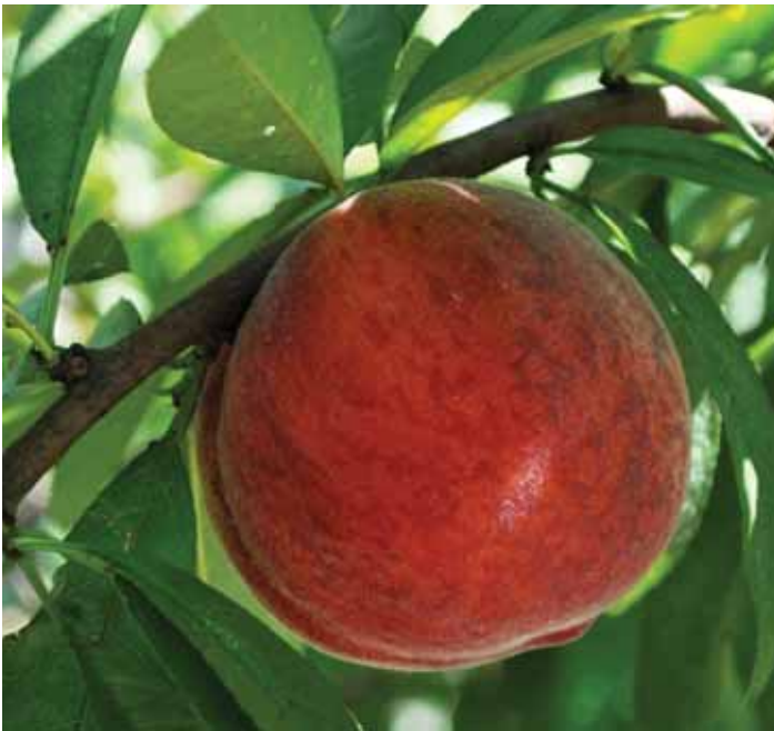
Figure 6. 'Gulfking'

'Gulfking' is a non-melting-flesh cultivar that was released and patented by the joint UF, UGA, and USDA-ARS breeding program in 2004 (Krewer et al. 2005). The fruit have exceptional color, with 80–90% red skin with stripes over a deep yellow ground color. The fruit are very firm with yellow flesh and are clingstone. The FDP is 77 days, and the fruit develop good size, shape and color in north Florida.