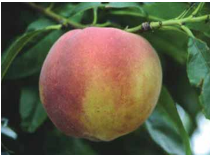
Figure 31. ‘UFGold’

‘UFGold’ is a non-melting, yellow-flesh clingstone peach released by UF in 1996. ‘UFGold’ trees bear heavy annual crops of large fruit. Fruit are symmetrical in shape and develop 70–90% blush over an orange yellow ground color. ‘UFGold’ fruit ripen approximately 80 days after bloom, in early May (Gainesville, FL).