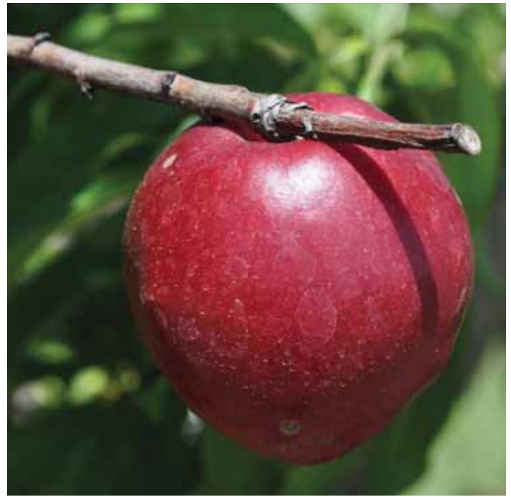
Figure 28. ‘Suncoast’

‘Suncoast’ is a non-patented melting-flesh nectarine cultivar released in 1995. ‘Suncoast’ trees are vigorous and semi-spreading. Fruit of ‘Suncoast’ have yellow flesh, develop 80–90% red blush over a yellow ground color, and are semi-clingstone. ‘Suncoast’ fruit are slightly oblong with no sharp tips or bulges and tend to be tart. ‘Suncoast’ leaves and fruit are resistant to bacterial spot. The FDP of ‘Suncoast’ fruit is 77 days, and fruit ripen in late April to early May in Gainesville, Florida.