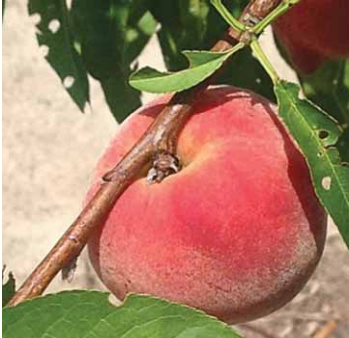
Figure 9. ‘UFGlo’

‘UFGlo’ is a white-flesh, non-melting peach that was released in 2009. ‘UFGlo’ fruit are large, develop 80–90% blush over the entire fruit, and are clingstone. The FDP is 80–85 days. ‘UFGlo’ ripens in areas where the standard cultivar ‘Flordaking’ does well, and it complements ‘UFSharp’ peaches in north central Florida. It produces consistent crops with good yields in north Florida.