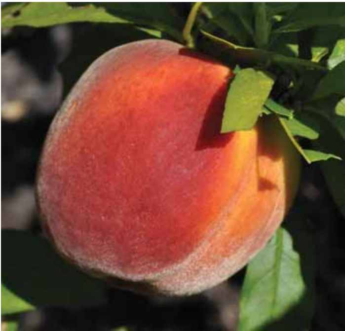
Figure 18. 'UFOne'