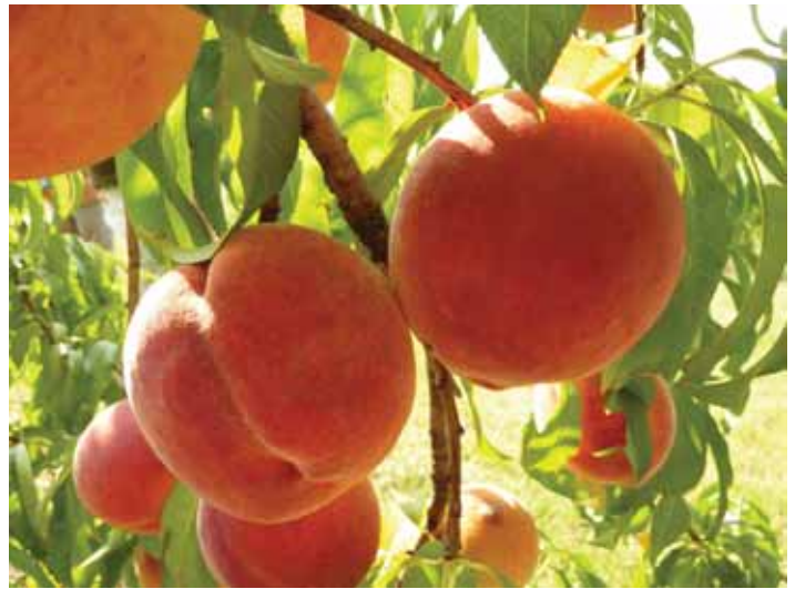
Figure 10. ‘GulfAtlas’

‘GulfAtlas’ is a 2014 release from the UF, UGA, and the USDA ARS joint breeding program. It is a late season variety, with an FDP of 120 days. The fruit have non-melting flesh with a clingstone pit and bright yellow flesh. Fruit are very large and round and ripen about 3 weeks after ‘Gulfcrimson’. Ripe fruit have a 75% blush, with some red pigmentation in the flesh under the skin. Trees are vigorous and semispreading with few blind nodes and good fruit set. ‘GulfAtlas’ is adapted to an area south of Attapulcus, GA, to Gainesville, FL.