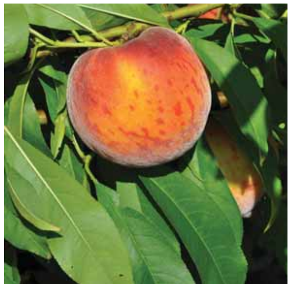
Figure 29. ‘Flordaprince’

‘Flordaprince’ was released by UF in 1982 and its fruit have melting flesh. It has been a standard low-chill peach cultivar worldwide and is one of the earliest ripening. The fruit develop 80% red blush with dark red stripes over a yellow ground color. ‘Flordaprince’ fruit are large, uniformly firm, and yellow, with semi-clingstone pits. The fruit ripen about 7–10 days earlier than ‘TropicBeauty’ in Gainesville, Florida, with an FDP of 78 days.