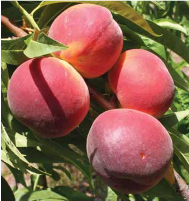
Figure 15. 'UFBest'