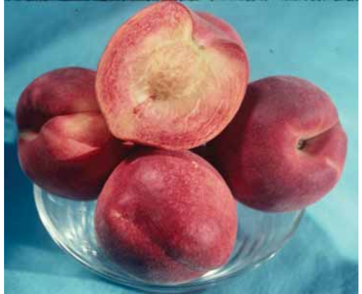
Figure 11. ‘Gulfcrest’

‘Gulfcrest’ is a 2004 release from the UF, UGA and the USDA-ARS joint breeding program. It has an FDP of 62–75 days and has non-melting flesh with a clingstone pit. Ripe ‘Gulfcrest’ fruit have 90–95% red color over deep yellow to orange ground color and ripen in early to mid-May in southern Georgia. ‘Gulfcrest’ fruit can be variable in size on the tree and can produce “twiggy” branch growth. ‘Gulfcrest’ is adapted to extreme northern Florida and southern Georgia.