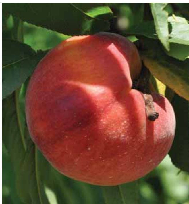
Figure 14. 'UFSun'

'UFSun' is a non-melting-flesh peach cultivar released in 2004 (Rouse et al., 2004). 'UFSun' trees bear heavy annual crops of early-season, medium-sized fruit, with yellow flesh and clingstone pits. 'UFSun' fruit are uniformly symmetrical and develop 50–60% red skin with darker red stripes. 'UFSun' fruit ripens with that of the standard peach cultivar 'Flordaprince' at Immokalee and Gainesville, Florida with an FDP of 80 days.