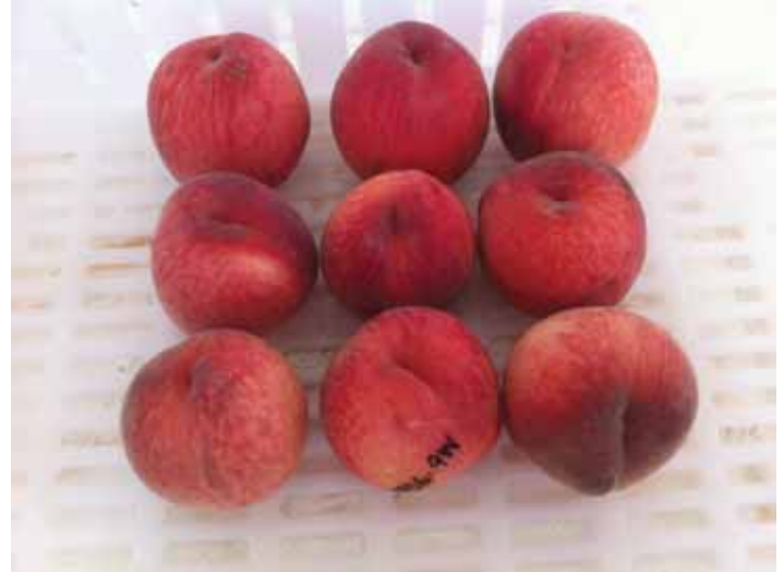
Figure 7. 'Gulfsnow'

'Gulfsnow' is a 2012 joint release from the University of Florida, University of Georgia, and USDA-ARS breeding program. Trees of 'Gulfsnow' are vigorous and semi-spreading, producing white, non-melting-flesh fruit. 'Gulfsnow' fruit are large, round, and attractive with a 50–60% blush over a cream background. The fruit are clingstone, with medium-sized, red pits and have an FDP of 110 days.