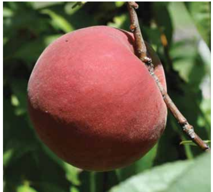
Figure 17. 'UFBeauty'

'UFBeauty' is a peach cultivar released in 2002 with fruit that have non-melting-flesh, clingstone pits, and very symmetrical shape. The flesh of 'UFBeauty' fruit is yellow and very firm, and the skin color is near 100% red, with darker red stripes. 'UFBeauty' ripens 3 to 4 days after 'UFGold' in Gainesville, Florida, with an FDP of 82 days. Cropping of 'UFBeauty' has been unreliable in south Florida when night temperatures during the bloom period are higher than 57°F (14°C).