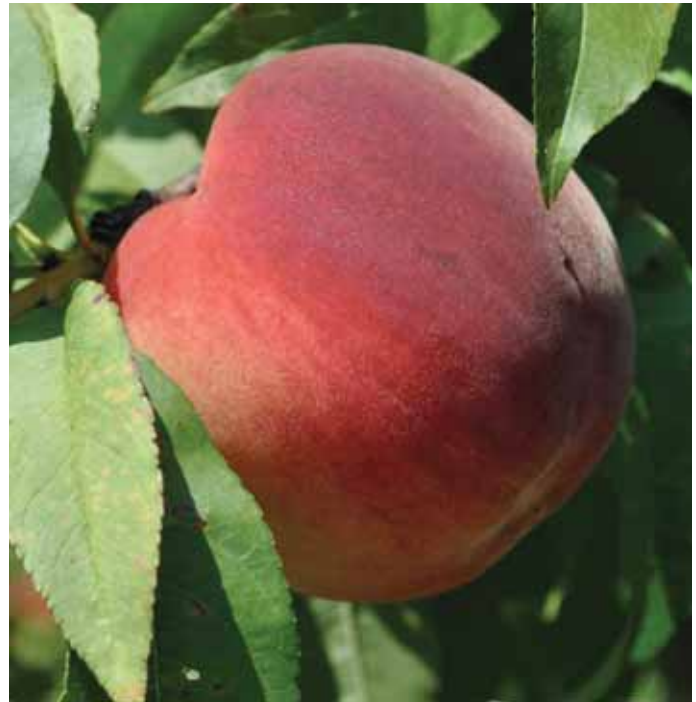
Figure 32. ‘TropicSnow’

‘TropicSnow’ was jointly released by UF and Texas A&M in 1989. Its fruit have white, melting-flesh, semi-freestone pits. ‘TropicSnow’ fruit develop 40–50% red blush over a creamy white background and have very low acid combined with excellent sweetness. ‘TropicSnow’ has an FDP of 90–97 days.