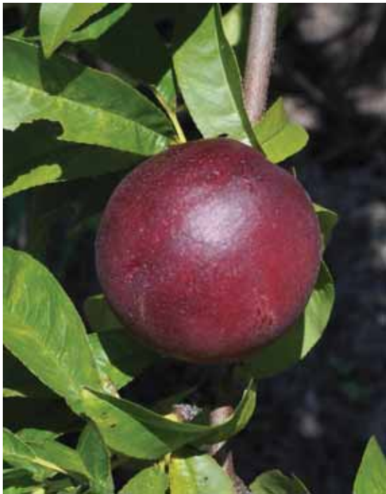
Figure 13. 'UFRoyal'

'UFRoyal' is a yellow flesh, non-melting nectarine, with an FDP of 85 days. 'UFRoyal' fruit are large, with 100% red skin, and a semi-clingstone pit. Fruit are symmetrically oval and ripen approximately 1 week before 'UFQueen' (below) in early May (Gainesville, FL). 'UFRoyal' fruit have excellent firmness and flavor, with excellent shipping potential.