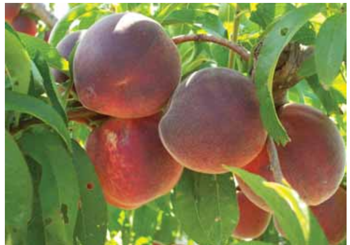
Figure 8. 'Gulfcrimson' Credits: USDA-ARS

'Gulfcrimson' is the third in a series of cultivars released and patented by the joint UF, UGA, and USDA-ARS stone fruit breeding program, specifically in 2009 (Krewer et al. 2008). 'Gulfcrimson' fruit are large for an early-ripening cultivar and have a yellow ground color with 80–90% red skin. 'Gulfcrimson' ripens with the standard peach cultivar 'JuneGold' in Attapulgus, Georgia, with an FDP of 95 days and highly consistent cropping, making it a good mid-season replacement for 'JuneGold'. It also crops reliably in north Florida.