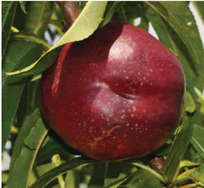
Figure 12. 'Sunbest'

May (Gainesville, FL), about 3 days before the standard 'Sunraycer' nectarine cultivar. It is superior to and a good replacement for 'Sunraycer' nectarine.