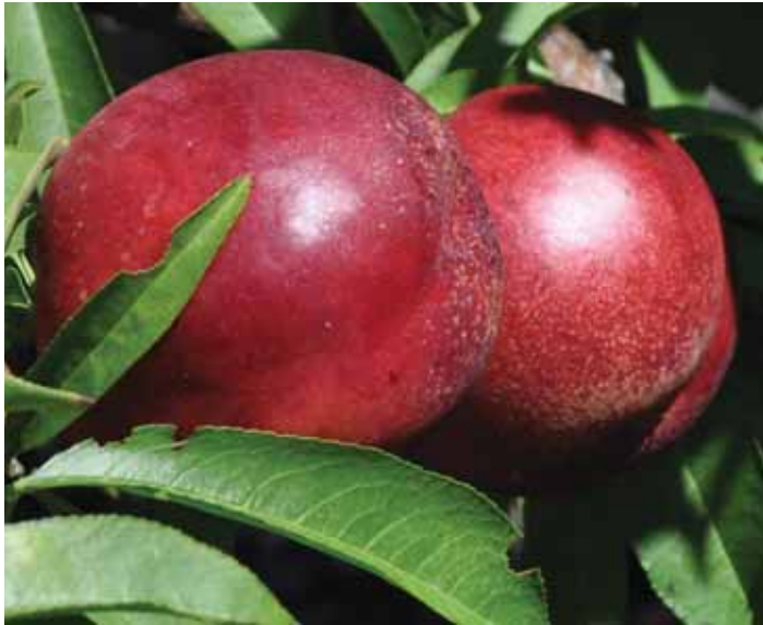
Figure 27. ‘Sunmist’

‘Sunmist’ is a patented melting-flesh nectarine cultivar released in 1994. ‘Sunmist’ trees are highly vigorous and have a spreading growth habit. Fruit of ‘Sunmist’ have white flesh, are semi-freestone, and are large for an early ripening cultivar. Fruit develop nearly 100% red blush and are uniformly symmetrical. ‘Sunmist’ trees and fruit are highly resistant to bacterial spot. The FDP is 85 days, and the fruit ripen in early May in Gainesville, Florida.