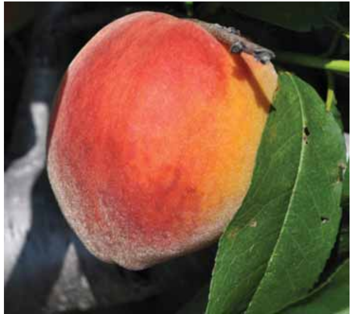
Figure 19. 'UF2000'

'UF2000' is a yellow-flesh, non-melting, clingstone peach, released in 2000. Trees are highly vigorous with a semi-spreading growth habit and produce heavy annual crops of moderately large fruit. 'UF2000' fruit are symmetrically shaped and develop 50–70% solid red skin over a yellow background. 'UF2000' fruit ripen mid-season, with harvest occurring from 15–18 days before 'UFGold' in mid-late May in Gainesville, Florida.