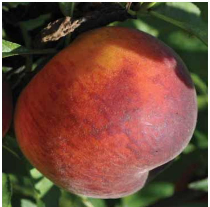
Figure 20. 'UFBlaze'

'UFBlaze' is a non-melting-flesh, clingstone peach cultivar released in 2002. Trees are highly vigorous, with a semi-spreading nature. 'UFBlaze' trees produce heavy annual crops of large, early ripening, attractive fruit with bright red skin over 80–90% of a bright yellow-orange background and yellow flesh. Fruit are uniform and symmetrical, and they ripen about 7 to 10 days after 'UFGold' in early to mid May in Gainesville, Florida with an FDP of 83 days.