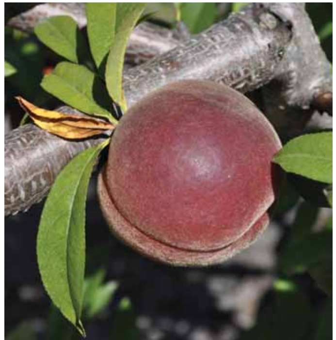
Figure 4. ‘Flordabest’

‘Flordabest’ was released and patented in 2009 and has a FDP of 82 days from fruit set to harvest. The fruit develop 90–100% blush, making them very attractive. The fruit are large, and have melting, but uniformly firm yellow flesh, and semi-clingstone pits. The fruit ripens about 7–10 days earlier than the standard peach cultivar ‘TropicBeauty’ in Gainesville, Florida. It is recommended for trial in Gainesville and south to Interstate 4.