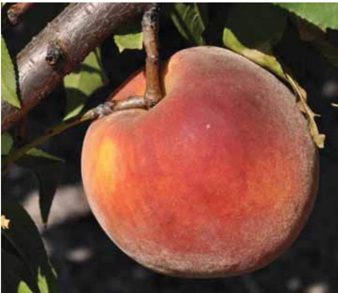
Figure 16. 'TropicBeauty'

'TropicBeauty' is a non-patented cultivar released jointly by the University of Florida and Texas A&M in 1989. The medium-sized, semi-freestone fruit have yellow, melting flesh and develop 70% blush over a yellow ground color. 'TropicBeauty' ripens between 'UFSun' and 'UFOne' and has an FDP of 89 days.