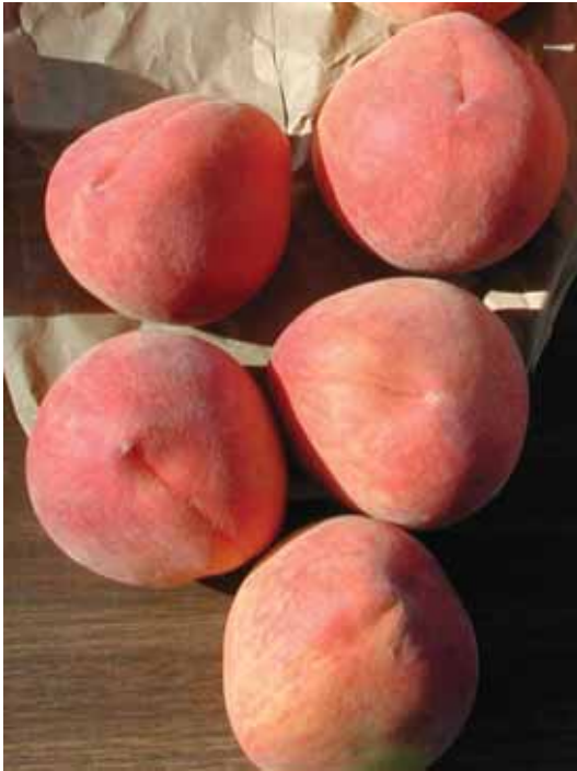
Figure 24. 'Flordaking'

moderate resistance to bacterial spot. Fruit of 'Flordaking' have yellow, melting flesh and clingstone pits. 'Flordaking' fruit develop 70% red blush over a yellow ground color. 'Flordaking' has an FDP of 65–70 days and ripens in early May (Gainesville, FL). One disadvantage of 'Flordaking' fruit is high incidence of split pits when crop loads are low.