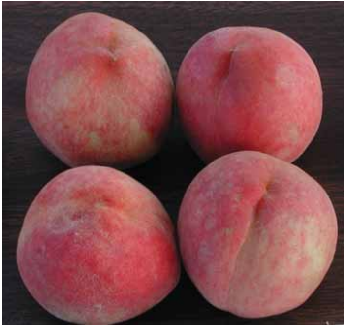
Figure 30. ‘Flordaglo’

a white ground color. ‘Flordaglo’ fruit are early ripening, semi-clingstone, and are bacterial spot resistant. Fruit ripen in early May, approximately 78 days after full bloom. ‘Flordaglo’ fruit is ideal for backyard or u-pick operations due to the melting flesh texture and its tendency to show bruises and abrasions easily.