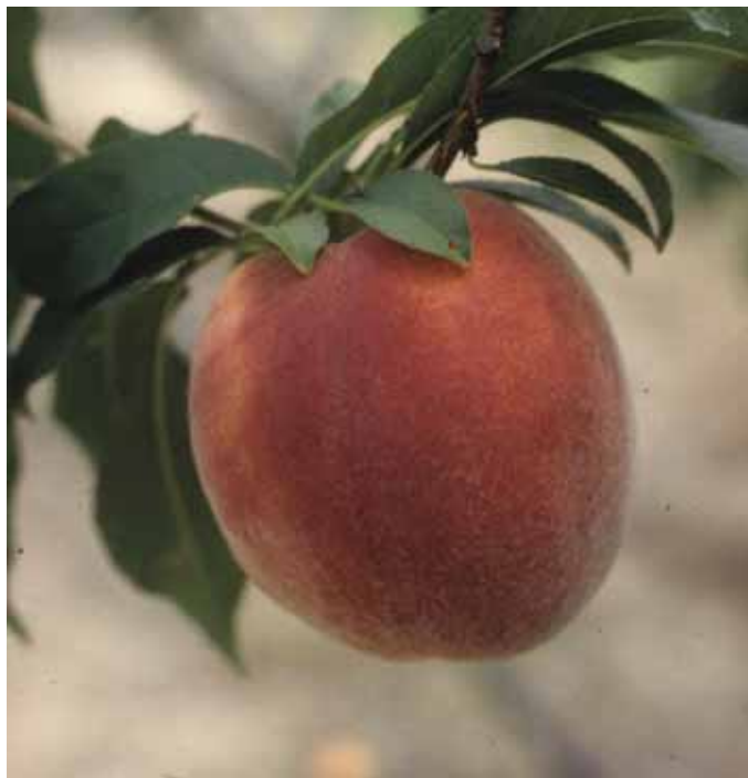
Figure 22. ‘Flordacrest’

‘Flordacrest’ is a melting-flesh semi-clingstone peach cultivar released in 1988. ‘Flordacrest’ trees are vigorous with a spreading habit. ‘Flordacrest’ fruit have yellow flesh and develop 60–80% red blush over a bright yellow ground color. It is the best melting-flesh peach currently available for north Florida. It ripens after ‘Flordaking’ in north Florida, in early May in Gainesville, Florida with an FDP of 75 days.