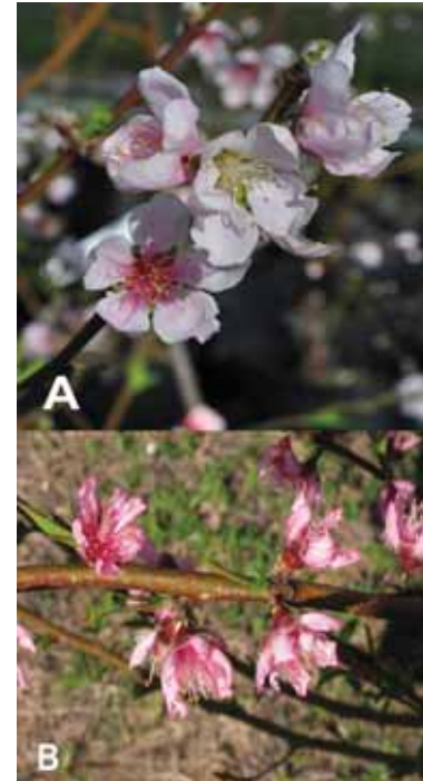
Figure 2. Showy (a) and non-showy (b) peach flowers.

vigorous (e.g., ‘Sunbest’) in canopy growth. Flowers on certain peach cultivars can be showy , with large, pink petals; flowers on other cultivars are non-showy , with smaller, redder petals (Figure 2). Leaf glands at the base of the leaf near the petiole can also be used in the identification process. Leaf glands may be absent ( eglandular ), or they may be globose (round) or reniform (kidney-shaped) (Figure 3).