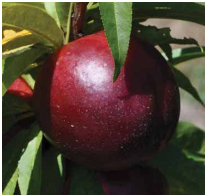
Figure 26. 'Sunbest'

'Sunbest' is a patented melting-flesh nectarine cultivar released in 2001. 'Sunbest' trees are semi-upright and vigorous, responding well to open-center pruning systems. 'Sunbest' fruit develop 90–100% bright red blush over a yellow ground color, are semi-freestone, and resist bacterial spot well. 'Sunbest' is intended as a replacement for 'Sunraycer' nectarine because of its larger and more attractive fruit. 'Sunbest' has an FDP of 85–90 days, and fruit ripen approximately 3 days before 'Sunraycer' nectarine and 'Flordaglo' peach in Gainesville, Florida.