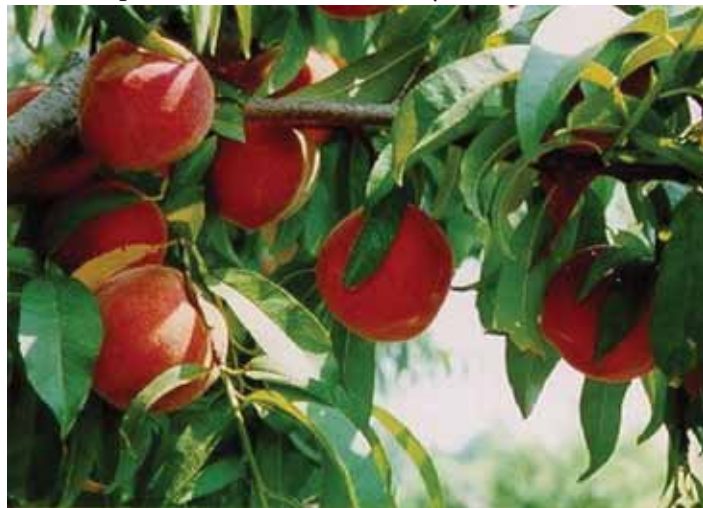
Figure 23. ‘Gulfprince’

‘Gulfprince’ was jointly released by the University of Florida, University of Georgia, and USDA-ARS in 2002. Trees of ‘Gulfprince’ are large and vigorous with a spreading growth habit. ‘Gulfprince’ fruit are uniform and symmetrical and develop 45–55% solid red skin. Fruit have non-melting, yellow flesh with clingstone pits. ‘Gulfprince’ fruit has exhibited some slight browning due to oxidation on soft, ripe fruit. The FDP is 110 days.