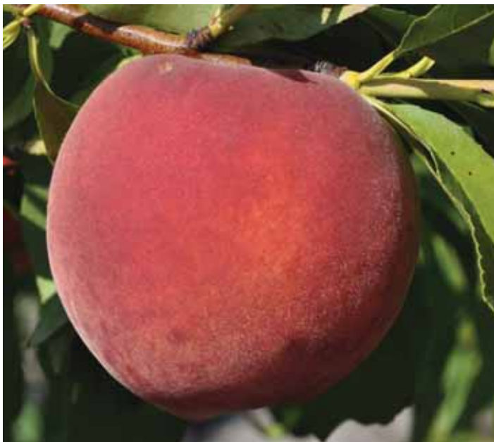
Figure 21. ‘UFSharp’

‘UFSharp’ is a patented, non-melting-flesh clingstone peach cultivar that was released in 2006. ‘UFSharp’ trees are vigorous, semi-spreading in nature, and productive. ‘UFSharp’ fruit develop 60% red blush over a deep yellow to orange ground color. ‘UFSharp’ has reliable cropping with excellent fruit size, shape, and firmness, and an FDP of 105 days.