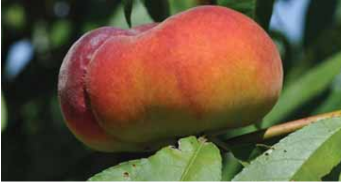
Figure 5. 'UFO'

'UFO' produces moderately heavy crop loads of large, firm fruit with yellow flesh and semi-freestone pits that have an FDP of 95 days. The skin develops 50–70% blush. This cultivar is particularly susceptible to ethylene that is released during dormant pruning, which can result in significant flower bud abortion. Thus, pruning is only recommended during the summer period.