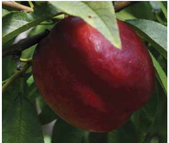
Figure 25. 'Sunraycer'

'Sunraycer' is a non-patented melting-flesh nectarine cultivar released in 1993. Trees are vigorous and semi-spreading, responding well to open-center pruning systems. 'Sunraycer' produces large, semi-clingstone fruit with good firmness resistance to bacterial spot. 'Sunraycer' fruit develop 80–100% brilliant red blush over a bright yellow ground color and are oval with no sharp tips or suture bulges. 'Sunraycer' has an 85 day FDP and ripens in early May in Gainesville, Florida.