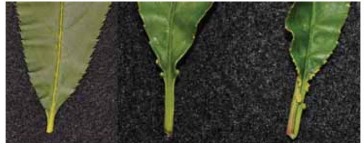
Figure 3. Eglandular (a), globose (b) and reniform (c) leaf glands on peach leaves.