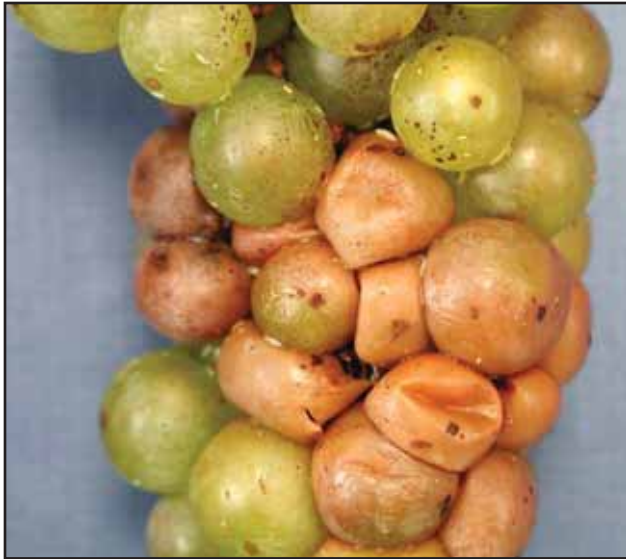
FIGURE 6. SOUR ROT RESULTS IN A SOFT, WATERY ROT.