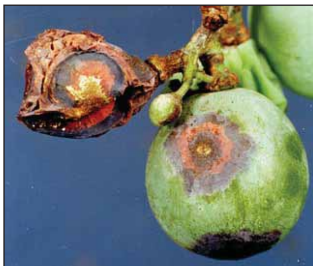
FIGURE 1. TYPICAL "BIRD'S EYE" SYMPTOM DUE TO ANTHRACNOSE

Fruit clusters are susceptible to infection anytime prior to flowering through veraison (the stage when the berries begin to ripen). Initially, small, reddish circular spots develop on infected fruit. These spots enlarge to an average diameter of \frac{1}{4} inch and may become slightly sunken. The centers of the spots turn whitish gray and become surrounded by