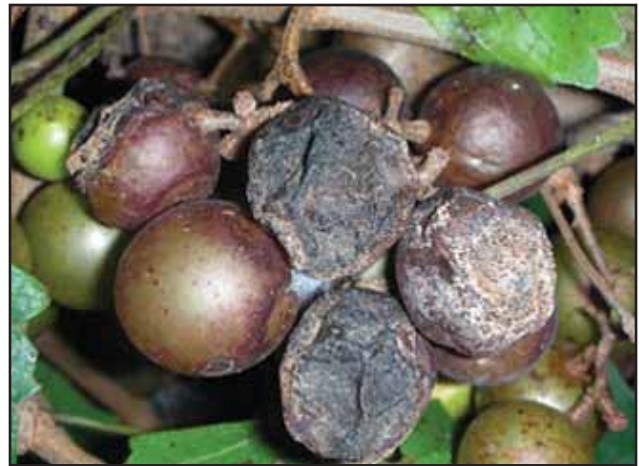
FIGURE 5. THE RIPE ROT FUNGUS PRODUCES FRUITING BODIES THAT EXUDE SALMON-COLORED SPORES.

As the name implies, ripe rot is a disease that occurs on ripened berries at or near harvest. Ripe rot can be a particularly devastating disease of muscadine grapes whenever warm, humid weather prevails. The ripe rot pathogen causes fruit rots on a number of other fruit and vegetable crops as well.