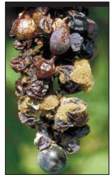
FIGURE 4. BOTRYTIS BUNCH ROT. TAN FUNGAL GROWTH IS PRESENT ON SEVERAL INFECTED BERRIES.

Early season Botrytis infections can cause blossom blight and result in significant crop losses. The most common symptom on fruit is a soft, watery decay of ripening berries. Initially one or a few berries within the bunch may be affected. Healthy berries become infected when the fungus spreads from adjacent diseased berries. Botrytis can spread rapidly throughout the cluster until the entire bunch is decayed. Under moist conditions, infected fruit may be covered with a tan or gray growth of fungal mycelium and spores (FIGURE 4).