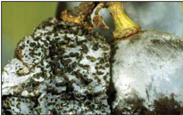
FIGURE 2. INFECTED FRUIT COVERED WITH ACERVULI OF THE BITTER ROT FUNGUS.

This disease is appropriately named for the bitter taste it imparts to infected berries. The unpleasant flavor carries over to wine and other value-added products made from the diseased fruit.