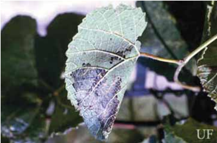
Figure 3. Damage to bunch grape foliage caused by the grape leaffolder, Desmia funeralis (Hübner).

leaf, exposing the under surface; the edge is held in place by bands of silk thread. It is within the protection of this fold that the larva feeds, skeletonizing the leaf of the upper surface. When the larvae are numerous, the injury to the vine becomes conspicuous, even at a considerable distance, because the light color of the under surface of the folded leaves contrasts boldly with the dark green of the upper side normally presented, thus giving the vine a patchy appearance. Larvae roll muscadine leaves, which are thinner than bunch grape leaves.