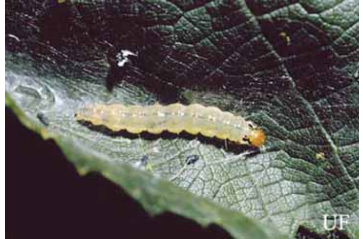
Figure 1. Larva of the grape leaffolder, Desmia funeralis (Hübner).

Larvae are 3/4 inch long when fully grown. They are glossy, translucent yellow-green on the sides and somewhat darker above, with scattered fine yellow hairs on each segment. The head and prothoracic shield are light brown, and there are light brown spots on the sides of the first two thoracic segments. Larvae wiggle vigorously when disturbed and drop to the ground.