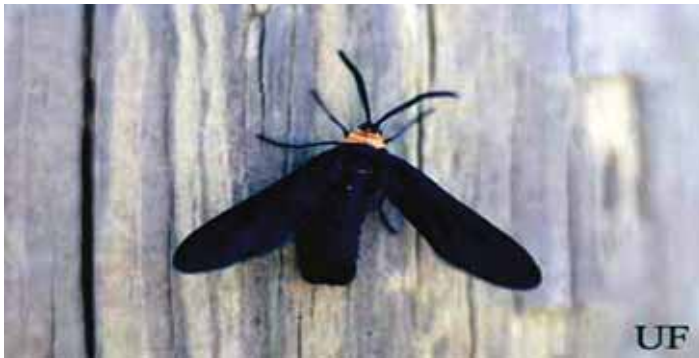
Figure 1. Adult grapeleaf skeletonizer, Harrisina americana (Guérin-Ménéville).

Adult moths are uniformly black except for a yellowish or orange collar. The antennae are pectinate in both sexes and plumose in the male. The forewings are four times as long as wide and more than twice the area of the hind wings. The abdomen is usually curled upwards and expanded at the tip into a fan-shaped, somewhat bilobed caudal tuft. Length of the moth is 8 to 12 mm, while the wing expanse is 22 to 28 mm.