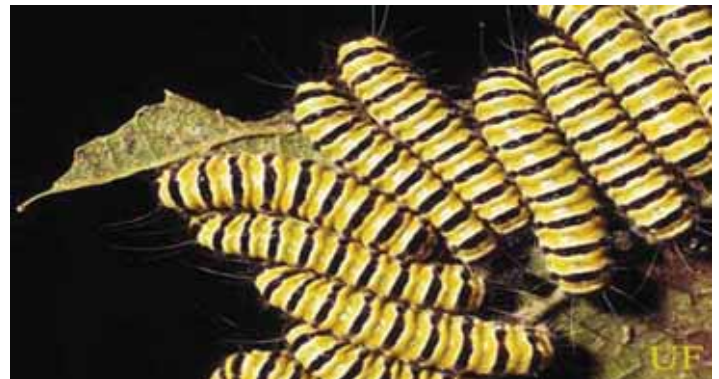
Figure 3. Larvae of the grapeleaf skeletonizer, Harrisina americana (Guérin-Ménéville), feeding on a grape leaf.

Larvae are yellowish and have black spots or bands. They are slightly more than 1/2 inch long when mature.