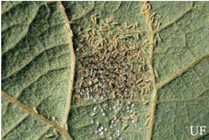
Figure 4. Larvae of the grapeleaf skeletonizer, Harrisina americana (Guérin-Ménéville), hatching from an egg cluster on a grape leaf.

Eggs are lemon yellow, cylindrical-oval or capsule-shaped, slightly over 1/2 mm in length, and laid in clusters on lower leaf surfaces.