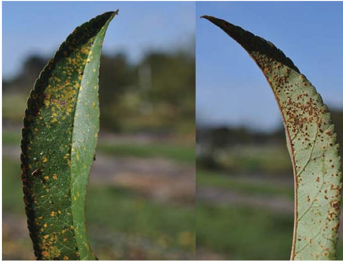
Figure 1. Peach rust leaf symptoms showing small yellow necrotic areas (left), and rust-colored fungal spores on the leaf underside (right).

Early-season leaf infections can give rise to premature defoliation, reduced yields, and a high number of fruit infections at harvest (Adaskaveg et al. 2012). In Florida, defoliation leading to premature flowering is the main concern because it reduces yields in the following year.