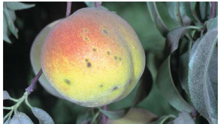
Figure 2. Typical fruit lesions on mature fruit, which is atypical for peach production in Florida.

The importance of the two spore cycles for initial inoculum production in Florida is not well understood, and alternate hosts may not be as important as in other peach production areas; however urediniospores from leaf lesions and possibly twig cankers are produced in abundance and are responsible for secondary spread to peach leaves. Urediniospores are disseminated by wind. Splashing from rainfall and higher wind velocity result in increased numbers of airborne spores (Adaskaveg et al. 2000). Under favorable environmental conditions, rust disease symptoms can become severe following repeated infection cycles on leaves and fruit.