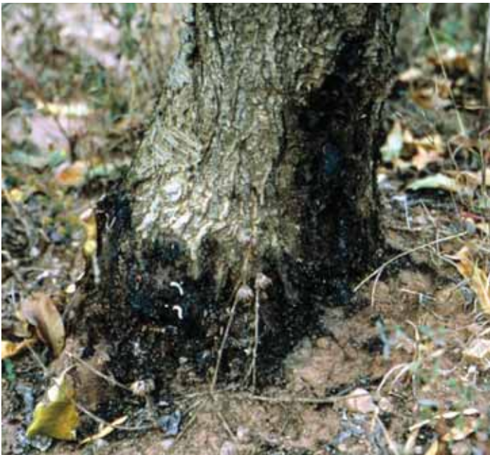
Figure 3. Gummosis at ground level of peach tree infested by the peachtree borer.

The lesser peachtree borer (LPTB) (Figure 5) usually begins flight in February or March and is continually present until November or December. Adults may be present in some parts of Florida throughout the year. The LPTB has two generations per year. Peak populations in Florida occur in March and April and are stable through November.