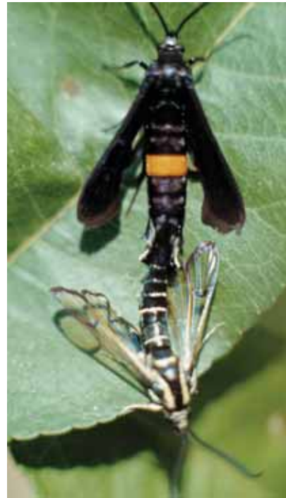
Figure 1. Adult female (top) and male (bottom) of the peachtree borer.

masses of gum and sawdust (Figure 3). However, gum and sawdust are not always evident, and close scrutiny of tree trunks at ground level is often necessary to detect PTB infestations.