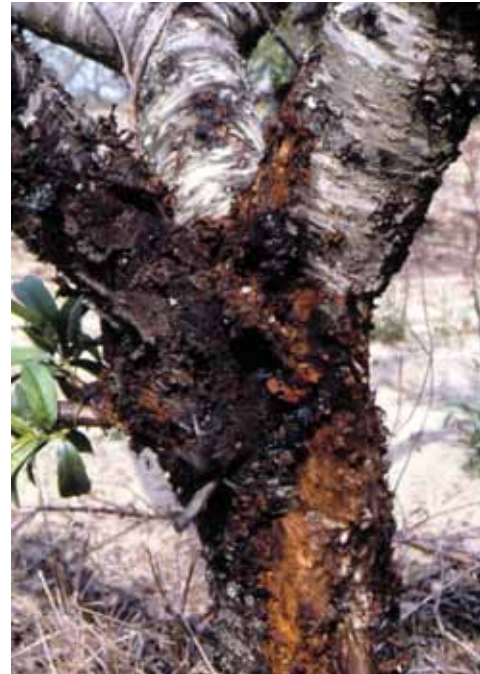
Figure 7. Damage - gummosis and sawdust - caused by feeding of lesser peachtree borer.

the moist areas around the root crown. The lesser peachtree borer is harder to control because the nematodes need moisture to survive and the scaffold limbs are not moist enough. Recent research by the author with others has demonstrated that use of Barricade™ in conjunction with aqueous sprays of nematodes can be effective against lesser peachtree borer.