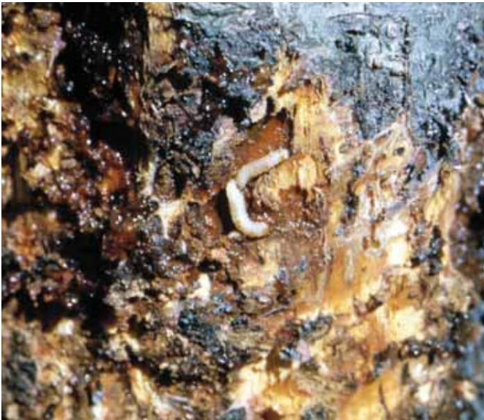
Figure 2. Damage and larval feeding on trunk of peach tree by peachtree borer larvae.

just prior to adult emergence. At this time they project themselves partially out of the bark, and the adult emerges (Figure 4). The pupal cases remaining can easily be seen on infested trunks and used to monitor adult emergence.