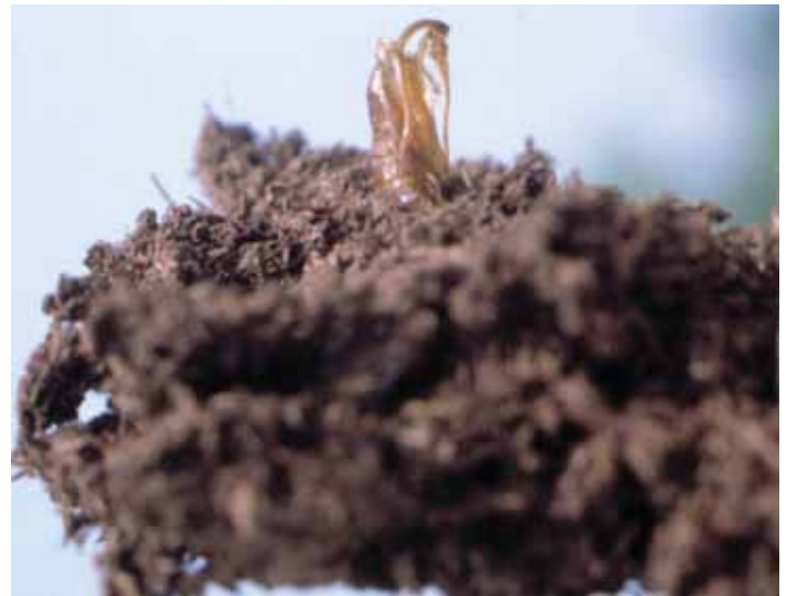
Figure 4. Peachtree borer pupal case protruded from the tree indicates borer emergence.

The lesser peachtree borer (LPTB) (Figure 5) usually begins flight in February or March and is continually present until November or December. Adults may be present in some parts of Florida throughout the year. The LPTB has two generations per year. Peak populations in Florida occur in March and April and are stable through November.