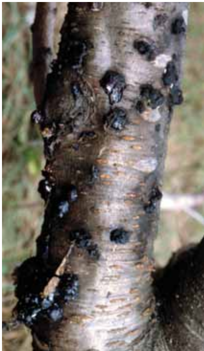
Figure 6. Gummosis caused by lesser peachtree borer on lower limbs.

important to maintain thrifty trees and to avoid unnecessary damage to trees from orchard or homeowner machinery. A weed-free herbicide strip under trees precludes the need of moving machinery close to tree trunks. However, prior damage to trees is not a prerequisite for borer infestations. It is necessary for both homeowners and commercial growers to monitor trees for signs of infestation. This can be done by looking for gummosis and sawdust produced by the larvae or for the pupal cases. Often these signs - especially pupal cases - mean considerable damage has occurred. An alternate method is to use trunk cover sprays at scheduled times during the season, or to monitor for the presence of adult moths using commercially available pheromone traps and to spray at the times of peak adult flight.