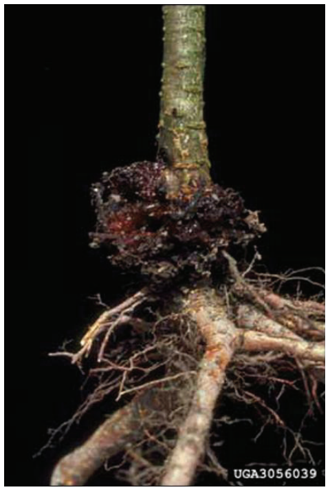
Figure 2. Damage caused by the peachtree borer, Synanthedon exitiosa (Say), at the base of a young peach tree.

Certain rootstocks have been found to result in a smaller number of adult peachtree borers. For example, "Siberian C" rootstock had 40% more emerging adults than "Lovell." Another study compared the incidence of adult emergence of different varieties, but nothing clear was indicated by the data.