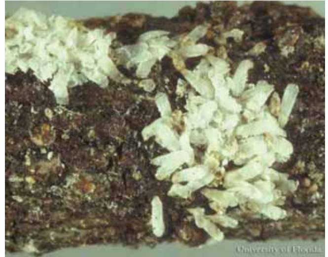
Figure 3. Adult male white peach scale, Pseudaulacaspis pentagona (Targioni).

die. An interesting phenomenon of the egg laying process is that the eggs which are deposited first are orange in color and will become female offspring, while the eggs that are laid later are white and will give rise to male offspring. The average number of eggs produced by each female will vary due to several factors, but is primarily influenced by the species of the host plant that is being infested. In Georgia, it was reported that female scales laid an average of 100 eggs when peach trees served as the host plant, while in Florida, an average of 80 eggs were laid on potato plants. The eggs hatch three to four days after being deposited and young crawlers emerge.