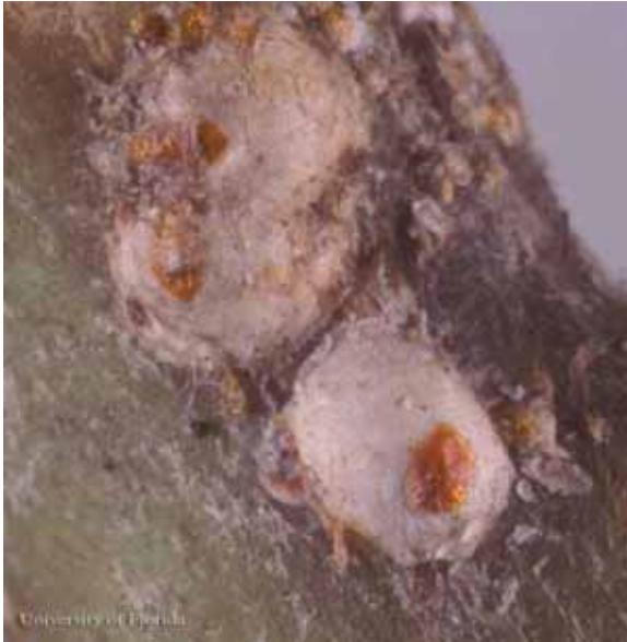
Figure 2. Adult female white peach scales, Pseudaulacaspis pentagona (Targioni).

The adult female scale is immobile on the host plant. She is covered with a protective shell, which is created by incorporating the cast skins from her previous molts with newly secreted wax from her body glands. She may also gather pieces of bark from the host plant to add to her shell, which then serves as protective camouflage. The appearance of the female is dull white to yellowish in color, oval in shape, with an overall length measuring between 2.0 to 2.5 mm.