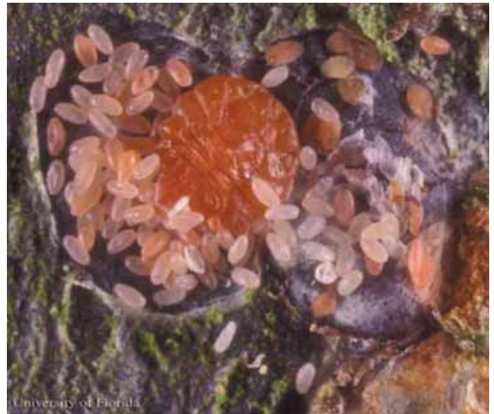
Figure 4. Adult female white peach scale, Pseudaulacaspis pentagona (Targioni), with eggs.