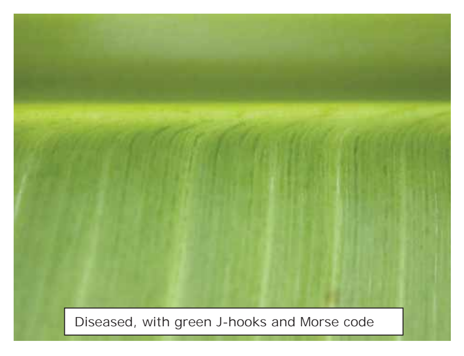
<u>BBTV disease symptoms</u>: Leaf symptoms (Morse code, Green J-hooks)