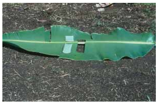
Leaf lamina sample to be analyzed for nutrient content in a crop-logging program