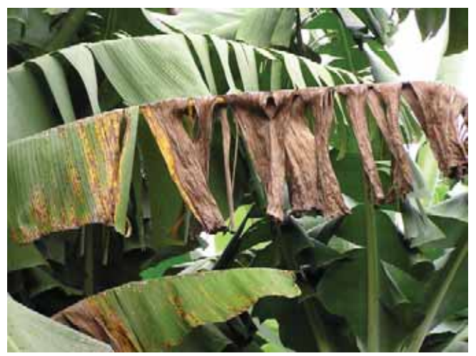
Stagnant air and high relative humidity in the banana canopy favor the development of black leaf streak disease. A recommended periodic IPM practice for managing the disease ("de-trashing") is to cut off severely diseased leaves with more than 50 percent of the leaf area damaged; therefore, the leaf in this photo should be cut off.

Some farmers take disease management actions, such as making fungicide applications, on the basis of the intensity of BLS disease observed on plants in the field. These farmers have scouts that record plant growth and disease levels weekly on plants of similar age groups (i.e., just before flowering). An estimate of disease intensity is obtained and recorded, such as "the youngest leaf with spots" or "the number of leaves between the first leaf with a streak and the first leaf with a spot." Some farmers use a disease assessment scale to estimate visually the percentage of leaf area diseased. It is also useful to count the number of leaves on a plant without disease. At