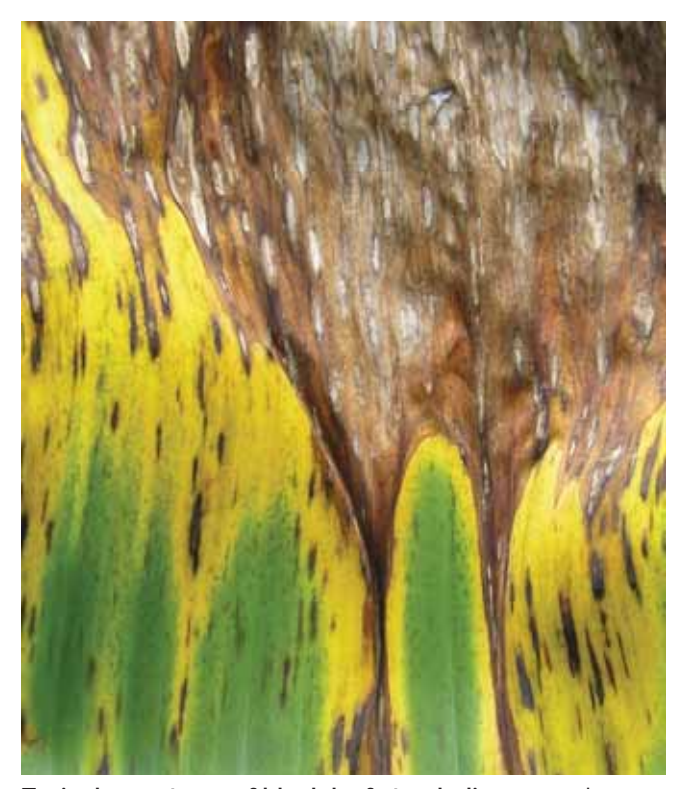
Typical symptoms of black leaf streak disease on banana leaves in Hawai'i (see also the photo on p. 1). Dozens of lesions coalesce to form large, blighted areas of the leaf. Usually, a significant amount of yellowing of the affected banana leaf tissues occurs as they senesce prematurely and turn various shades of brown and gray. Ascospores of the pathogen form in numerous perithecia within the tan-colored centers of the lesions. Presence of moisture on banana leaves aids the processes of spore dispersal and infection.

Banana cultivar synonyms in Hawaii. 2007. A.K. Kepler and F. Rust. www.ctahr.hawaii.edu/nelsons/banana/BananaSynonymsHawaii.pdf.