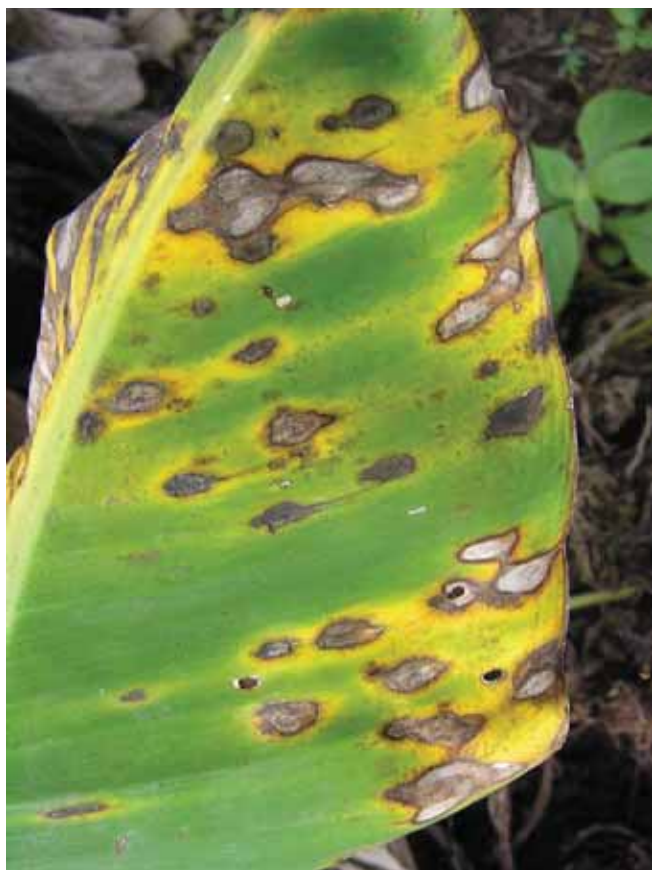
Symptoms of black leaf streak disease on young banana suckers (above, left) differs from the symptoms on mature plants. On water suckers (young plants not attached directly to a living mother plant), streaks rarely form; instead there are circular leaf spots ranging in color from black to brown to grayish, depending on the stage of plant and lesion development.