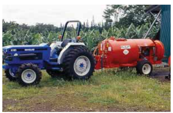
Mist-blower rig for fungicide applications