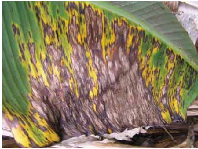
In areas with high rainfall, necrotic banana leaves turn very dark in color as the dead tissues becomes waterlogged. Hundreds of smaller black leaf streak lesions coalesce to form large, blighted areas on banana leaves.