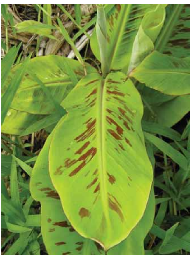
On some varieties such as Cavendish types, leaves of young banana suckers naturally have maroon-colored blotches that should not be mistaken for symptoms of black leaf streak disease. These blotches are not present on leaves of older plants.