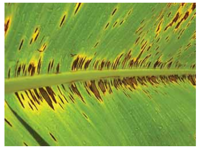
Lesions associated with leaf midribs reflect depleted fungicide ingredients in the leaf tissues due to translaminar flow. On mature banana leaves where triazole fungicides or translaminar fungicides are used to control black leaf streak, lesions appear first at the leaf midrib as the fungicide moves within tissues to distal parts of the leaves. As lesions expand and age, they develop tan colored centers but retain dark colored margins and may be surrounded by intensely yellow halos.

and D. Ogata. www.ctahr.hawaii.edu/oc/freepubs/pdf/PD-12.pdf.