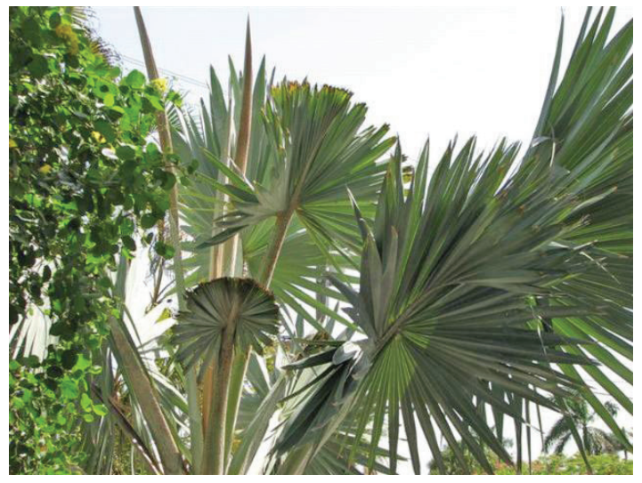
Figure 16. Boron-deficient new leaves produced for several months following cold weather. Note the multiple unopened spear leaves, a characteristic of chronic boron deficiency.