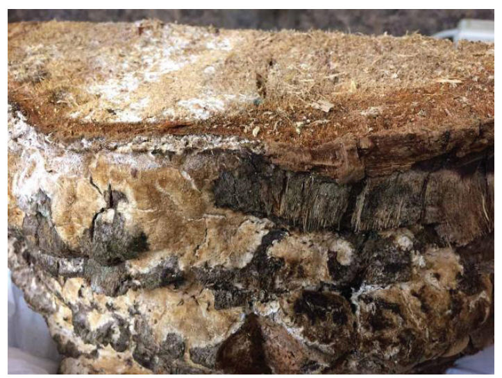
Figure 11. Trunk section of cold-damaged date palm ( Phoenix dactylifera ), showing colonization by the secondary fungus Ceriporia sp.