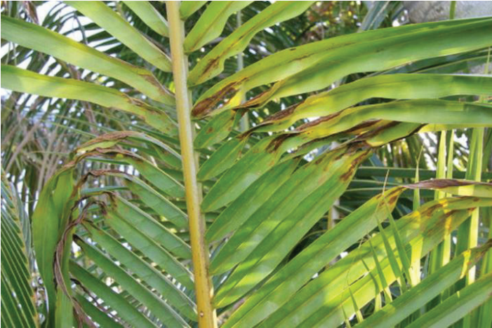
Figure 14. Cold-damaged leaflets in the middle of a newly emerging leaf of coconut palm ( C. nucifera ).