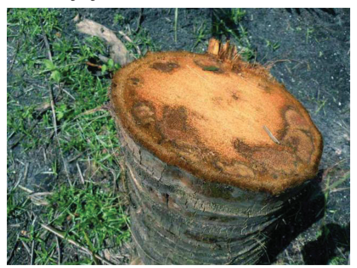
Figure 7. Soft, sunken, reddish areas on coconut palm ( C. nucifera ) trunk caused by prolonged chilling or freezing temperatures.

a cracking of the pseudobark, but often it occurs beneath the pseudobark and does not become apparent until the thepseudobark and large portions of the trunk have decayed and fallen off (Figure 10). In other cases, the canopy wilts, and collapses (due to destruction of the vascular tissue) or the trunk collapses (lack of structural integrity). In either case, the palms usually live for at least two years, and often longer, before the problem becomes apparent, and no fungal growth is ever observed.