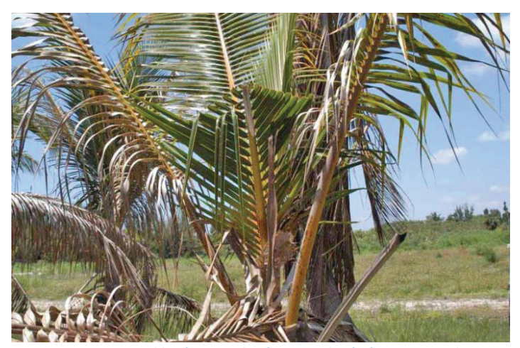
Figure 13. Truncated leaf tip on the first new leaf of coconut palm ( C. nucifera ) emerging after cold weather event.

(Figure 16) (see Boron Deficiency in Palms, https:// edis.ifas.ufl.edu/publication/ep264). These deficiencies are likely the result of cool soil temperatures that occurred about four months prior to the emergence of the affected leaves and slowed the rate of nutrient absorp-tion by the roots. As soil temperatures warm up, these deficiencies typically are resolved without supplemental fertilization. Some people have advocated foliar sprays with micronutrient fertilizer blends following cold weather events to help correct these problems. However, since most of the foliage will be necrotic following a cold temperature event, the uptake of nutrients through the leaves is minimal at best. Routine applications of a complete landscape palm fertilizer (see Fertilization of Field-grown and Landscape Palms in Florida, https://edis.ifas.ufl.edu/ publication/ep261, for specific recommendations) are more helpful in preventing these cold-induced deficiencies; the fertilizer also enhances palm cold hardiness.