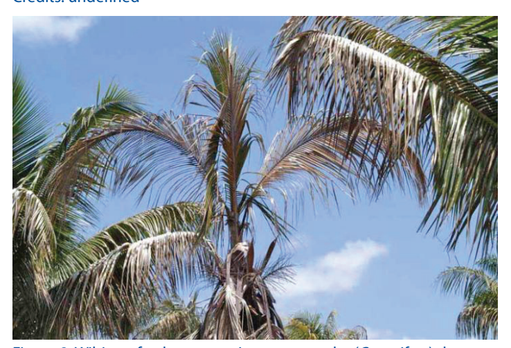
Figure 8. Wilting of palm canopy in coconut palm ( C. nucifera ) due to secondary rotting of cold-damaged trunk tissue about three months after prolonged chilling temperatures. Credits: undefined

Trunk damage to date palms ( Phoenix dactylifera ) occurs in yet a different manner. Again, secondary fungi invade the damaged trunk tissue, but the fungus causing the decay is often observed on the outside of the trunk (Figure 11). These fungi are not pathogens (fungi infecting healthy trunk tissue), but saprophytes (fungi using damaged tissue as a food source). One of these fungi has been identified as