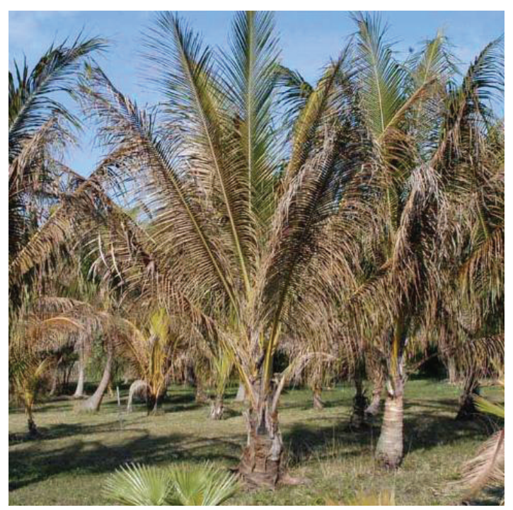
Figure 5. Chilling injury on coconut palm ( C. nucifera ), showing uniform leaflet necrosis on mid- to lower-canopy leaves. Note that the petioles (leaf stems), rachises (the portion of the petiole to which leaflets are attached), and youngest leaves are still alive. Credits: undefined

eventually, the collapse and toppling of the entire crown (Figure 9). These symptoms appear several months after the cold weather event.