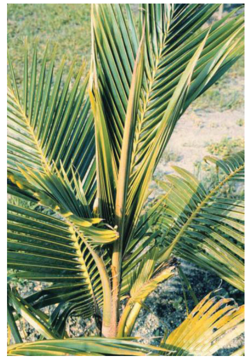
Figure 15. Temporary manganese deficiency in coconut palm ( C. nucifera ) caused by cool soil temperatures four months earlier. Note that the newest leaves are less deficient than the first ones to emerge following the cold weather.