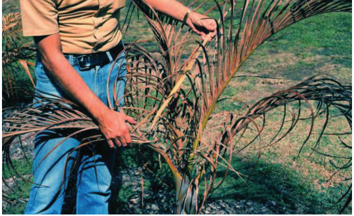
Figure 2. Spear leaf basal rot in spindle palm ( Hyophorbe verschafeltii ) following a hard freeze. Credits: undefined