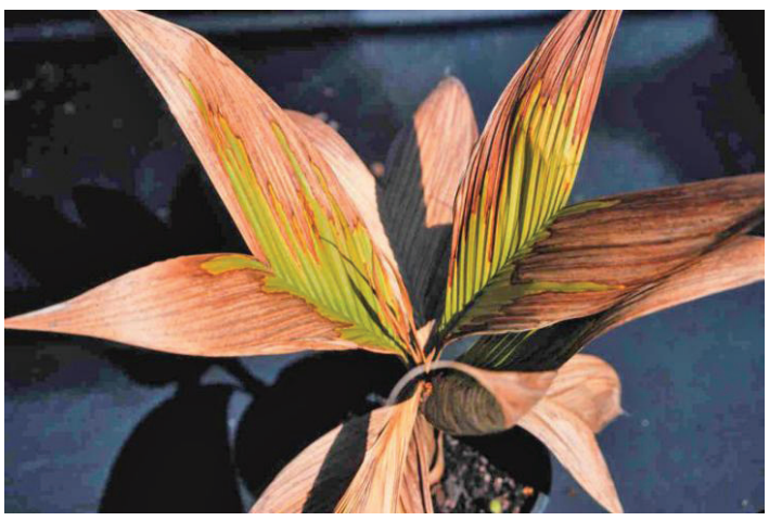
Figure 3. Chilling injury on Geonoma sp.

Deficiency in Palms, https://edis.ifas.ufl.edu/publication/ep269), also causes leaflet necrosis, this necrosis is most severe on the oldest leaves toward the leaf tips (Figure 6). Thus, the sudden appearance of extensive leaflet necrosis on mid- and lower-canopy leaves caused by cold temperatures can be easily distinguished from the leaf tip necrosis on the oldest leaves caused by potassium deficiency.