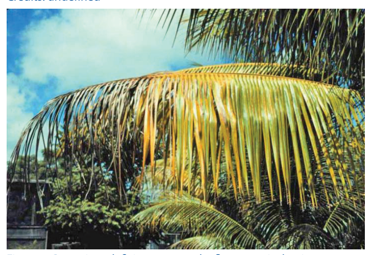
Figure 6. Potassium deficiency causes leaflet necrosis that is most severe on the tips of oldest leaves.

Collapse of palm canopy in coconut palm ( C. nucifera ) due to secondary rotting of cold-damaged trunk tissue about three months after prolonged chilling temperatures.