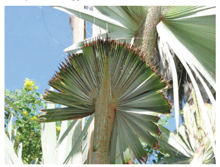
Figure 12. Truncated leaf tip on the first new leaf of Bismarckia nobilis emerging after cold weather event. Credits: undefined

Once warm weather returns and growth resumes, newly emerging leaves often have truncated leaf tips (Figures 12 and 13) or even necrotic leaflets in the middle of a leaf (Figure 14). If the rachis itself has been severely damaged on this leaf, the otherwise healthy leaf tip may fall off. This type of damage occurred on the primordial leaves prior to their emergence and expansion. Subsequent leaves are usually normal in appearance.