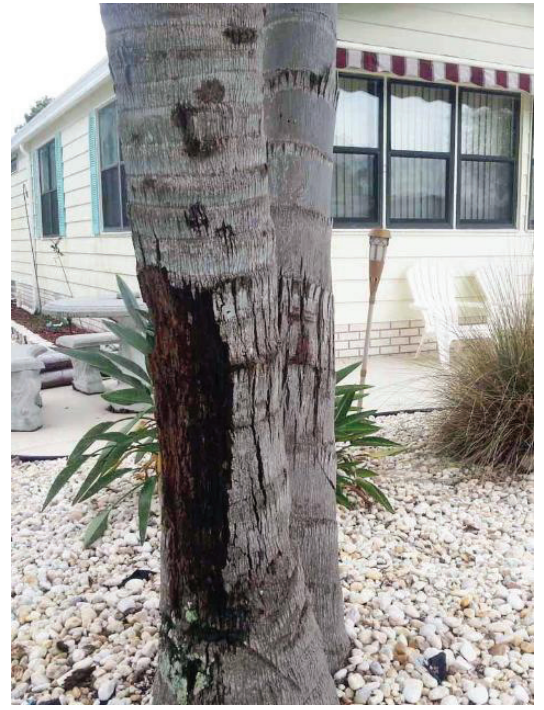
Figure 10. Internal decay of cold damaged queen palm ( Syagrus romanzoffiana ), showing early symptoms of cracked pseudobark on right stem and complete loss of decayed pseudobark and trunk tissue on left stem several years after cold event. Credits: undefined