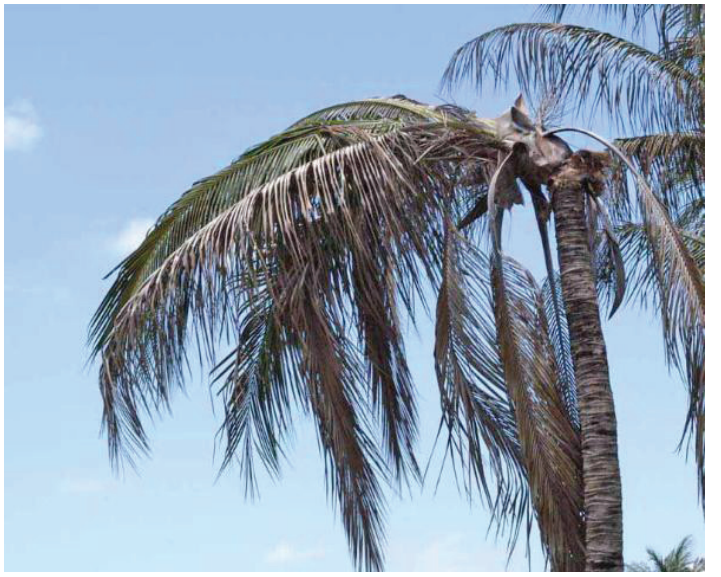
Figure 9. Collapse of palm canopy in coconut palm ( C. nucifera ) due to secondary rotting of cold-damaged trunk tissue about three months after prolonged chilling temperatures.

a Ceriporia sp., a white rot crust fungus that destroys lignin within the trunk. Lignin is the compound which provides most of the structural strength in palm trunks. Thus, if the lignin is destroyed (even in a dead or dying palm), the palm trunk loses its structural integrity and collapses.