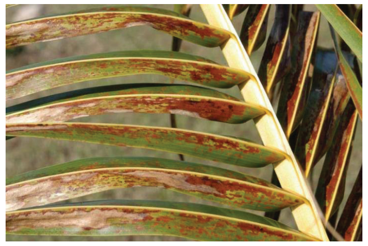
Figure 4. Reddish blotches are symptoms of mild chilling injury in coconut palm ( Cocos nucifera ).

Palm trunks may also be damaged by cold weather, which results in the damaged tissue to be invaded by secondary fungi and/or bacteria that cause trunk decay. Three different types of trunk damage have been observed. While the damage described was observed on specific palm species, similar damage is quite possible on other palm species. Coconut palms subjected to prolonged temperatures in the low to middle 30°sF or below often have soft, sunken, reddish areas on the trunk (Figure 7). These cold-damaged trunk areas are often invaded by secondary fungi and/or bacteria that cause trunk rot. The rotting of the vascular system in the trunk results in leaf wilt (Figure 8) and,