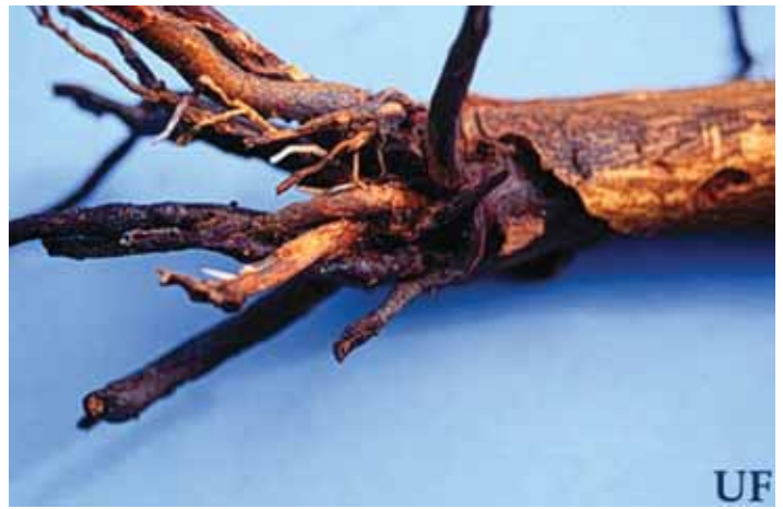
Figure 7. Damage to citrus tree roots by Diaprepes abbreviatus (L.).

Parasitism of Diaprepes abbreviatus larvae by other insects is lacking, probably because of the location of immatures in the soil. However, eggs are more or less exposed. A wasp, Tetrastichus haitiensis , parasitic on eggs of Diaprepes abbreviatus has been released in the U.S., but has not proven effective at reducing weevil populations in the field.