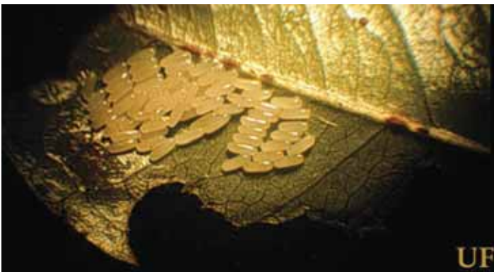
Figure 3. Egg mass of Diaprepes abbreviatus (L.), on citrus leaf.

(Figure 3) The eggs are usually laid in an irregularly shaped cluster in a single layer. They are oblong-oval in shape and are smooth, pale yellowish-white and glistening. Eggs are about 1.2 mm (1/20 inch) long and about 0.4 mm (1/60 inch) wide.