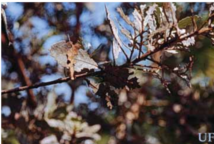
Figure 6. Damage—notching on leaves—by Diaprepes abbreviatus (L.).

Notching (Figure 6) along the margins of young leaves is a telltale symptom of the presence of Diaprepes abbreviatus adults, or other related root weevils. However, other pests such as grasshoppers and caterpillars may produce similar damage. Therefore, it is best to look for a sign, such as the pest doing the damage. Look for Diaprepes abbreviatus adults during the day on the foliage. Shaking the plant may aid in detection as adults fall off of the plant onto the ground. A light colored piece of canvas placed beneath the plant before shaking is useful. Do not look immediately after a heavy rain, which usually knocks weevils off of the plant.