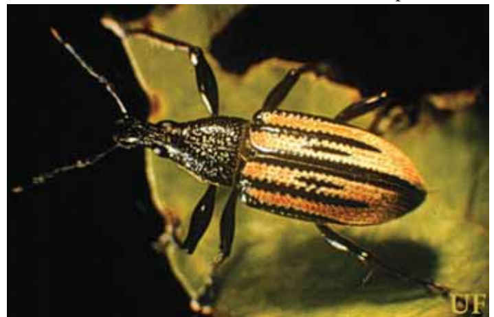
Figure 1. Adult Diaprepes abbreviatus (L.).

The adult weevils (Figure 1) vary in length from 0.95 to 1.90 cm (3/8 to 3/4 inch). They are black, and overlaid by minute white, red orange, and/or yellow scales on the elytra (wing covers). These scales are often rubbed off of the tops of ridges on the elytra giving the appearance of black stripes on a light colored background. Adults emerging from pupae in the soil are armed with a pair of deciduous mandibles (Figure 2) that break off as they tunnel through the soil to get above ground. Scars at the site where the deciduous mandibles break off are visible under a microscope.