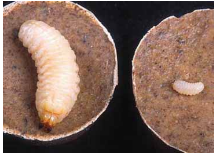
Figure 5. Young (right) and older (left) larvae of the diaprepes root weevil, Diaprepes abbreviatus (Linnaeus), on cakes of an artificial diet developed by the USDA-ARS.