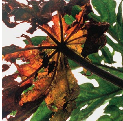
Figure 9. Papaya leaf feeding.