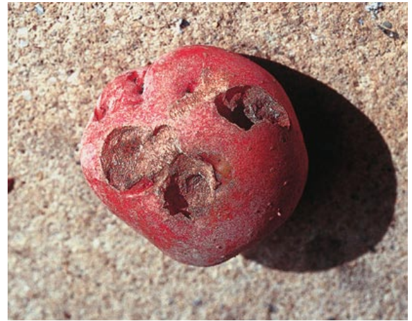
Figure 15. Larval feeding on potato.