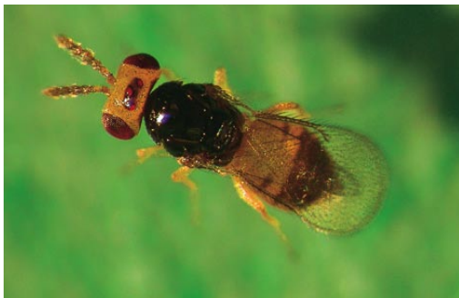
Figure 22. A parasitic wasp ( Aprostocetus vaquitarum ) that attacks Diaprepes eggs.

A number of species of small parasitic wasps that attack the egg stage of the Diaprepes root weevil were collected from the Caribbean and released in Florida from 1998 to 2001 (Hall et al. 2001). Two of the parasites, Aprostocetus vaquitarum (fig. 22) and Quadrastichus haitiensis , have become established. The levels of parasitism in southern Florida range from 70 to 80 percent. However, in central Florida, parasitism is only 5 percent. This variability may be due to differences in winter temperature or differences in application of various pesticides.