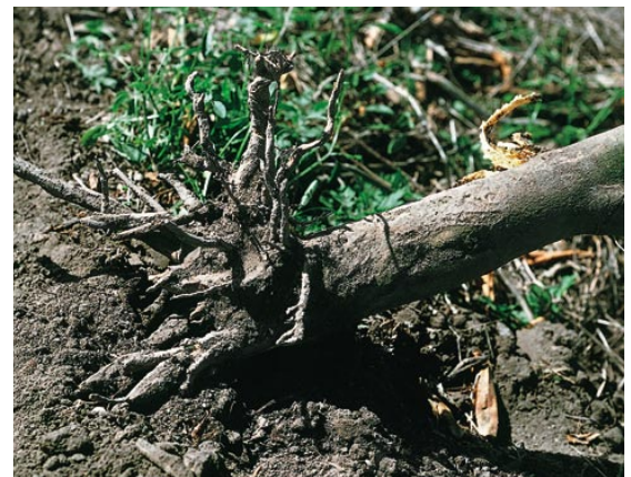
Figure 17. Eventually, Diaprepes may girdle the crown of citrus.