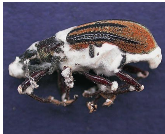
Figure 24. Adult Diaprepes killed by fungi.

In field trials, the entomopathogenic fungus Beauveria bassiana applied as a soil drench killed larvae and newly emerging adult root weevils (fig. 24), but the fungus had limited persistence in the soil and required application rates that were cost-prohibitive. Studies are underway to induce outbreaks of this fungus in adults.