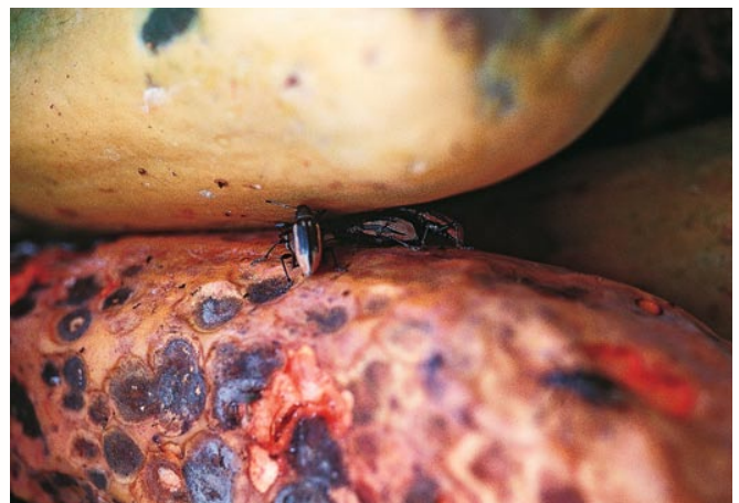
Figure 11. Papaya fruit feeding by adults.

Adult Diaprepes weevils feed along the edges of leaves, creating semicircular notches (figs. 8–10). They prefer young, tender leaves over older leaves. On rare occasions, adults may feed on fruit. Fruit feeding is usually limited to papaya (fig. 11) and citrus (fig. 12). Damage caused by adult weevils is similar to damage caused by other citrus weevils such as Fuller rose beetle ( Asynonychus godmani ), so it is important to locate and identify the weevil that is causing the damage. In addition to notching, Diaprepes adults leave frass scattered on the leaves (fig. 13). Adults are sometimes difficult to find because they feed during the early morning and late afternoon, hiding in the foliage during the day. However, they may be dislodged by shaking the foliage over a light-colored cloth. The trees on which the feeding damage is seen are the trees that should be sampled. In citrus groves with well-established populations, weevils may be found on every tree or sometimes aggregated on just a few trees.