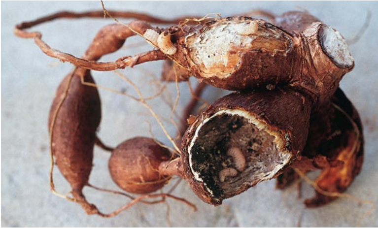
Figure 14. Larval damage to cassava root.