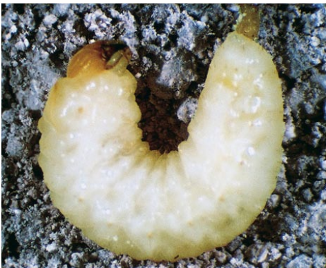
Figure 6. Late-instar Diaprepes larva inhabiting soil.