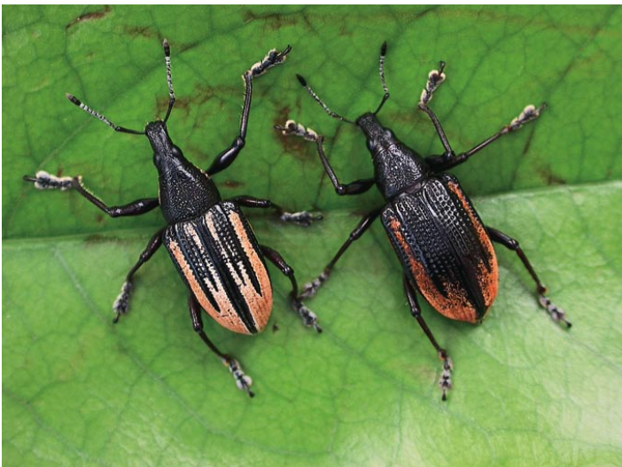
Figure 1. Diaprepes root weevil adults vary in color and striations.

Diaprepes root weevil feeds on more than 270 species of plants from 59 plant families (Simpson et al. 1996). Some of the more common hosts are citrus (all varieties), peanut, sorghum, guinea corn, corn, Surinam cherry, dragon tree, sweet potato, sugarcane, panicum grasses, coffee weed (sesbania), and Brazilian pepper. Because of its broad host range, the Diaprepes root weevil poses a great threat to citrus and ornamental plant industries in California.