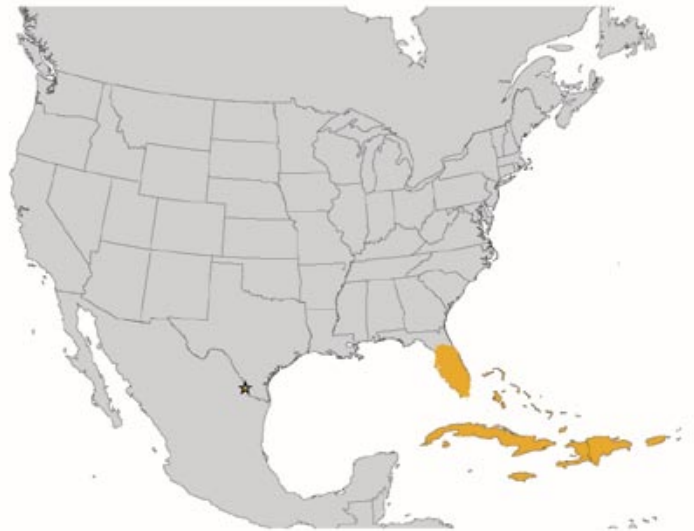
Figure 2. Current distribution of Diaprepes root weevil. Note population in South Texas.