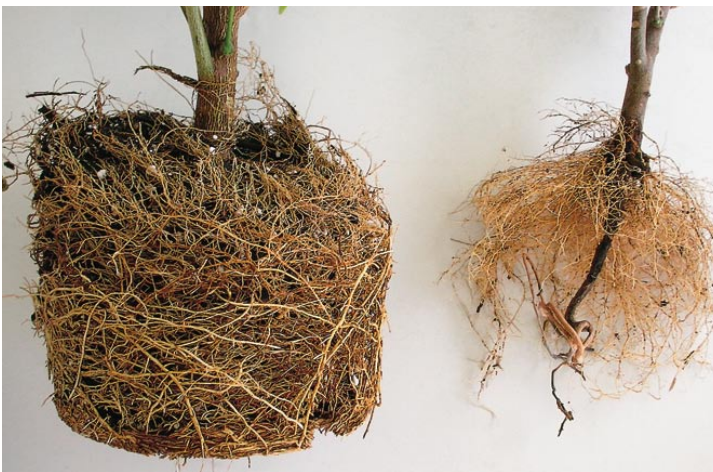
Figure 16. Loss of root hairs due to Diaprepes feeding (right), compared with normal roots (left).