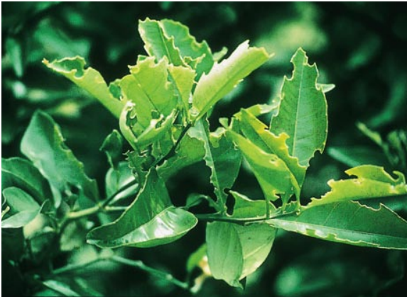
Figure 8. Citrus leaf feeding by Diaprepes adults.