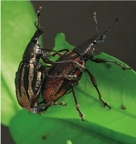
Figure 3. Mating pair of Diaprepes root weevils.