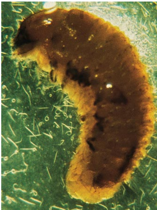
Figure 23. Diaprepes larva killed by nematodes.

Entomopathogenic nematodes, both native and commercially available, have been found to cause significant mortality to Diaprepes root weevil larvae in sandy soils in Florida and the Caribbean (McCoy et al. 2000) (fig. 23). The nematodes are ineffective in heavier, clay loam soils with a small particle size. This lack of effectiveness may be due to the inability of the nematodes to move through the smaller pore spaces found in the heavier soils.