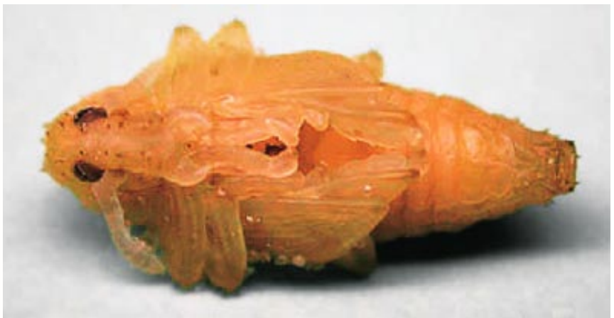
Figure 7. The pupal stage of Diaprepes can be found in the soil.

Adult weevils are capable of strong flight for a short duration and distance. Once the weevils land, they tend to stay on that