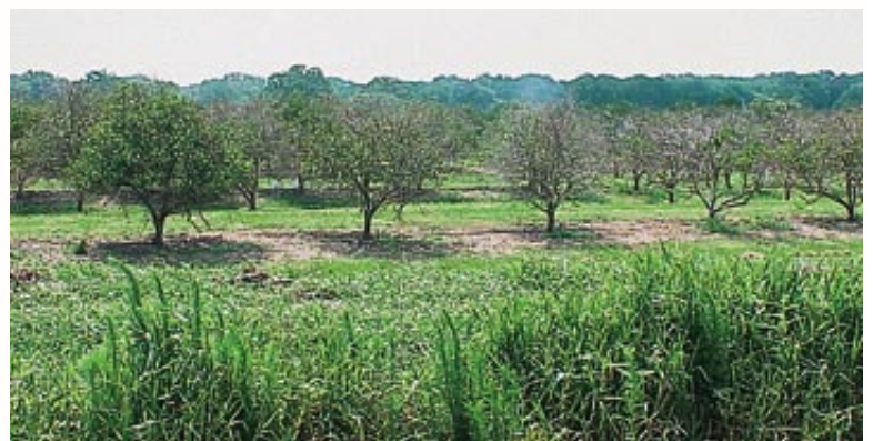
Figure 18. Citrus trees declining due to a heavy infestation of Diaprepes root weevil in Osceola County, Florida.

Larvae of the Diaprepes root weevil cause extensive damage to their host plants by feeding on the roots, tubers, or other underground portions. In cassava and potatoes, the larvae feed directly on the tubers (figs. 14–15). In citrus, they begin by feeding on the smallest roots, and as the larvae grow, they move to the larger structural roots (fig. 16). Eventually they may girdle the large lateral roots or the crown area of the tree (fig. 17). In laboratory studies, citrus rootstocks commonly used in the United States showed no resistance or tolerance to feeding by Diaprepes root weevil larvae. Many citrus trees do not show symptoms of decline (e.g., leaf yellowing, wilting, defoliation, etc.) until extensive damage has been done to the root system (fig. 18). Damage is particularly serious in groves where trees are planted in poorly drained soils that