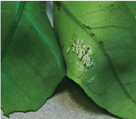
Figure 4. Cluster of Diaprepes eggs deposited between leaves.