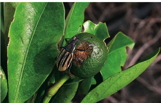
Figure 12. Citrus fruit feeding.