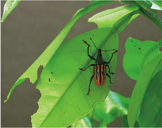
Figure 19. Inspect notched leaves, such as the citrus leaves shown here, for the presence of Diaprepes adults.