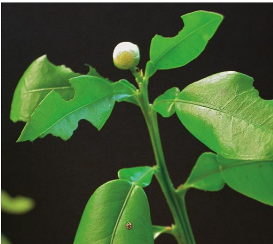
Figure 20. Characteristic notching on citrus leaves. Adults may hide in sheltered parts of the plant during the day.