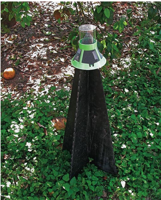
Figure 21. A Tedders ground trap captures adults as they emerge from pupating in the soil.

are optimal for larval development (McCoy 1999). The feeding activity of the larvae may also make the plant more susceptible to root rot organisms such as Phytophthora spp. (Graham et al. 2002).