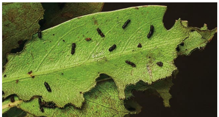
Figure 13. Frass (excrement) left behind by feeding adults.