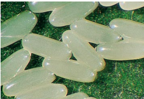
Figure 5. Diaprepes eggs are slightly over 0.04 inch (1 mm) long.