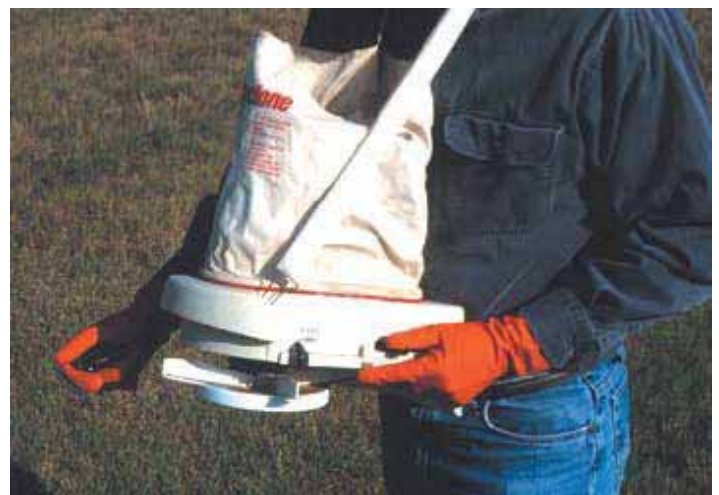
Figure 3. Hand-held bag sprayer for fire ant treatment application

Note: See the section on Fire Ant Treatment Methods, for information about biological control, home remedies, and insecticide products and their proper use. Use only pesticides labeled for the location or "site" you want to treat. For instance, DO NOT use a product in your vegetable garden unless that site is listed on the label.