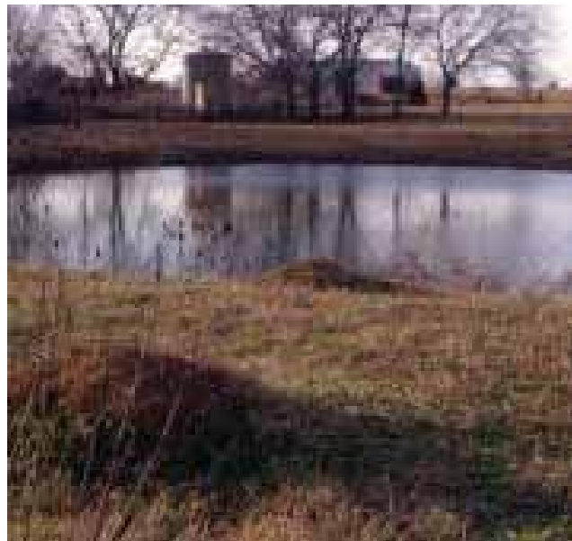
Figure 7. Imported fire ant mounds near farm pond.

To decrease the risk of pesticide runoff into waterways, apply baits when ants are actively foraging. Read the label carefully and do not apply closer to the edge of the body of water than allowed on the label. When treating individual mounds near the water’s edge or in drainage or flood-prone areas, exercise special care and use products such as acephate (Orthene®) that have relatively low toxicity to fish and apply the product according to label directions. Pyrethrins, pyrethroids and rotenone products should be avoided because of their high toxicity to fish. Do not apply surface, bait or individual mound treatments if rains are likely to occur soon after treatment. Nearly all insecticides can be toxic to aquatic organisms if applied improperly.