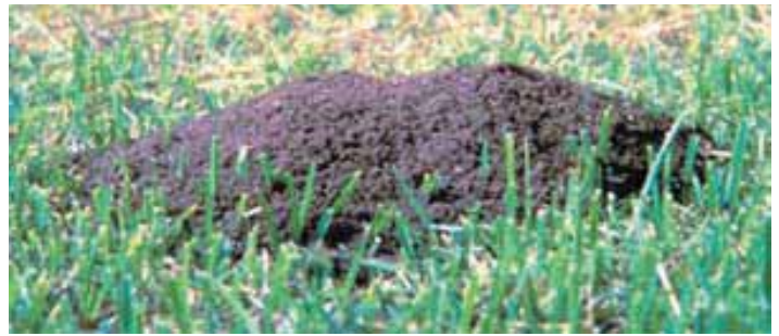
Figure 18. A typical fire ant mound

Attempts in the late 1960's and early 1970's to eradicate the red imported fire ant were not successful. The pesticides used, although effective, were no match against a species capable of re-invading treated areas. The reasons for failure are debatable, but it is now known that eradication is hindered by the ant's biology and by problems with treatment methods. Recent attempts to eradicate S. invicta from parts of California and Australia using new products and treatment methods have shown very promising results. Successful eradication of the imported fire ant in large areas has yet to be documented.