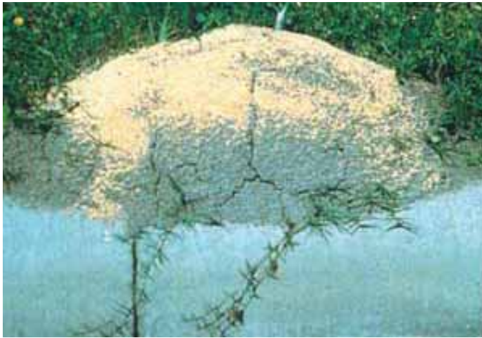
Figure 14. Treatment for fire ants with a granular product.

To treat a single mound with a granular product, measure the recommended amount in a measuring cup labeled “POISON” for pesticide use only. Then sprinkle it on top of and around the mound. Do not disturb the mound. If the label says to water in the insecticide, use a sprinkling can and water the mound gently to avoid disturbing the colony. Several days may pass before the entire colony is eliminated.