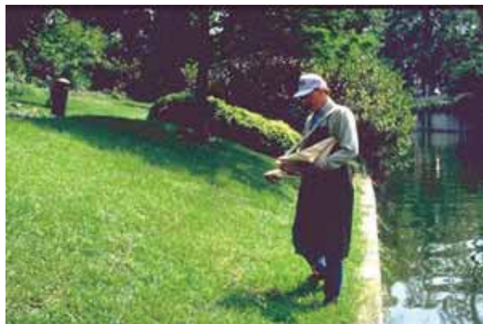
Figure 8. Man applying fire ant bait near water using a hand-held spreader.