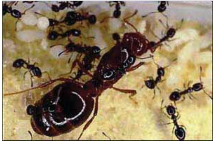
Figure 10. Little black ants attacking fire ant queen. Credits: A. Rao

(= Thelohania solenopsae , is also widespread in some states. Although natural enemies will not eliminate fire ants and it may be several years before their effect is known, it is hoped that introducing natural enemies of fire ants in the U.S. will reduce their populations indefinitely. In South America, where imported fire ants and their natural enemies originate, fire ant species are not usually considered pests but rather just another ant species. See Natural Enemies of Fire Ants .