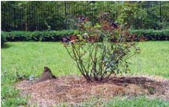
Figure 1. An unsightly mound built by imported fire ants.

This publication is updated quarterly. For the most current version of this document, refer to the version posted on the Imported Fire Ants site, http://www.extension.org/pages/11004/managing-imported-fire-ants-in-urban-areas-printable-version .