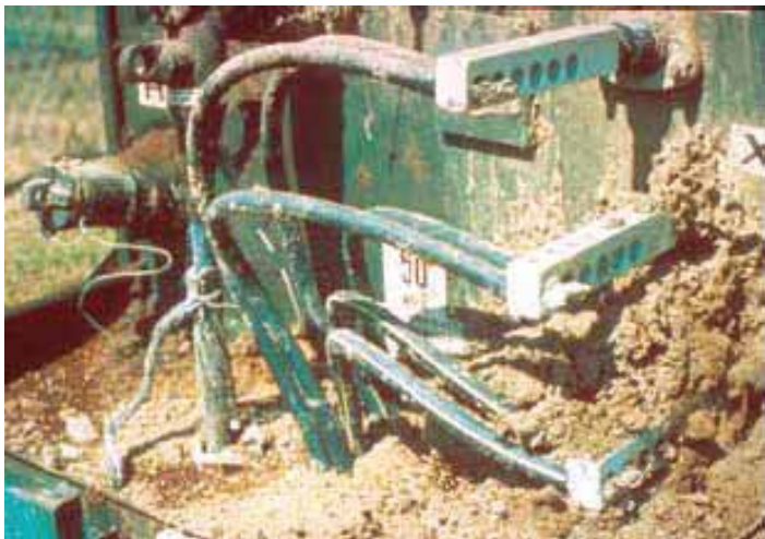
Figure 5. Fire ant mounds in electric utility housing.

and soil from the equipment housings to reduce the possibility of short circuits.