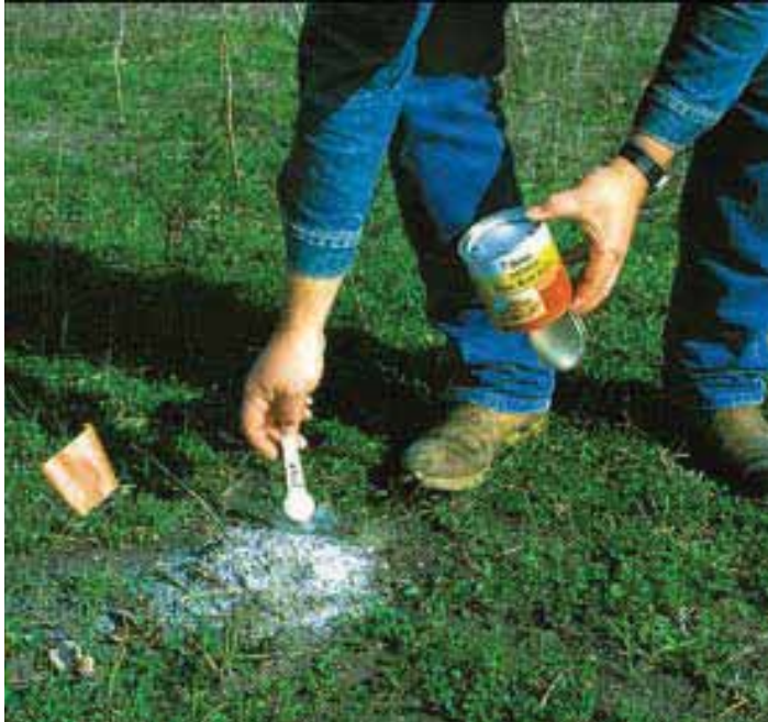
Figure 4. Individual fire ant mound treatment

Continue treating undesirable mounds that appear, as needed.