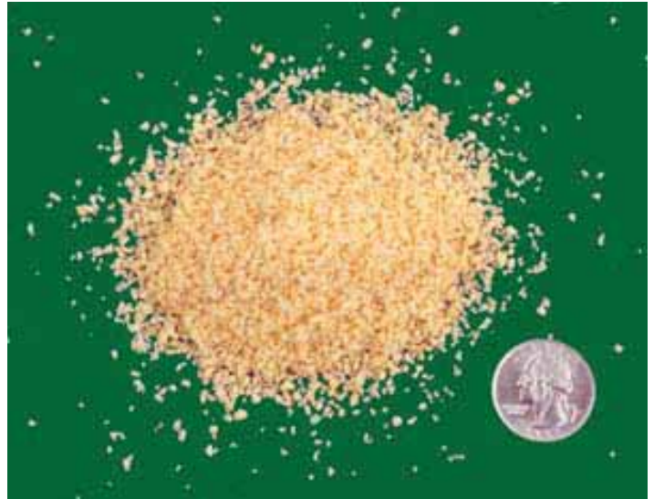
Figure 12. Pile of fire ant bait compared to size of quarter.

foraging ants. To check the quality of your bait, place a little near an ant mound to see if ants are attracted to it as described below. It is important not to smoke while using the bait or place the bait near gasoline. The ants detect the smell and are repelled.