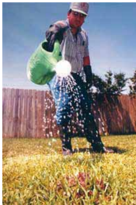
Figure 13. Individual fire ant mound treatment using chemical drench.

Although a few are ready-to-use, most fire ant mound drenches are formulated as liquid concentrates that must be diluted with the amount of water specified on the label. Avoid skin contact with the concentrate or mixture. Mix the proper amount in a gallon container, such as a sprinkling can, plainly marked POISON. Do not use the container for any other purpose. Properly store or discard containers after use. Pour the solution on top of and around an undisturbed mound. Most mound drenches require an hour to several days to eliminate the colony, although those containing pyrethrins and d-limonene are effective almost immediately.