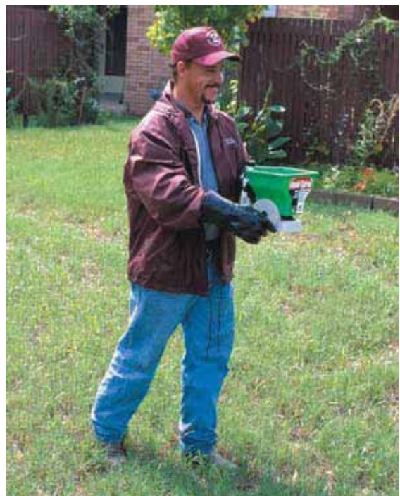
Figure 15. Man applying fire ant broadcast bait treatment to lawn using hand-held spreader.

Several products said to be “organic” (of natural origin) are currently marketed for fire ant control. These products may or may not be registered as pesticides by the EPA and the appropriate state regulatory agency. In 1996 the EPA established that certain ingredients that pose minimum risk to users no longer require EPA approval to be marketed as insecticides. These products are called “25 b” products, referring to that clause in FIFRA, the Federal Insecticide, Fungicide and Rodenticide Act). Some of the “organic” products fall into the minimal risk category. Therefore, not every product sold for fire ant control is supported by research-based evidence that it is effective against fire ants.