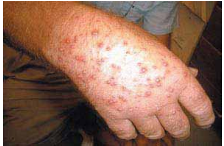
Figure 19. Pustules formed from fire ants stings on adult hand.

Flooded fire ants float on water. These ants should be especially avoided as they carry more venom, inject more venom per sting and are very aggressive.