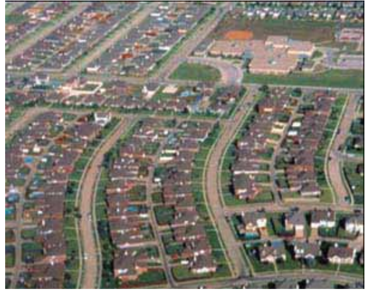
Figure 9. Typical urban neighborhood.

fewer than if no bait had been applied. In other areas, where ant surveys have documented that there are few imported fire ants and many competitor ant species, Program 2, or program combinations, may be more suitable.