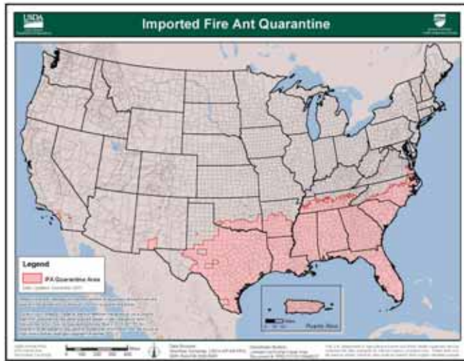
Figure 2. Imported Fire Ant U.S. Quarantine Map, USDA ( http://www.aphis.usda.gov/plant_health/plant_pest_info/fireants/downloads/fireant.pdf )

Because fire ants are easily transported in nursery stock and soil, the United States Department of Agriculture's Animal and Plant Health Inspection Service (USDA-APHIS) developed a quarantine program for this pest in the 1950s.