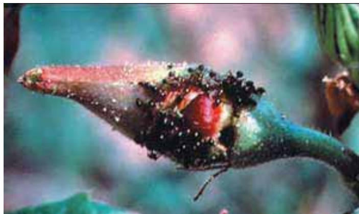
Figure 6. Fire ants feeding on okra bud.

Ants occasionally feed on vegetable plants in home gardens. They tunnel into potatoes underground and feed on okra buds and developing pods. The worst damage usually occurs during hot, dry weather. Ants may be a nuisance to gardeners during weeding and harvesting. Ants prey on some garden pests such as caterpillars, but protect or “tend” others, such as aphids, by keeping their natural enemies away.