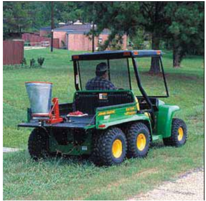
Figure 11. Man applying fire ant treatment with spreader attached to the back of a Gator utility vehicle.

Various mechanical and electrical products have been marketed for fire ant control. One device was designed to electrocute fire ant workers as they climb onto an electric grid inserted into the mound or into a cone. These devices kill many worker ants, but the queens and brood are unaffected. There have been vibrating and sound-producing units designed to repel colonies, and devices that use microwaves or explosive elements to heat mounds or blow them up. Such products are often marketed without scientific evaluation. The fact that a “control” device is on the market does not indicate that it is effective. These products may kill some ants, but rarely eliminate a colony. Deceptive or fraudulent claims concerning fire ant control devices should be reported to the state’s attorney general or the Federal Trade Commission. See Museum of Novel Fire Ant Control Methods and Products .