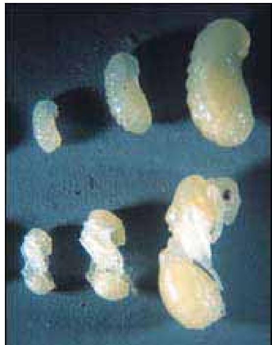
Figure 16. Larval (top) and pupal (bottom) stages of imported fire ant.