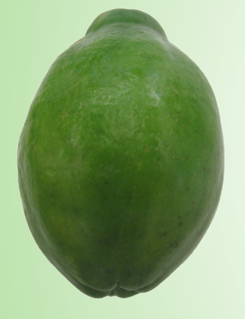
TINGE (color break)

Green fruits will not ripen properly (sugar content too low, color won't change, fruit may not soften, etc.). Low-quality fruits reflect poorly on Hawai'i's papaya industry. Therefore, green fruits should generally not be harvested, though clients who specifically request green papaya should be accommodated.