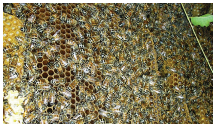
Figure 1. Adult African honey bees, Apis mellifera scutellata Lepeletier, on comb in colony.