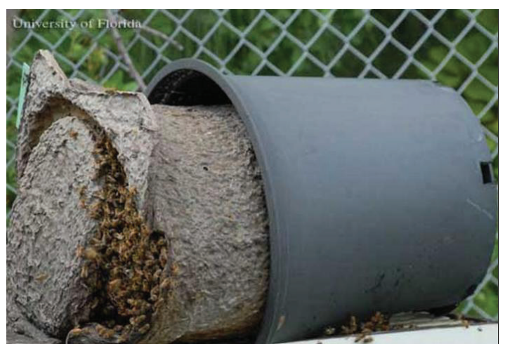
Figure 8. African honey bee, Apis mellifera scutellata Lepeletier, colony that has established itself in a swarm trap.

been established. These precautions are not suggested to make people fearful of honey bees but only to encourage caution and respect of honey bees. The precautions include remaining alert for honey bees flying into or out of an area (suggesting they are nesting nearby), staying away from a swarm or nest, and having wild colonies removed from places that humans frequent. The latter is perhaps the most important advice one can heed when dealing with African bees. In the US, a large percentage of African bee attacks occur on people who know a nest is present but elect not to have it removed (or try to do it themselves).