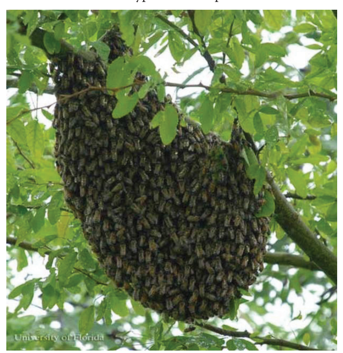
Figure 5. African honey bee, Apis mellifera scutellata Lepeletier, swarm in tree.

Another behavioral difference between African and European bees concerns colony level reproduction and nest abandonment. African honey bees swarm and abscond in greater frequencies than their European counterparts. Swarming, bee reproduction at the colony level, occurs when a single colony splits into two colonies, thus helping to ensuring survival of the species. European colonies commonly swarm one to three times per year. African colonies may swarm more than 10 times per year. African swarms tend to be smaller than European ones, but the swarming bees are docile in both races. Regardless, African colonies reproduce in greater numbers than European colonies, quickly saturating an area with African bees. Further, African bees abscond frequently (completely abandon the nest) during times of dearth or repeated nest disturbance, while this behavior is atypical in European bees.