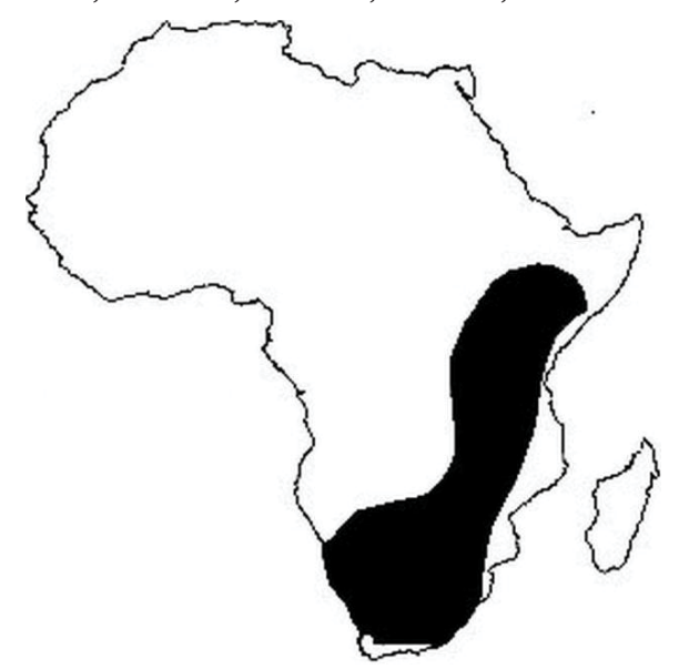
Figure 3. Native distribution of Apis mellifera scutellata.

The spread of African bees throughout South and Central America—fueled by rapid hybridization with European subspecies and the dominance of many African alleles over European ones—occurred at a rate of 200 to 300 miles per year. Because their movement through South and Central America was rapid and largely unassisted by humans, African bees earned the reputation of being one of the most successful biologically invasive species of all time. In 1990, populations of African honey bees had saturated South and Central America and begun to move into the US. As of 2012, African honey bees had been found in the southernmost USA: Texas, California, New Mexico, Arizona, Oklahoma, Louisiana, Arkansas, Alabama, and Florida.