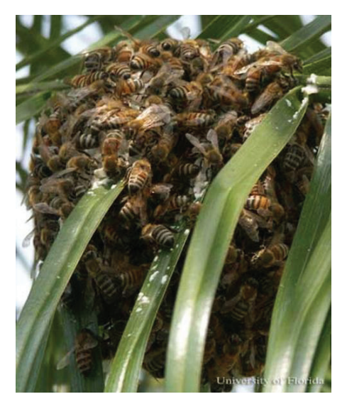
Figure 6. African honey bee, Apis mellifera scutellata Lepeletier, swarm on palm fronds.

Other behavioral differences between African and European races exist and are worth discussing briefly. For example, African bees are often more 'flighty' than European bees, meaning that when a colony is disturbed, more of the bees leave the nest rather than remain in the hive. African bees use more propolis (a derivative of saps and resins collected from various trees/plants) than do European bees. Propolis is used to weather-proof the nest and has various antibiotic properties. African colonies produce proportionally more drones (male bees) than European bees. Their colonies grow faster and tend to be smaller than European colonies. Finally, they tend to store proportionately less food (honey) than European bees, likely a remnant of being native to an environment where food resources are available throughout the year.