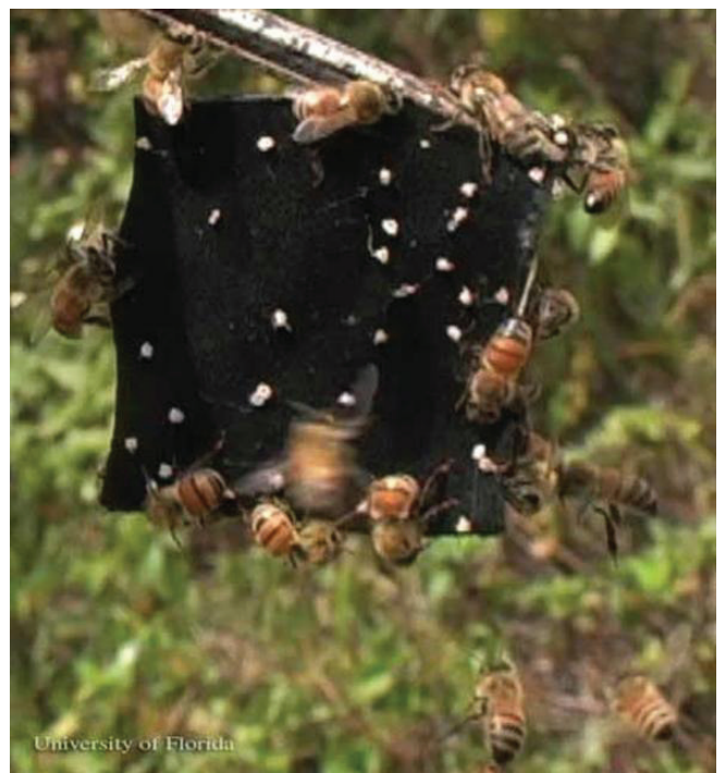
Figure 9. Defensive African honey bees, Apis mellifera scutellata Lepeletier, stinging black cloth and leaving behind stinger and venom sacs

plumbing-related gaps that are more than 30 mm wide using a small-mesh hardware cloth or caulking. This will limit bee access to potential nesting sites. Finally, one should check walls and eaves of structures regularly, looking for bee activity.