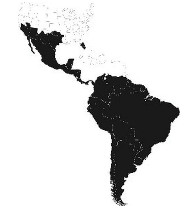
Figure 4. Distribution of Apis mellifera scutellata in the Americas as of 2007.