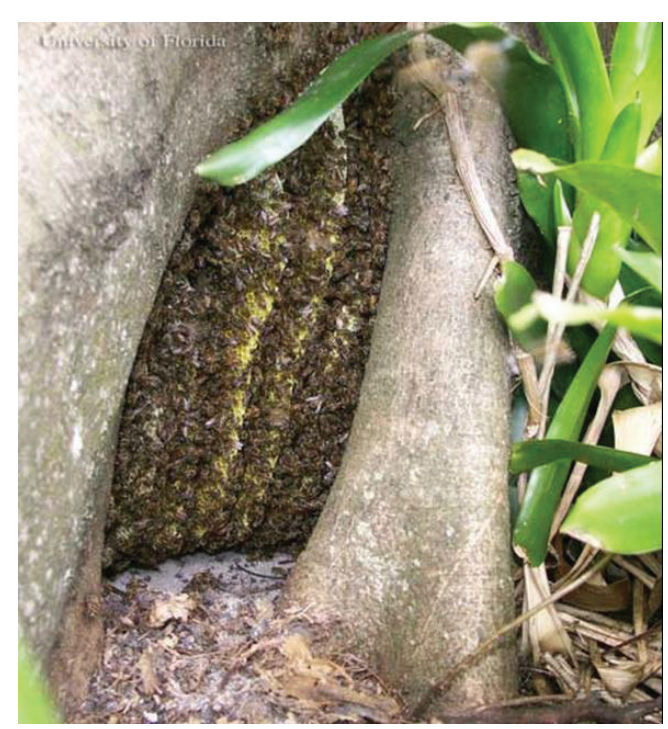
Figure 7. An African honey bee, Apis mellifera scutellata Lepeletier, colony between buttress roots of a tree.