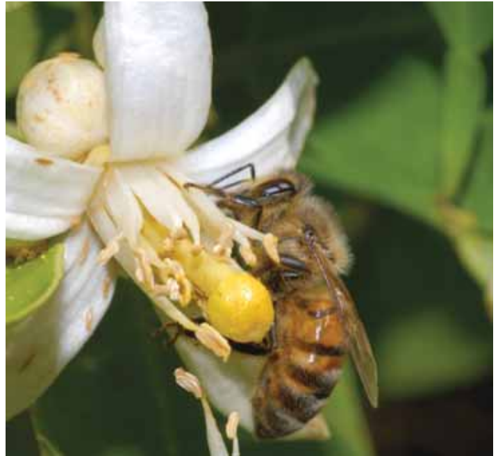
Figure 1. Honey bee on an orange blossom.

Honey bees consume processed nectar (honey) and pollen (bee bread), both of which are provided by flowers (Figure 1). Nectar, which bees convert to honey, serves as the primary source of carbohydrates for the bees. It provides energy for flight, colony maintenance, and general daily activities. Without a source or surplus of carbohydrates, bees will perish within a few days. This is why it is important to make sure that colonies have sufficient honey stores during the winter months. Colonies can starve quickly! Nectar also is a source of various minerals, such as calcium, copper, potassium, magnesium, and sodium, but the presence and concentration of minerals in nectar varies by floral source.