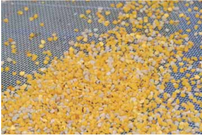
Figure 4. Pollen that has been collected from a pollen trap placed on the bottom board of a bee hive.

the pollen release nutrients and amino acids. Bee bread is consumed by a colony relatively quickly and only stored for a couple of months if there is a surplus. A colony's annual requirement for pollen has been estimated to range from 15 to 55 kg.