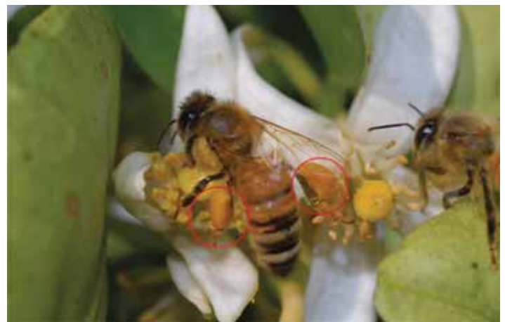
Figure 3. Worker bee carrying pollen in her pollen baskets.

It has been observed that honey bee workers choose pollen based on the odor and physical configuration of the pollen grains rather than based on nutritive value. A typical size honey bee colony (approximately 20,000 bees) collects about 57 kg of pollen per year. On average, 15–30% of a colony's foragers are collecting pollen. A single bee can bring back a pollen load that weighs about 35% of the bee's body weight. Bees carry this pollen on their hind legs, on specialized structures commonly called "pollen baskets" or corbicula (Figure 3).