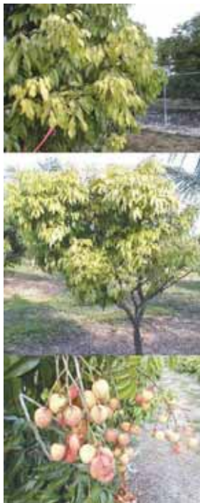
Figure 1. Typical iron deficiency symptoms of lychee ( Litchi chinensis , the soapberry family)

Applying nutrients such as Fe, Mn, Zn, and Cu directly to the soil is inefficient because in soil solution they are present as positively charged metal ions and will readily react with oxygen and/or negatively charged hydroxide ions ( \text{OH}^- ). If they react with oxygen or hydroxide ions, they form new compounds that are not bioavailable to plants. Both oxygen and hydroxide ions are abundant in soil and soilless growth media. The ligand can protect the micronutrient from oxidization or precipitation. Figure 1 shows examples of the typical iron deficiency symptoms of lychee grown in Homestead, Florida, in which the lychee trees have yellow leaves and small, abnormal fruits. Applying chelated fertilizers is an easy and practical correction method to avoid this nutrient disorder. For example, the oxidized form of iron is ferric ( \text{Fe}^{3+} ), which is not bioavailable to plants and usually forms brown ferric hydroxide precipitation ( \text{Fe}(\text{OH})_3 ). Ferrous sulfate is often used as the iron source. Its solution should be green. If the solution turns brown, the bioavailable form of iron has been oxidized and Fe is therefore unavailable to plants.