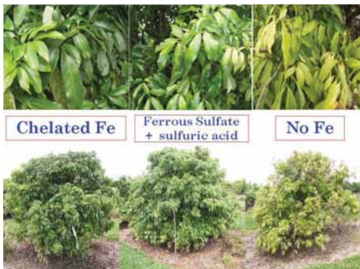
Figure 3. Comparison of foliar applications of chelated Fe, regular iron fertilizers, and no iron fertilization on correcting iron deficiency of lychee ( Litchi chinensis , the soapberry family).