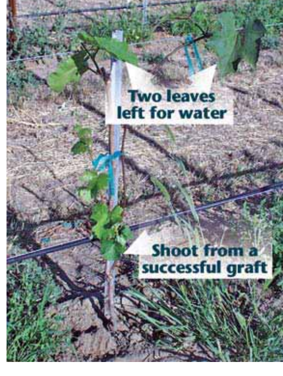
Figure 4. Leave two leaves on suckers secured to cordon wire for grafting to allow continued water movement to and through the graft union.

Research conducted at WSU Prosser IAREC indicates that grafts made high above the ground have a better chance of surviving the critical first winter. For instance, only 23% of grafts close to the ground (i.e., 11" or 28 cm) survived the 2002 "Halloween freeze" (11°F on October 31), compared to 65% of those grafted 27" or 69 cm above the ground. Higher grafts can also be trained to cordon wire more quickly than lower grafts.