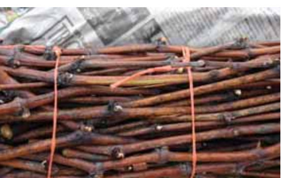
Figure 3. Choose scion wood for grafting that is 12–16" in length, round, and as straight as possible.