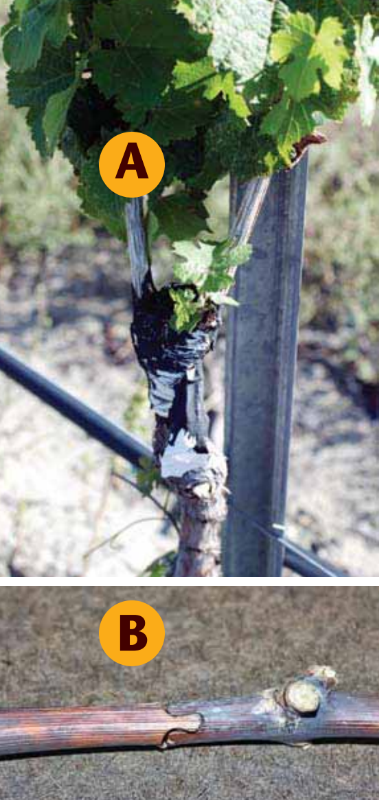
Figure 2. Cleft grafting (A) and omega grafting (B) are grafting techniques that can be used on grapevines.

Figure 3. Choose scion wood for grafting that is 12–16" in length, round, and as straight as possible.