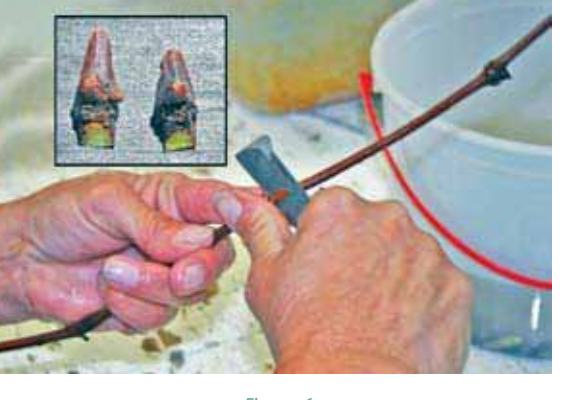
Figure 6. Cut buds (inset) off of scion wood before transfer to the field, and immediately place in a bucket of water to keep tissue hydrated.