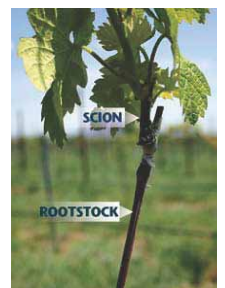
Figure 1. Grafting brings two different plants (a scion and rootstock) together.

pathway) within the graft union. Several different grafting techniques can be used to produce complete grapevines or top-work varieties in the field. Bench grafting of rootstocks and scions is often used in a nursery setting (Table 1). These vines are then callused in the nursery to develop the graft union before field planting. Field grafting is used on vines designated for top-working (Table 1), and requires protection with waterproof paraffin, paint, or grafting tape. The graft union then calluses and differentiates into xylem and phloem in the field.