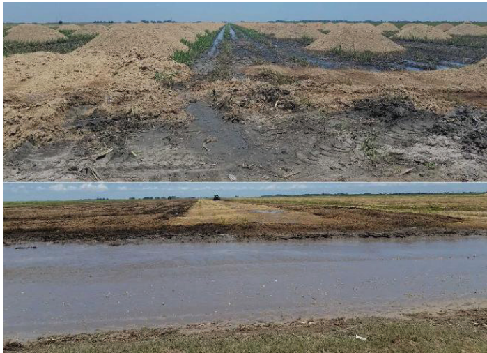
Figure 2. Bagasse being applied as organic soil amendment on sandy soils in south Florida.

converted into biofuels and other products. Utilizing locally derived crop residues such as bagasse (Figure 2), rice hulls, and palm fronds as soil amendments on sandy soils can potentially increase soil OM. Leaving this residue on the soil to naturally break down provides additional carbon to feed the soil. Gould (2015) showed that the application of compost increased water holding capacity of droughty soils.