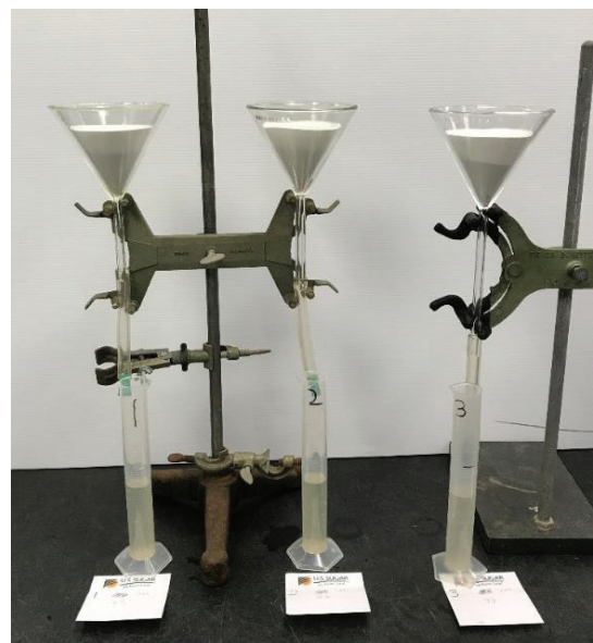
Figure 3. Laboratory experimental setup for measuring maximum water holding capacity.

Results indicated that there was a steady increase in WHC with every 1% increase in OM content for both sandy soils and limerock (Figure 4). Based on our study, every 1% increase of OM equates to a 2.3% and a 1.3% increase in soil WHC for sand and limerock, respectively. This would equate to an average of 10 gallons of water stored per acre-foot on sandy soils and 9.1 gallons of water stored per acre-foot of limerock if OM content were to be increased by 1%.