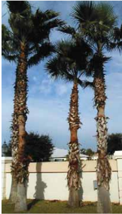
Figure 11. Leaf bases of Mexican fan palms ( Washingtonia robusta ) beginning to fall off in an irregular pattern.

Although not documented scientifically, there are anecdotal observations that overpruned palms fare more poorly in cold weather events than those with fuller canopies. The additional leaves or leaf bases can provide insulation to the bud or meristem. After cold weather events, it is recommended that cold-damaged leaves not be pruned off until after the threat of additional cold weather ( http://edis.ifas.ufl.edu/mg318 ) has passed.