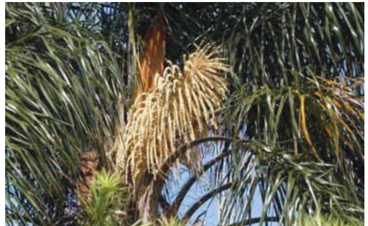
Figure 17. Flowers of queen palm ( Syagrus romanzoffiana ).