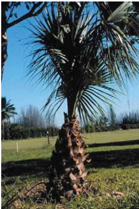
Figure 1. An overpruned sabal palm.

Perhaps the most fundamental question to answer when discussing palm pruning is what should a healthy, properly pruned palm look like? Contrary to popular belief, the palm in Fig. 1 is not a properly pruned palm. It provides little shade, is unattractive, and will be weaker than a full-canopied palm like the one in Fig. 2. A properly fertilized and pruned palm like the one in Fig. 2 should have a round canopy with green leaves right down to the bottom. Consumers must be educated that palms are supposed to have round crowns, not feather-duster crowns.