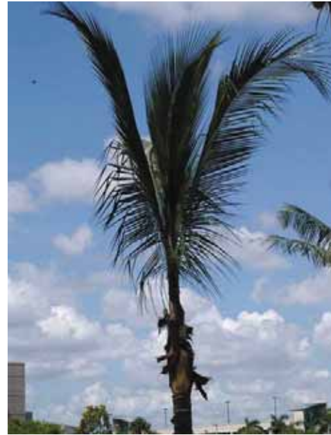
Figure 12. An overpruned “hurricane-cut” coconut palm ( Cocos nucifera ).

Traditionally, arborists have been asked to prune palms prior to the arrival of hurricane season. “Hurricane-cut” palms have most of their leaves cut off, leaving only a tuft of the youngest leaves intact (Fig. 12). The intent was to reduce wind resistance in the palm, thereby protecting it from wind damage. However, observations of palms after the severe hurricane seasons of 2004 and 2005 in Florida showed that these “hurricane-cut” palms were more likely to have their crowns snapped off than those with fuller crowns (Figs 13–14). This may be because the youngest leaves left on these overpruned palms have not hardened off to the extent that older leaves have and lack the support of the older leaf bases (Pfalzgraf 2000). These observations are supported by research on African oil palms ( Elaeis guineensis ) (Calvez 1976; Chan and Duckett 1978). There is no evidence, however, that reduced trunk caliper reduces palm trunk strength.