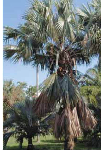
Figure 16. Wind-damaged Bismarck palm ( Bismarckia nobilis ) with kinked petioles on living leaves that could be removed.

major liability concern, and it is much easier to remove small flower stalks than heavy clusters of fruit (Fig. 19).