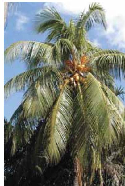
Figure 21. A properly fertilized coconut palm ( Cocos nucifera ) with a full rounded canopy of 26 leaves.

What is the relationship between K deficiency and pruning living leaves to “buy time” until the palm requires pruning again? If one starts with a K-sufficient palm with a full 360-degree canopy of healthy leaves, then, in theory, one could prune off as many living leaves from the bottom of the canopy as would be produced by the palm during the interval between prunings without ever seeing a single deficient or dead leaf on the palm during that time. In