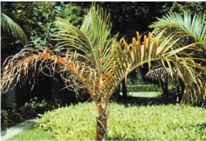
Figure 8. Severely K-deficient spindle palm ( Hyophorbe verschafeltii ) showing extensive orange translucent spotting, leaflet tip necrosis, and reduced canopy size.

Pruning old K-deficient leaves can also impact palm health. Potassium, like nitrogen and magnesium, is a mobile element within the palm. Thus, symptoms occur first on the oldest leaves, as these are depleted of their K in order to sustain growth of the new leaves. The oldest leaf (on the left side) in the K-deficient spindle palm ( Hyophorbe verschafeltii ) shown in Fig. 8 shows necrosis and frizzling of most leaflets, but the rachis and the basal portion of most leaflets remain alive. The next oldest leaf (on right) shows no necrosis but has extensive orange translucent spotting on its leaflets. The youngest leaf is completely symptom free. If these older discolored leaves are removed, the palm then removes K from the next leaves up within the canopy that are currently green and symptom free. Repeated pruning of K-deficient older leaves has been shown to reduce the number of green, symptom-free leaves within the canopy (Broschat, 1994) and, in severely K-deficient palms, is known to accelerate the rate of decline leading to death of the palm.