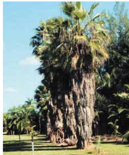
Figure 10. Relatively young Mexican fan palms ( Washingtonia robusta ) in Florida still retaining their skirt of old leaves. They are just beginning to fall off.

Removal of old palm leaf skirts such as those found on Mexican fan palms (Fig. 10) can remove hiding places for rats, snakes, scorpions, and other desirable or not so desirable wildlife. Note that the skirt of dead leaves is beginning to fall off some of the palms in Fig. 10. In Florida, Mexican fan palms about 30 feet tall or less typically retain their dead leaves or leaf bases, but within a year or so of reaching this size, all of these old leaves will begin to drop off by themselves (Fig. 11). After that, these palms become mostly self-cleaning and should not have to be pruned manually.