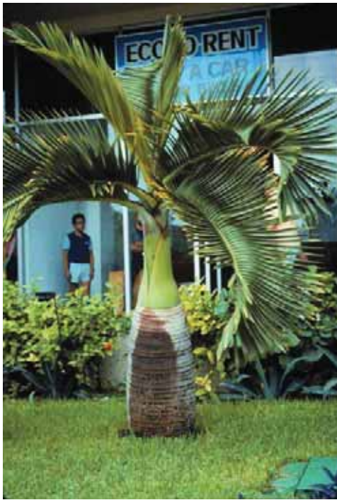
Figure 3. Hyophorbe lagenicaulis (bottle palm) showing crownshaft, the distinct smooth green region of the stem above the gray wood.