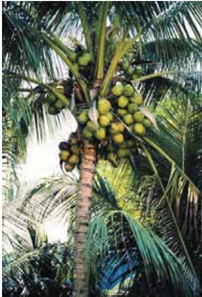
Figure 19. Clusters of coconuts on coconut palm ( Cocos nucifera ) that could create potential liability problems in public areas.