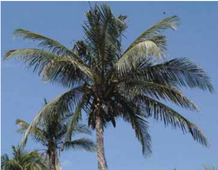
Figure 22. A coconut palm ( Cocos nucifera ) with 16 leaves.

addition, the palm would never appear overpruned. For example, suppose one wishes to prune the leaves of a coconut palm on an annual basis, and this species produces an average of 10 leaves per year. If starting with a healthy, 26-leaved, full-canopied palm (Fig. 21) and removing 10 leaves, the result would be a 16-leaf palm that looks similar to the one shown in Fig. 22. During the following year, this palm would slowly add new leaves to the canopy until, at 12 months, it would again appear like the one in Fig. 21. After about 13 months, the first dead leaf would appear at the bottom of the canopy, but since the palm would be repruned at 12 months, no dead leaves would ever appear on the palm. However, if one starts with a typical K-deficient South Florida coconut palm that only has 13 leaves (Fig. 20) and removes a full year's production of 10 leaves, the result would be an overpruned 3-leaf palm (Fig. 12) that, unfortunately, looks very familiar to most Floridians.