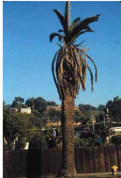
Figure 9. Fusarium wilt of Canary Island date palm ( Phoenix canariensis ).

weevils, a serious insect pest of this palm ( http://edis.ifas.ufl.edu/IN139 ).