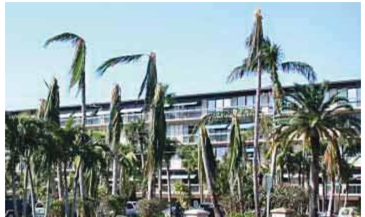
Figure 13. Overpruned coconut palms after hurricane Wilma.