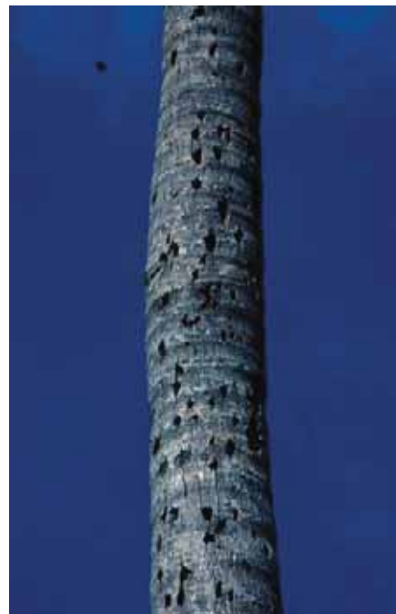
Figure 23. Permanent trunk wounds caused by climbing spikes.

Finally, never use climbing spikes for pruning palm leaves, because wounds caused by the spikes will never heal (Fig. 23) and can become entry sites for diseases, such as Thielaviopsis trunk rot , or attractants for serious insect pests, such as palm weevils ( http://edis.ifas.ufl.edu/in139 ).