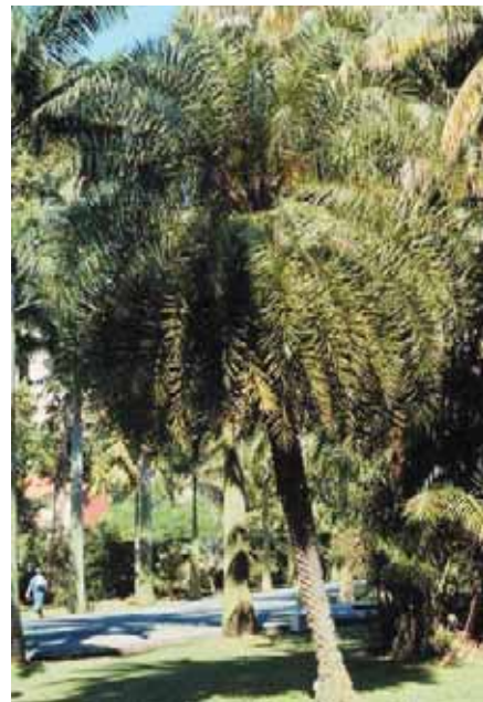
Figure 2. A healthy, properly pruned palm.

Secondly, not all palms require pruning. There is a large group of palms that have crownshafts—a region of smooth, usually green, tightly clasping leaf bases at the top of the gray trunk (Fig. 3). Palms with crownshafts should never need pruning if properly fertilized. A healthy old leaf will be completely green one day, completely orange-brown the second day (Fig. 4), and completely brown the third day, when it should fall off by itself. This is natural senescence. Half-dead old leaves that remain on the palm for months at a time are usually deficient in potassium (K) ( http://edis.ifas.ufl.edu/ep269 ) (Fig. 5) and should be fertilized ( http://edis.ifas.ufl.edu/ep261 ) to prevent this problem.