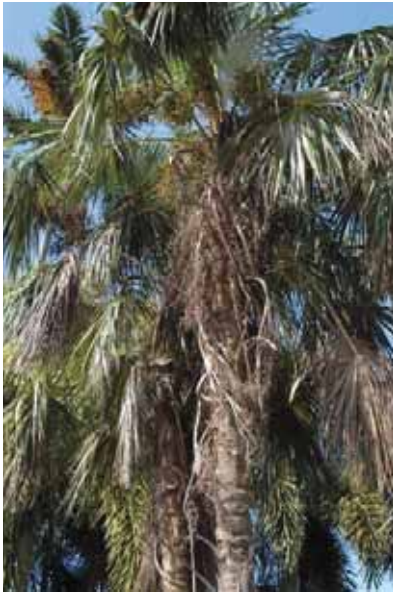
Figure 15. Coccothrinax sp. with dead leaves and fruit stalks that should be removed.

Removal of completely dead leaves and flower and fruit stalks from palms is never a problem (Fig. 15). However, half-dead or discolored lower leaves are a symptom of K or other nutrient deficiencies ( http://edis.ifas.ufl.edu/ep273 ) (Fig. 8). Despite their unattractive appearance, these leaves should be left on the palm as they are providing K in the absence of sufficient K in the soil. It is preferable to treat the K deficiency with effective fertilizers ( http://edis.ifas.ufl.edu/ep261 ) to prevent these older leaves from becoming deficient than to cut them off, only to have the symptoms return.