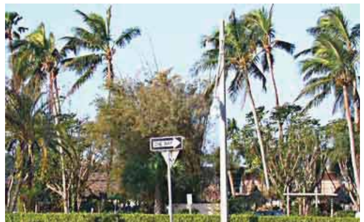
Figure 14. Unpruned coconut palms one block away after hurricane Wilma.