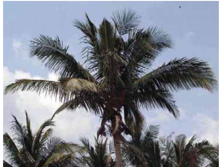
Figure 20. A typical coconut palm ( Cocos nucifera ) in South Florida holding only 13 leaves due to K deficiency.

no K deficiency, this species retains 26 or more leaves (Fig. 21). The average Canary Island date palm retains about 65 leaves in South Florida due to K deficiency, but without K deficiency this species usually retains 130–150 leaves. Thus, most palms in Florida only have half of their normal number of leaves prior to pruning.