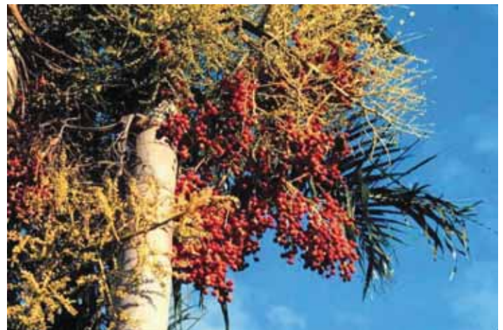
Figure 18. Fruit clusters on Carpentaria palm ( Carpentaria acuminata ).