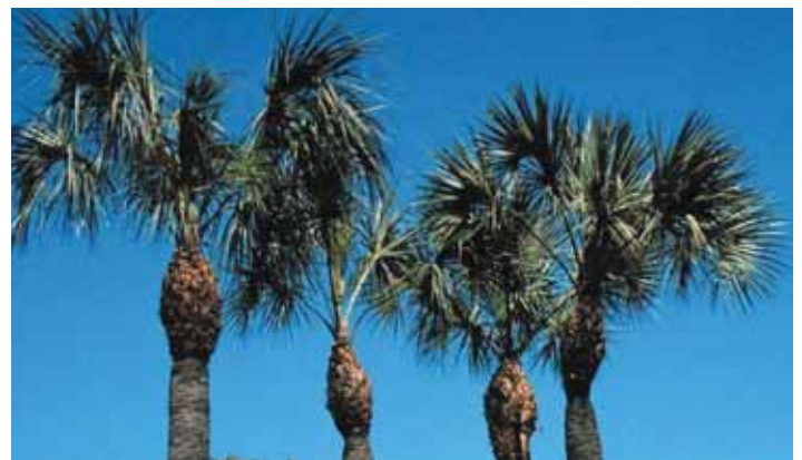
Figure 7. Overpruned sabal palms ( Sabal palmetto ) showing tapered trunks.

Pruning, or more importantly, excessive pruning, can affect palms in a number of ways. If palms are overpruned, the reduction in canopy size results in reduced photosynthetic capacity. In the short term, some studies have shown that overpruning can result in greater leaf production rates, but the resulting leaves were smaller in size than those on unpruned palms (Endress et al. 2004; Mendoza et al. 1987; Oyama and Mendoza 1990). If this practice is repeated frequently, the palm may also develop a smaller trunk diameter (Fig. 7).