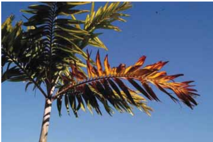
Figure 4. Naturally senescing older leaf of Veitchia sp.