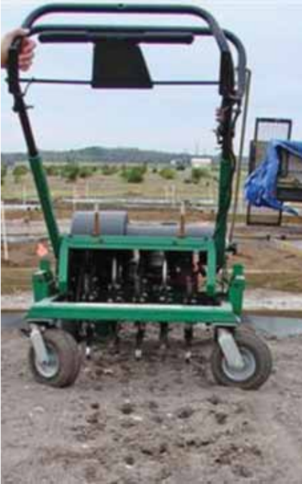
Figure 4. Plug aeration can be used to improve drainage in compacted soils with minimal effect on established plant roots or turfgrass.

if compaction is the cause. Additionally, aeration with a soil core aerator (Figure 4) can help to moderately increase drainage in some situations.