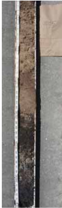
Figure 2. Removing a soil core or vertical slice from the disturbed soil to compare with the description of the native soil indicated on the site soil survey can provide information about the extent of soil disturbance during construction activities.