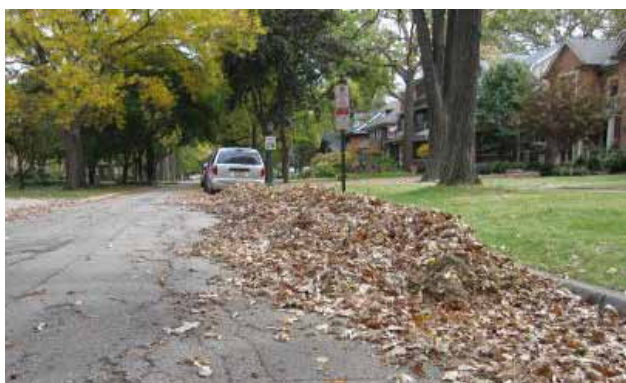
Loose leaves curbside .