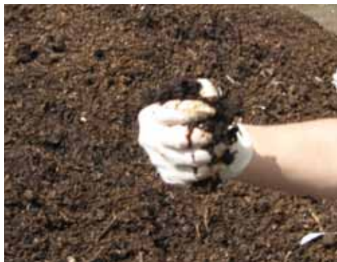
Optimum moisture content for compost is 40-60%, damp enough so that a handful feels moist to the touch, but dry enough that a hard squeeze produces no more than a drop or two of liquid.

Time in all systems depends on mixes, moisture and airflow. With well-balanced mixes, turned or unturned, compost can be produced within 6 months. Creating a good habitat for microorganisms helps the process work better. By balancing your browns and greens and checking your moisture content (see squeeze test pictures below) you can create a mixture that allows air to flow evenly through the pile. This “passive” air flow can produce the same results as turning. Keeping that stockpile of coarse carbon on hand will help achieve this. With less optimum conditions, it will take from 6 months to a year or more to produce finished compost. With rotating drum composters, continuous composters and worm composters, finished compost can be created in a relatively short time of 6 months or less.