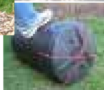
Homemade rotating drum compost units.