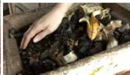
Indoor worm box.