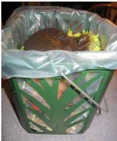
Kitchen container with compostable bag.