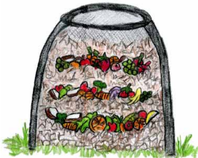
Cross-section of layered browns and greens.

Layering and choosing the right organic material creates the right environment for compost to “happen”. Start with a layer of coarse “browns” in contact with the soil. Make a well or depression in this layer and put the “greens” into the well. Keep the food scraps away from the outside edges of the pile (only brown material should be visible). Cover your “greens” with a generous layer of “browns” so that no food is showing. This will keep insect and animal pests out of the pile and filter any odor. Keep adding layers of greens and browns (like making lasagna). Keep layering the feedstock until the mass reaches a height of 3 to