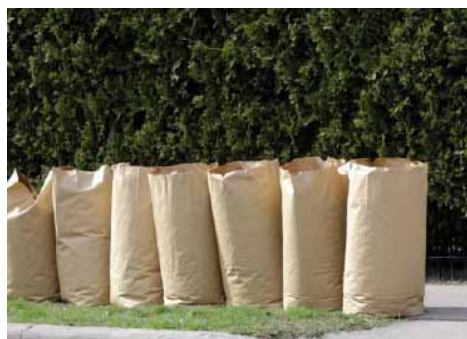
Paper leaf bags.

♦ Paper bags: Paper leaf bags can be a good choice since they have a base that allows them to stand up while loading, and can be incorporated into the compost along with the leaves which avoids the debagging process. However, they can be more expensive to purchase.