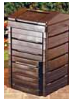
Manufactured on-ground compost units.

a product more quickly, turning will help to speed the process. The pile can be turned with a pitch fork or shovel, which helps to break up material and better homogenize the mass.