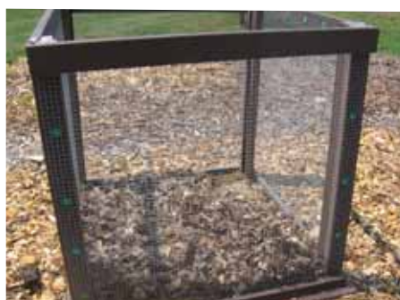
Homemade on-ground compost units.

These units sit directly on the ground so that worms and other decomposers can come up from the soil to assist in the composting process. Whether homemade or purchased, these types of composters can be used as holding bins or can be