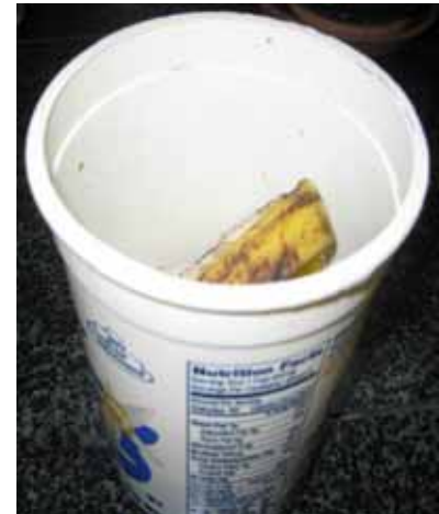
Recycled kitchen container.