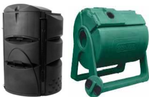
Manufactured continuous feed compost units.

◆ Continuous Feed Compost Units: These composters are designed to be fed daily. Feedstocks go in one end and compost comes out the other. These include rotating drum and bin composters that are designed specially to push waste through the system, and also include indoor, electric composters.