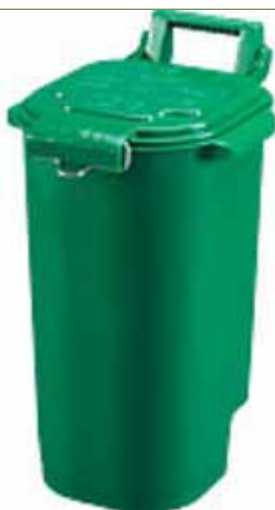
Reusable curbside collection containers.