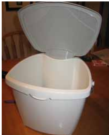
Kitchen container with locking lid and aeration holes.