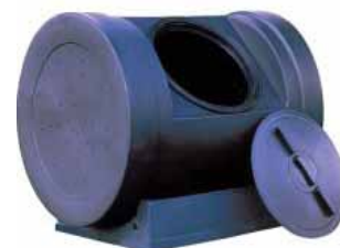
Manufactured rotating drum compost units.