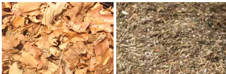
Browns: Leaves and wood chips.