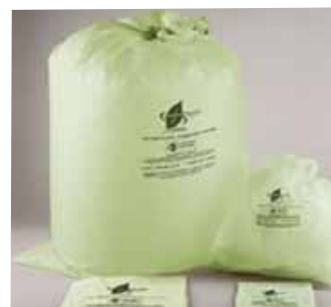
Compostable plastic bags.

♦ Compostable plastic bags: These bags are designed to be incorporated into compost windrows with the yard waste and no debagging should be necessary. These bags tend to be more expensive than the petroleum-based bags but may save in labor.