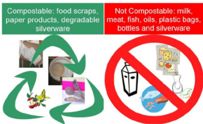
Example signage for home separation.

Any food preparation or post plate material, spoiled food, napkins, and degradable serveware can be composted. Milk and meat products are not generally added to home compost piles, but can be composted by municipalities collecting organics because they compost greater volumes of residuals and reach proper temperatures. Signage can help while learning what to put into the containers and where many people use a shared kitchen.