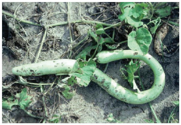
Figure 1. Cucuzzi gourd

Cucuzzi is also known as bottle gourd, calabash, suzza melon, zucca, Italian edible gourd, Tasmania bean, Guinea bean, New Guinea bean, and white flowered gourd. It is grown as a novelty garden item in Florida generally from seed advertised in seed catalogs as Guinea bean. The bottle gourd is another form, having somewhat different shaped fruits.