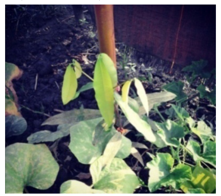
Figure 5. Achachairu plant intercropped with cucumber.

and productivity in Florida. Pruning can make harvesting simpler and easier. Achachairu fruit species can be pruned in the early growth stage. Pruning older trees should be primarily limited to the damaged branches or those close to soil (Duarte and Paul 2015).