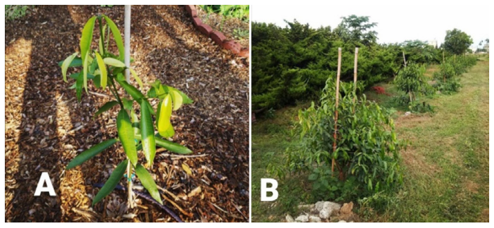
Figure 2. (A) Achachairu leaves. (B) Achachairu foliage.

Achachairu leaves are glossy, dark green, coriaceous (leathery in texture), and opposite (Figures 2 and 3) (Duarte 2011; Joyner 2000). Monoecious—i.e. having both male and female reproductive organs in the same flower (Duarte and Paul 2015)— Garcinia h. grows creamy white flowers (Marinho 2019).