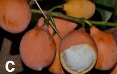
Figure 1. (A and B) Achachairu fruit. (C) The skin and pulp of Achachairu.