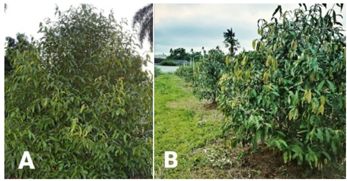
Figure 3. Achachairu trees at a height of approximately 20 feet.

The tree adapts well to warm climates (Winterstein 2016) and moderately acidic to moderately alkaline soils. Optimal pH levels in soil range from 4.7 to 6.6 (Joyner 2000); grown in central Florida, achachairu thrives in well-drained alluvial soil with sufficient moisture (Lim 2012). Garcinia h. can reach a height of 20 to 50 feet (Figure 3) (Duarte 2011; Joyner 2000). There is a 7-acre farm in south Florida that sells achachairu online at https://miamifruit.org/products/achacha-achachairu-box.