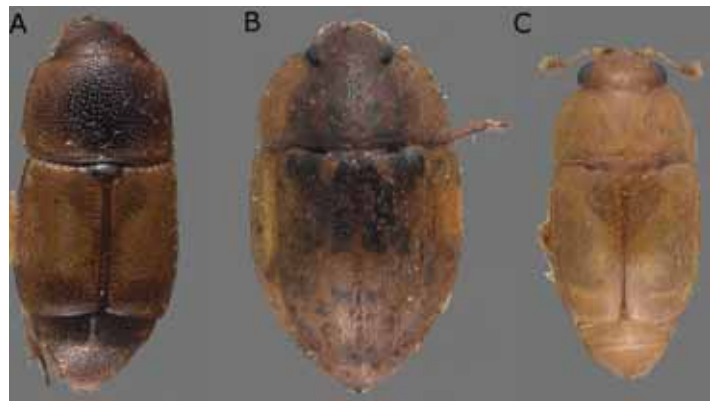
Figure 3. Adults of the three most common sap beetle species in Florida strawberry. (A) Carpophilus fumatus (B) Lobiopa insularis (0.25 in) (C) Epuraea luteola (0.1 in). Note exposed abdominal segments in (A) and (C) and distinctly clubbed antennae in (C).