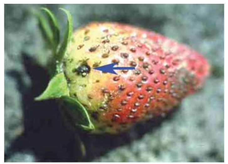
Figure 1. Strawberry fruits infested with a sap beetle adult.

Sap beetles, sometimes called nitidulids or picnic beetles, undergo four life stages: eggs, larvae, pupae, and adults. Eggs are white and small. Larvae are white with a light brown head and have three pairs of legs. They are about the same size as the adults (Figure 2). Adult size depends on species, but most are \frac{1}{10}-\frac{1}{2} inch (2–15 mm) long and \frac{1}{4} inch (6.5 mm) wide. Adults are oval shaped, usually black, brown, or grayish, with clubbed antennae (Figure 3).