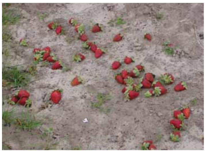
Figure 4. Overripe berries in the field. Sap beetles are attracted to the fermenting fruit.

There are two types of damage inflicted by sap beetles: direct (feeding cavities or holes) and indirect (dissemination of microorganisms). Cavities also serve as egg-laying sites. Larvae inside strawberries usually go unnoticed until the fruit begins to decompose as a result of the damage. Because overripe strawberries are attractive to sap beetles, damage is often greatest during harvesting when pickers leave ripe and overripe strawberry plants in the field or if fruit is discarded in ditches or weedy field margins (Figure 4).