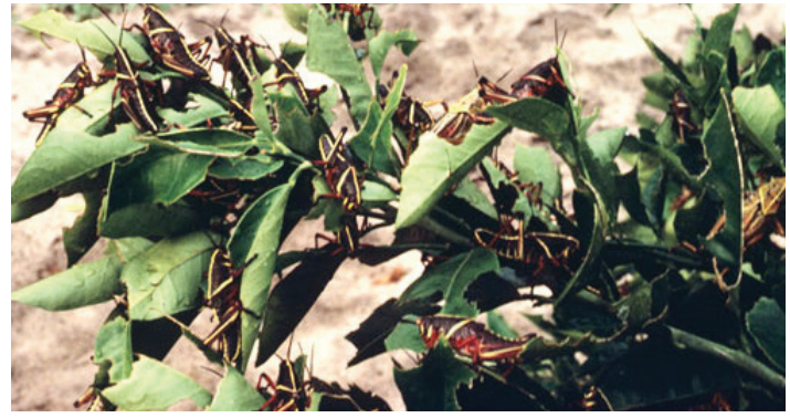
Figure 14. Young nymphs of the eastern lubber grasshopper, Romalea microptera (Beauvois), clustered on a citrus reset (young citrus tree).