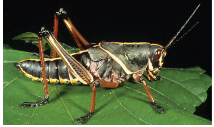
Figure 6. Young lubber, Romalea microptera (Beauvois), instar five. The wing is longer now, extending further posteriorly relative to the tympanum. Next it will molt to the adult, though you cannot tell from the nymph what color form will be assumed by the adult.