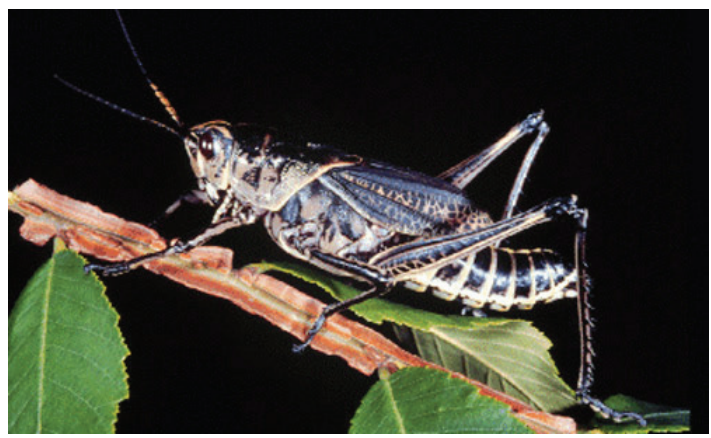
Figure 10. Adult eastern lubber grasshopper, Romalea microptera (Beauvois), dark color phase.

of lubbers (Yousef and Whitman 1992). However, loggerhead shrikes, Lanius ludovicianus Linnaeus, capture and cache lubbers by impaling them on thorns and the barbs of barbed wire fence. After 1–2 days the toxins degrade and the dead lubbers become edible to the shrikes (Yousef and Whitman 1992). In addition to parasitic flies, nematodes have been reported from lubbers, and it is possible to infect lubbers experimentally with the grasshopper-infecting nematode Mermis nigrescens .