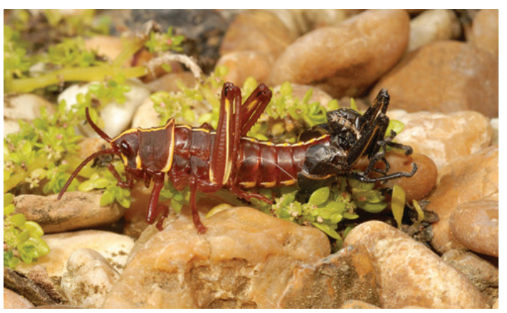
Figure 7. Lubber nymph Romalea microptera (Beauvois), molting, leaving behind its old (darker) body covering.