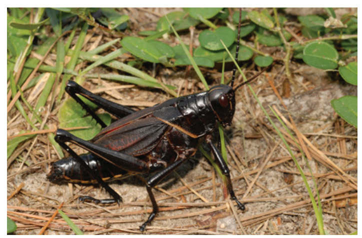
Figure 11. Black color form of adult eastern lubber grasshopper, Romalea microptera (Beauvois).