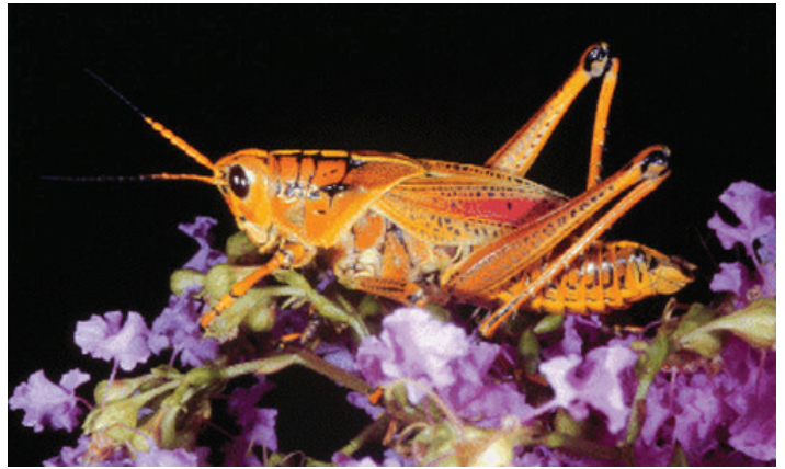
Figure 8. Adult eastern lubber grasshopper, Romalea microptera (Beauvois), light color phase.