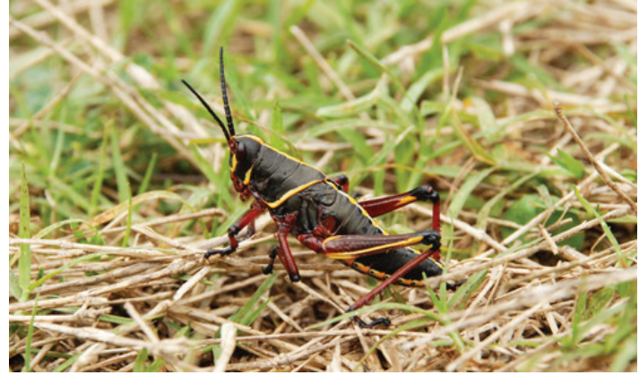
Figure 5. Young lubber, Romalea microptera (Beauvois), instar four. Now you can see something that actually looks like a wing, although it is quite small. Note that it is pointed upward (dorsally). Also note its length relative to the oval, reddish-colored tympanum on the first abdominal segment.

congregate near suitable food sources. Lubbers are often found in damp or wet habitats, but seek drier sites for egg-laying.