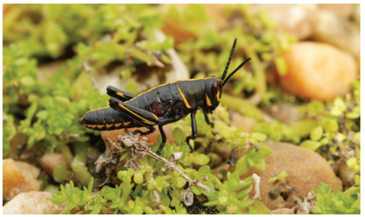
Figure 3. Young lubber, Romalea microptera (Beauvois), instar two. The beginnings of the wing veins can be seen now.

they simply have a long period of development (about 200 days) when held at low temperatures (Hunter-Jones 1967). These grasshoppers are long-lived, and either nymphs or adults are present throughout most of the year in the southern portions of Florida. In northern Florida and along the Gulf Coast they may be found from March–April to about October–November. In Florida, the highest number of adults can be observed during the months of July and August. Eggs are produced about a month after emergence of the adults. Duration of the egg stage is 6–8 months.