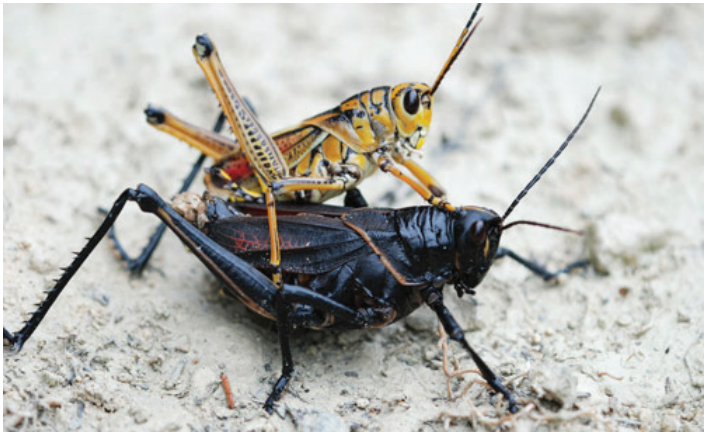
Figure 12. Mating adults of two color forms.

The nature of polyphagous insects is to accept at least small amounts of many plants, a strategy that assures they will not starve. However, not all plants are accepted equally. For example, although lubbers display broad preference among vegetable crops, some plants such as pea, lettuce, kale, beans, and cabbage are relatively preferred whereas eggplant, tomato, pepper, celery, okra, fennel, and sweet corn are less preferred (Capinera 2014). They commonly defoliate amaryllis, Amazon lily, crinum, narcissus, and related plants (family Amaryllidaceae) in flower gardens. Among ornamental plants, they also will feed readily on oleander, butterfly weed, peregrina, Mexican petunia, and lantana (Capinera 2014). Preferred weeds include painted leaf, Poinsettia cyathophora; tread-softly, Cnidoscolus stimulosus; chamber bitter, Phyllanthus urinaria; Florida beggarweed, Desmodium tortuosum; Old-world diamond-flower, Oldenlandia corymbosa; Florida pusley, Richardia scabra; and smooth crabgrass, Digitaria ischaemum (Capinera 2014).