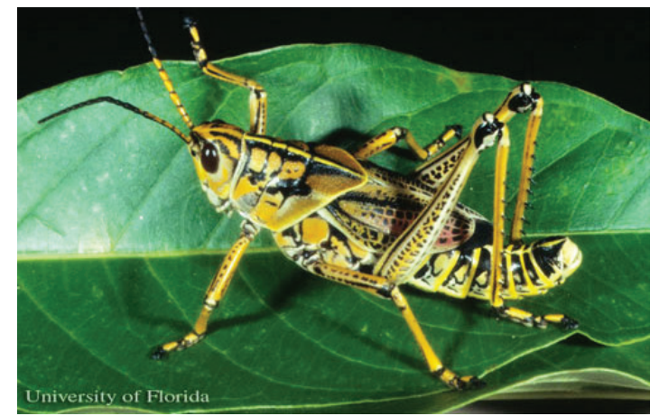
Figure 9. Adult eastern lubber grasshopper, Romalea microptera (Beauvois), intermediate color phase.

Overall, the natural enemies of lubber grasshoppers are poorly documented. Vertebrate predators such as birds and lizards learn to avoid these insects due to the production of toxic secretions by the adult hoppers, though this is not absolute (Chapman and Joern 1990). Naïve vertebrates often gag, regurgitate, and sometimes die following consumption