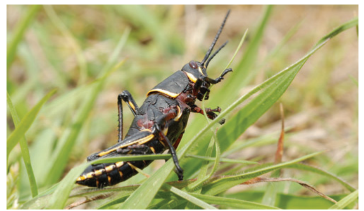
Figure 4. Young lubber, Romalea microptera (Beauvois), instar three. Now you can better see the developing veins and a slight backward (posterior) extension of the wing buds.

After mating, females will begin laying eggs during the summer months. The male usually guards the ovipositing female, sometimes for more than a day. The timing of oviposition is highly variable, but ovipositing females select open, sunny areas of higher elevation, then use the tip of the abdomen to dig a small hole into a suitable patch of soil. Usually at a shallow depth, but sometimes up to a depth of about 5 cm, she will deposit her eggs within a light foamy froth. These eggs will remain in the soil through late fall and winter and then begin hatching in spring. The young grasshoppers crawl up out of the soil upon hatching and