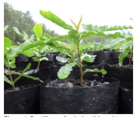
Figure 1. Seedlings after being thinned to one per pot, approximately three months after planting.

growing the rootstock,<sup>1</sup> 2) preparing the scion wood,<sup>2</sup> and 3) successfully fusing the scion and rootstock together. With careful planning and execution, your grafted tree could be ready to transplant in two years!