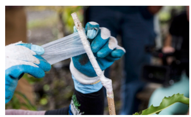
Figure 12b. Complete coverage of the scion wood is important to reduce water loss and potential entry of pathogens into the graft.