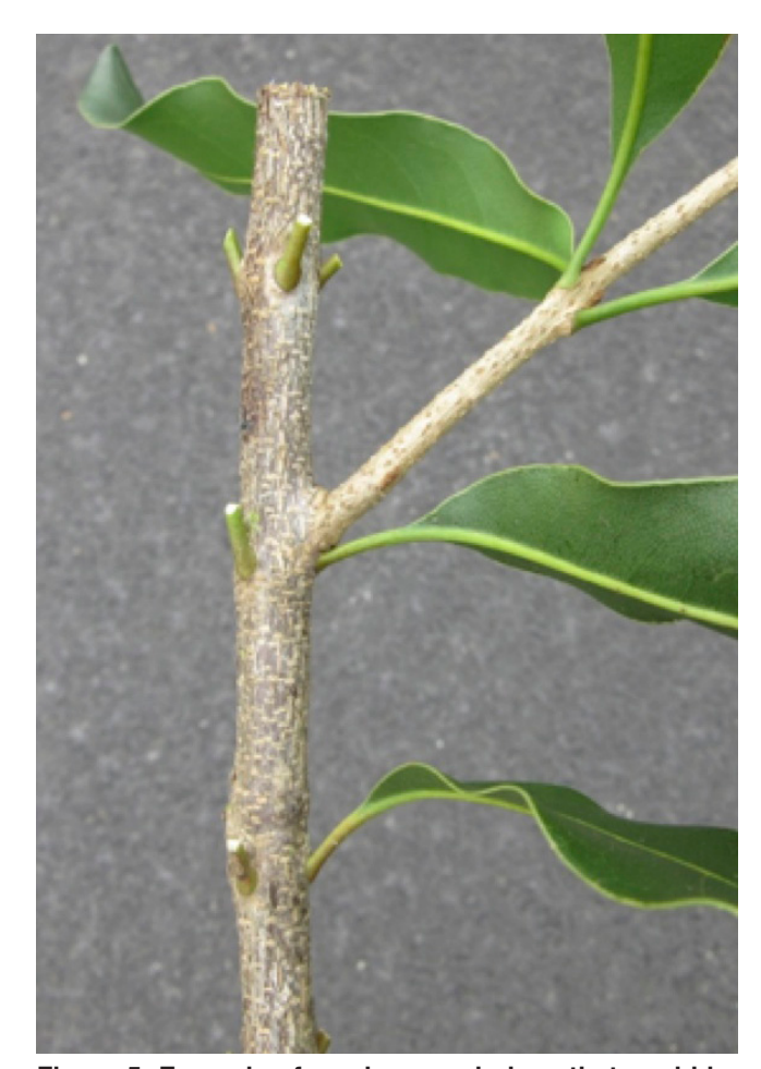
Figure 5. Example of a scion wood piece that could be used for grafting. Note the direction of the buds, which are facing upwards.