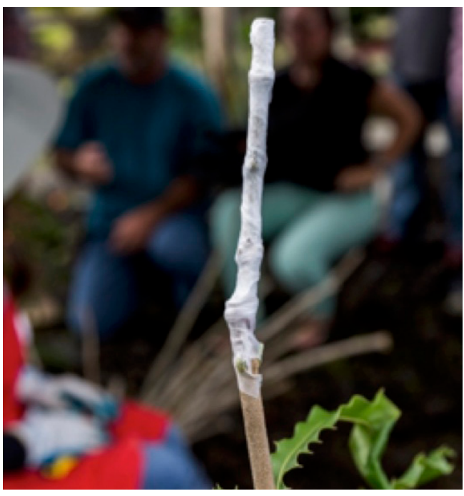
Figure 12c. A completed graft with parafilm covering the union and entire scion.