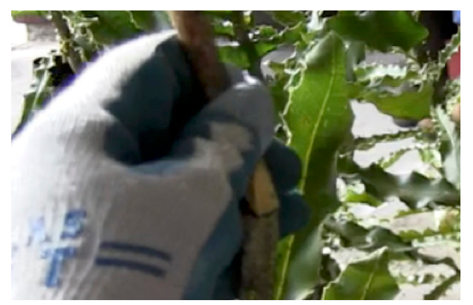
Figure 7. Matching the diameter of the scion with the rootstock.