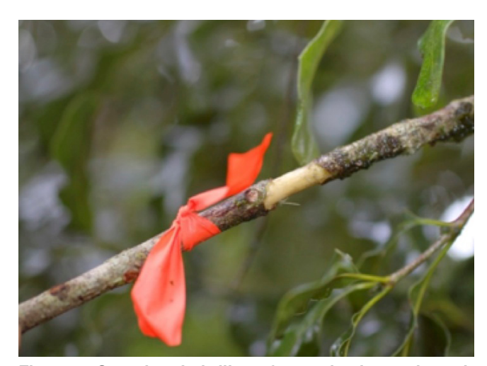
Figure 4. Completed girdling of macadamia tree branch for scion wood; branch flagged with the date for future harvesting of scion wood.

Cut the scion branch below the girdle with clippers. For best results, perform the graft on the same day that the scion is removed from the mother tree. If you are not grafting immediately, be sure to keep