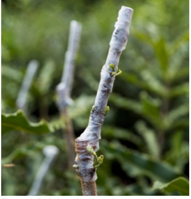
Figure 13. Buds breaking through the parafilm, indicating a successful graft. Leaves below the graft should be removed before planting into the field.

if the intended use site is included on the label. READ AND FOLLOW LABEL INSTRUCTIONS BEFORE PURCHASING AND USING ANY PESTICIDE PRODUCT.