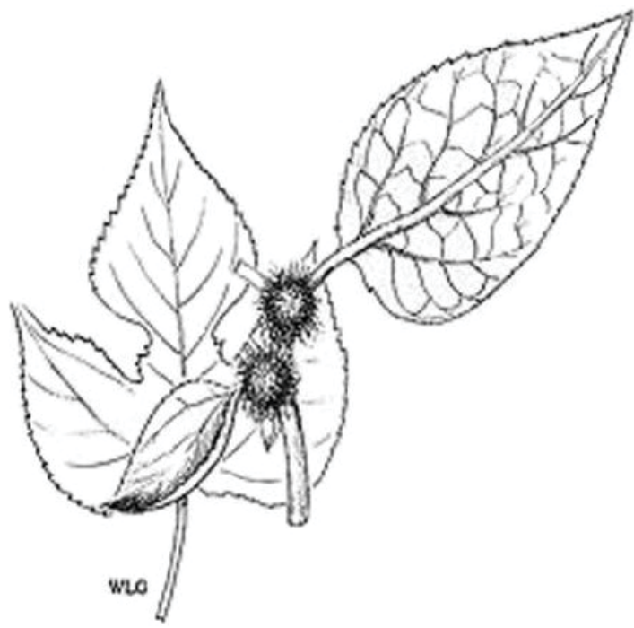
Figure 2. Broussonetia papyrifera . Credits: Holmgren (1998).

margin. Larger leaves tend to be heart or mitten shaped, while the largest leaves are generally deeply lobed, giving the leaf three large lobes and occasionally two smaller ones near the leaf base (Figure 2). Its fruits are generally 1.5–2.0 cm in diameter and are a reddish purple in color, appearing in summer.