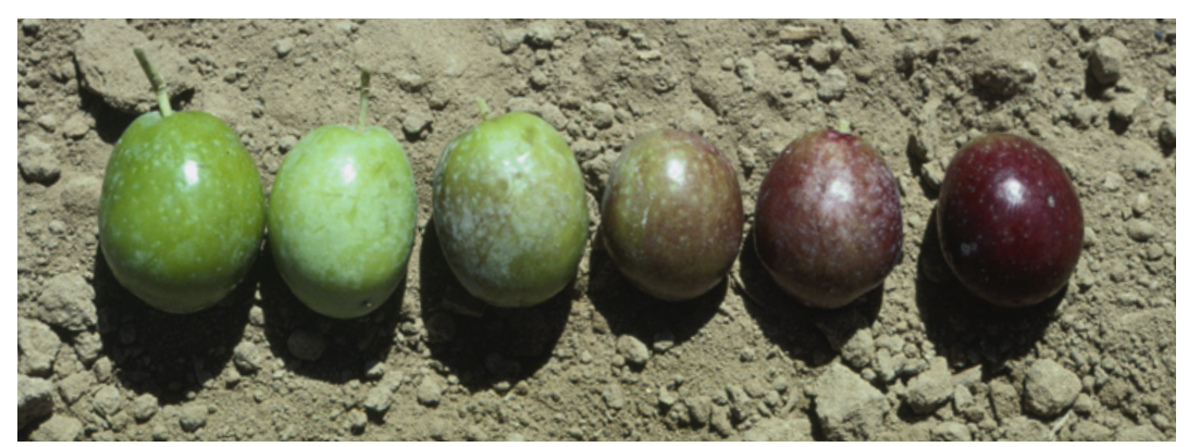
Figure 1. Freshly harvested olives at different stages of ripeness: green-ripe (1 and 2); yellow-green to straw (3); rose to red-brown (4 and 5); and red-brown (6) (may be too soft for some types of olive curing). Not shown are naturally black ripe olives (also described as dark red to purplish black).

Naturally black ripe olives are harvested in California starting in mid-November and continuing through December, depending on the variety, crop yield, and region, and on weather conditions. When mature, these olives will release a reddish black liquid when you squeeze them and their flesh will be nearly completely pigmented. Ripe olives bruise easily and must be handled with care.