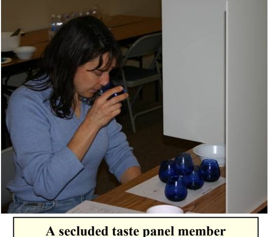
A secluded taste panel member evaluating oils in silence

The numerical sensory values for each of the first three grades (extra virgin, virgin, and ordinary virgin) come from a rating of the oil by a qualified taste panel that has been officially recognized by the IOC. The majority of the tasters, usually 5 of 8, must agree statistically on the rating of the oil