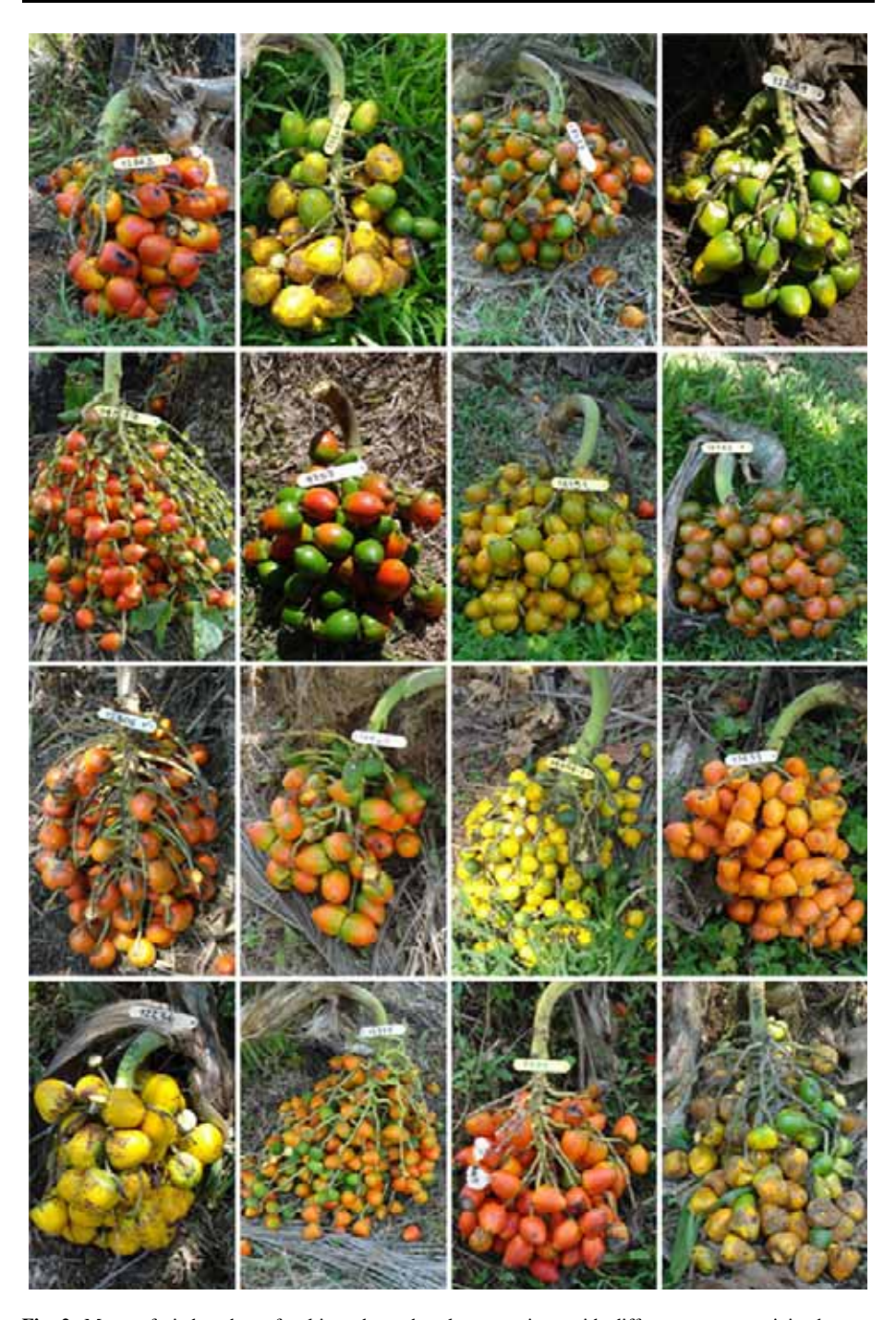
Fig. 2 Mature fruit bunches of cultivated peach palm accessions with different country origin that are conserved in the peach palm genebank collection of the Centro Agronómico Tropical de Investigación y Enseñanza (CATIE) in Costa Rica