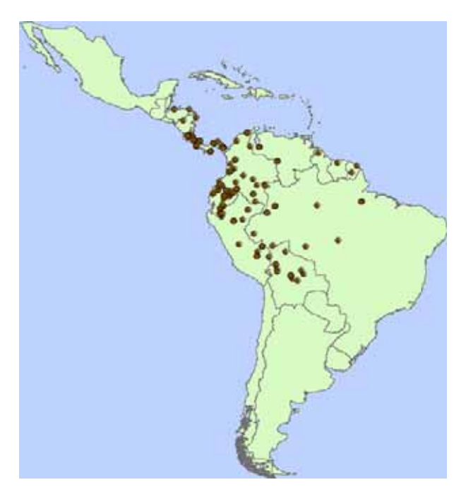
Fig. 1 Peach palm distribution based on herbaria and genebank data

of phenotypic and genetic diversity into (a) two western populations (i. Central America, Colombian inter-Andean valleys and Pacific lowlands in Colombia and Ecuador; ii. inter-Andean valleys in Venezuela) and (b) two eastern populations (i. upper Amazon and ii. eastern Amazon) (Mora-Urpí et al. 1997; Rodrigues et al. 2004; Hernández-Ugalde et al. 2008). In general, landraces from the western group have harder stems, more abundant and stronger spines, larger leaves and more solid rooting in their juvenile phase (Mora-Urpí et al. 1997). The wild form can be further subdivided into three types based on taxonomical differences: type I of the southern Amazon; type II of northeast Colombia and northwest Venezuela; and type III of the Tropical Andes, southwest Amazon and Central America (Henderson 2000; Clement et al. 2009).