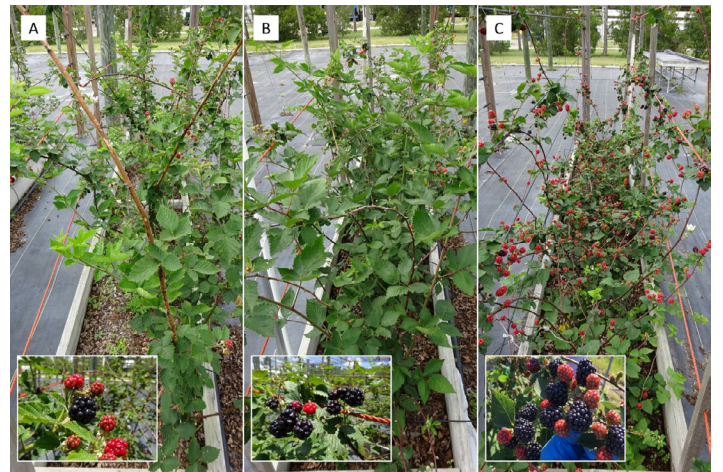
Figure 2. Growth performance and fruits of three blackberry cultivars grown at UF/IFAS GCREC: (A) 'Navaho', (B) 'Ouachita', and (C) 'Natchez'. Photos were taken in mid-May.

A thornless, erect, floricane-fruiting cultivar released by the University of Arkansas in 2010 (Clark and Moore 2008). In central Florida, it yields highest among the tested cultivars, ripens between early May and mid-June, and produces larger and softer fruits than other floricane-fruiting cultivars (Figure 2C). The fruits taste seedy and tart, but the fruits harvested in late season are sweeter and flavorful. 'Natchez' tends to overcrop, which can result in the decline of plant vigor year by year.