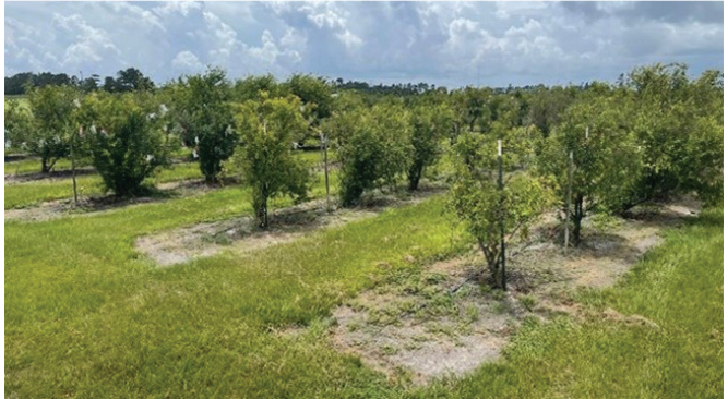
Figure 1. Blackberry orchard (top) and pomegranate orchard (bottom) at UF/IFAS GCREC in Wimauma.