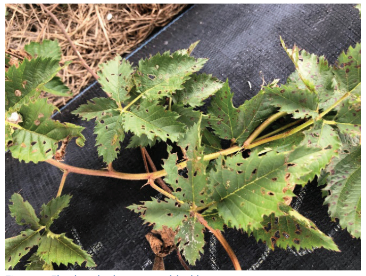
Figure 3. Flea beetle damage on blackberry.

Flea beetles are small, metallic blue-green beetles with great jumping skills. The flea beetle, Altica spp. (Coleoptera: Chrysomelidae), varies in size from 3–9 mm. Females lay their eggs in clutches of 1–15 on the upper and lower surfaces of leaves. Larvae emerge after 5–8 days, are dark brown, and have 10 body segments (Phillips 2019). This species has three larval stages. Pupation occurs in the soil. Adults emerge from the soil in the spring. Larvae and adults both have biting-chewing mouthparts that they use to feed on foliage (Figures 3 and 4). Flea beetles are found worldwide and can cause damage to economically important plants if they reach large numbers, but they are also excellent biological control agents for weed management.