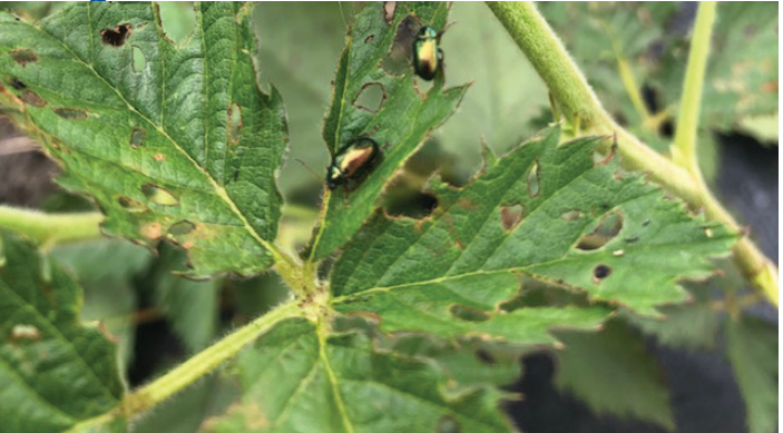
Figure 4. Flea beetles actively feeding on blackberry bush.

Parasitoids are also known to attack flea beetles. Hymenopterans from the family Braconidae and dipterans from the family Tachinidae are natural predators of flea beetles in Florida (Phillips 2019). Maintaining a healthy predator population will help keep flea beetles from establishing in large numbers.