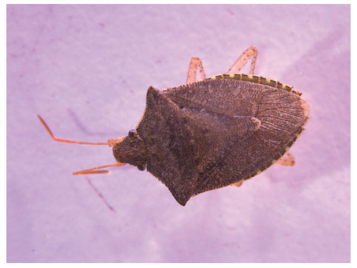
Figure 7. Dusky stink bug.

Maintaining a natural predatory and parasitoid population is ideal to help control stink bug populations. Predators such as big-eyed bugs, grasshoppers, and spiders feed on stink bugs (Morrison 2016).