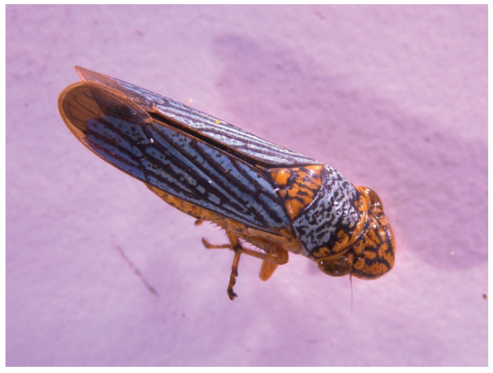
Figure 2. Black-winged sharpshooter.

Sharpshooters are invasive leafhoppers in Florida. They have piercing-sucking mouthparts, which they use to feed on the xylem and phloem tissues of host plants. The black-winged sharpshooter, Oncometopia nigricans Walker (Hemiptera: Cicadellidae), is 8-9 mm long and yellow or orange with pronotum and bluish to bluish-gray forewings (Figure 2). Wings have black markings along veins. Sharpshooters go through incomplete metamorphosis with five nymphal instars and an adult stage. Female sharpshooters lay their eggs in masses under the epidermis of leaves. The nymphs are wingless and leap from leaf to leaf in search of food. Sharpshooters feed on a wide variety of plants and can cause physical damage to plants in large enough numbers, which most often occurs in spring and summer. However, the primary damage from sharpshooters comes from vectoring infectious pathogens that cause economically important diseases in plants. There is currently no documented evidence of this pest vectoring diseases of blackberries and pomegranates in Florida.