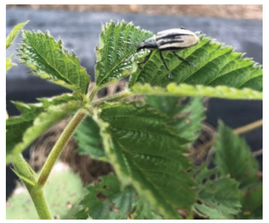
Figure 5. Citrus root weevil.

metalized reflective mulch, can help prevent the larvae from entering the soil and the adults from emerging.