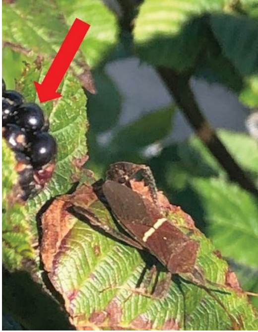
Figure 10. Leaffooted bug on blackberry bush; notice drupelet damage on the berry (red arrow).

(Hemiptera: Coreidae), are typically found in the spring and summer months in abundance. Adults range in size from 1.6 to 1.9 cm. They are brown with variations of orange on the abdomen. Females lay eggs in a single row along the stem or midrib of the leaf. Nymphs are shaped like the adults but lack the leaf-like hind tibia until adulthood. Leaffooted bugs feed on the receptacle between the drupelets of the fruit, causing damage near the insertion point and rendering the fruit unmarketable (Mead 2019) (Figure 10).