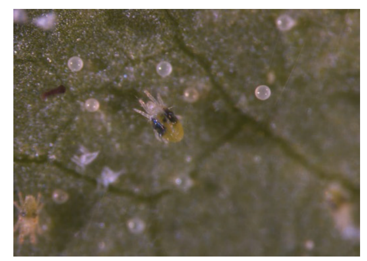
Figure 8. Twospotted spider mite and eggs.

The twospotted spider mite, Tetranychus urticae Koch (Acari: Tetranychidae), is a significant arthropod pest in multiple fruit crops. Adult twospotted spider mites range from 2–3 mm in length, have eight legs, and are tan or greenish with two dark spots, one on each side of the back (Figure 8). There are four developmental stages of the twospotted spider mite: egg, larva, two nymphal stages, and adult. Adult mites can overwinter on canes or in plant debris while waiting for warmer temperatures to significantly increase mite activity. Twospotted spider mites feed on the sap of leaves, causing chlorosis, which reduces plant vigor, leading to premature leaf drop. Webbing on the undersides of leaves is indicative of spider mite feeding. With high infestations, these pests can cause severe yield loss.