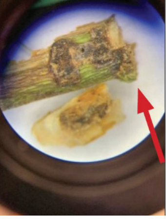
Figure 6. Raspberry cane borer larvae (left), and entry point on blackberry cane and frass from larva of raspberry cane borer (right).