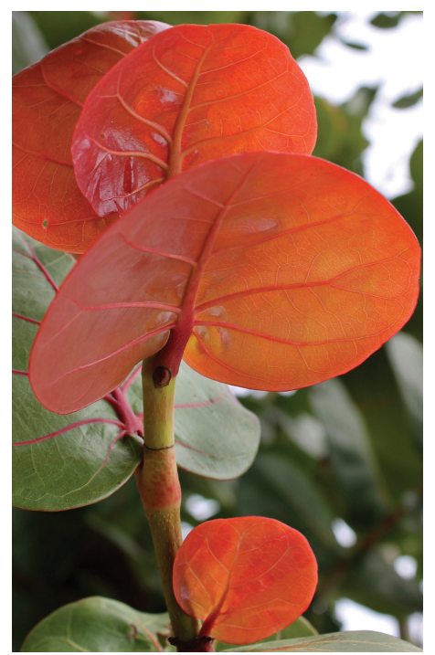
Figure 3. Young Leaf—Coccoloba uvifera: Seagrape

Fruit shape: elliptical Fruit length: ¾ inch Fruit covering: fleshy achene Fruit color: green to reddish purple Fruit characteristics: attracts birds; showy; fruit/leaves a litter problem Fruiting: emerges in early summer and ripens by early fall