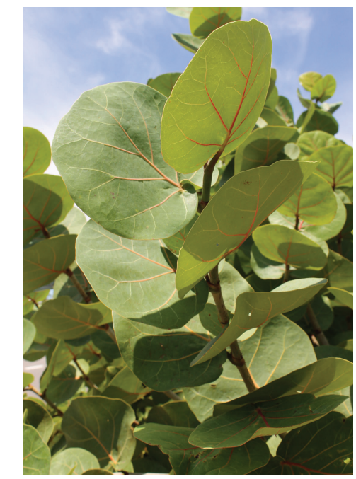
Figure 4. Mature Leaf—Coccoloba uvifera: Seagrape