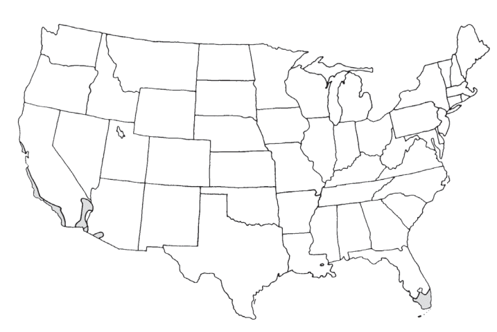
Figure 2. Range