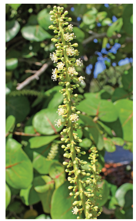
Figure 5. Flower— Coccoloba uvifera : Seagrape