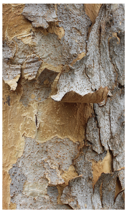
Figure 7. Bark— Coccoloba uvifera : Seagrape

Light requirement: full sun, partial sun, or partial shade Soil tolerances: clay; sand; loam; alkaline; acidic; well-drained Drought tolerance: high Aerosol salt tolerance: high