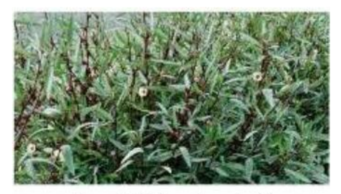
Figure 3: Hibiscus plantation<sup>12</sup>

Demand has steadily increased for roselle over the past decades. Currently approximately 15,000 metric tons enter international trade each year. Many countries produce roselle but the quality markedly differs. China and Thailand are the largest producers and control much of the world supply. Thailand invested heavily in roselle production and their product is of superior quality, whereas China's product, with less stringent quality control practices, is less reliable and reputable. The world's best roselle comes from the Sudan, but the quantity is low and poor processing hampers quality. Virtually all of Sudan's production is exported to Germany. US importers also prefer the Sudanese product, but due to a trade embargo, importers there are forced to source this product through Germany at a considerable mark-up in price. As such, the Sudanese product is used much less in the US, and China and Thailand are the main suppliers. Mexico, Egypt, Senegal, Tanzania, Mali and Jamaica are also important suppliers but production is mostly used domestically.