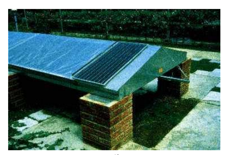
Figure 6: Solar drying tunnel 15

But often color, texture and flavor of these calyces are not up to standard, neither of the internal consumers nor of the international market. An improvement of product quality can be achieved by using more adequate methods. Hot air dryers as used in developed countries are rather expensive but for instance the "Solar drying tunnel" provides a cost-efficient alternative.