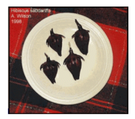
Figure 4: Hibiscus calyces<sup>13</sup>

The young leaves and tender stems of roselle are eaten raw in salads or cooked as greens alone or in combination with other vegetables or with meat or fish. They are also added to curries as seasoning. The leaves of green roselle are marketed in large quantities in Dakar, West Africa. The juice of the boiled and strained leaves and stems is utilized for the same purposes as the juice extracted from the calyces. The herbage is apparently mostly utilized in the fresh state though it can be evaporated and compressed for export from the Philippines.