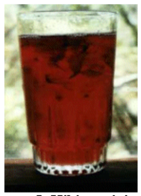
Figure 5: Hibiscus juice14