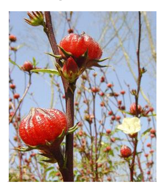
Figure 1: Hibiscus plants (Hibiscus sabdariffa)<sup>10</sup>