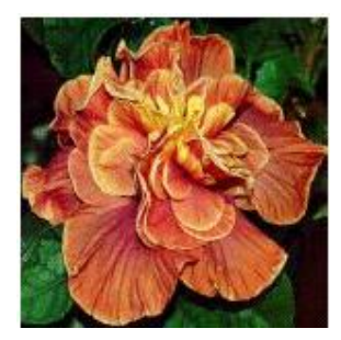
Figure 2: Hibiscus flowers<sup>11</sup>