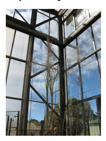
c) Fuzz developing for future seed harvest