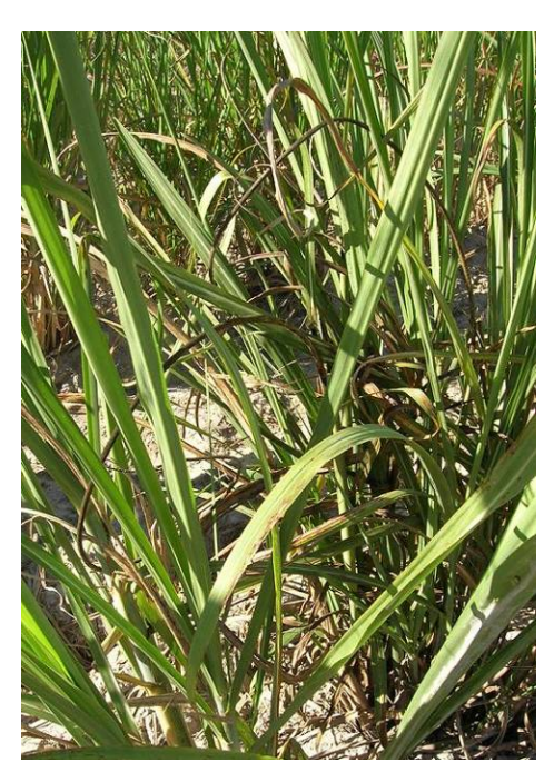
Figure 7. Smut on Saccharum spp. hybrid in Bundaberg (May 2010).

Pachymetra root rot caused by Pachymetra chaunorhiza , an Oomycete, is a disease only found in Australia in the QLD sugarcane districts (Magarey & Bull 2003). It was first identified as northern poor root syndrome in the 1970s, before the disease-causing organism was identified (Magarey 1994). The disease seems to favour high rainfall areas, and spores can survive up to five years in the soil. In northern QLD, surveys indicate that almost every field is infected with the pathogen. The disease is characterised by a soft rot of the primary and some secondary roots, leading to poor root development. Yield loss caused by Pachymetra root rot was estimated to be up to 40% in highly susceptible cultivars (Croft et al. 2000). Fungicides have not been effective at an economical rate and control is based on planting resistant cultivars (Magarey 1996).