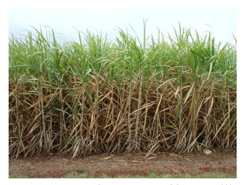
Figure 1. Sugarcane growing in Bundaberg, QLD. Photo taken by OGTR, August 2007.

It is believed that S. officinarum was brought to Australia in 1788 on the First Fleet but cultivation was not immediately successful (Bull & Glasziou 1979). The first official record of sugarcane in Australia was in Port Macquarie in 1821, and the first record of sugar manufacture was in 1823 (Buzacott 1965). The first Australian commercial sugar mill began operation in 1864. Sugarcane cultivation spread along the QLD-NSW coastline and a system of large central sugar mills, supplied with cane by independent farmers, was introduced by the Colonial Sugar Refining Company (now Sucragen) (Queensland Sugar Corporation 2002)(Figure 1).