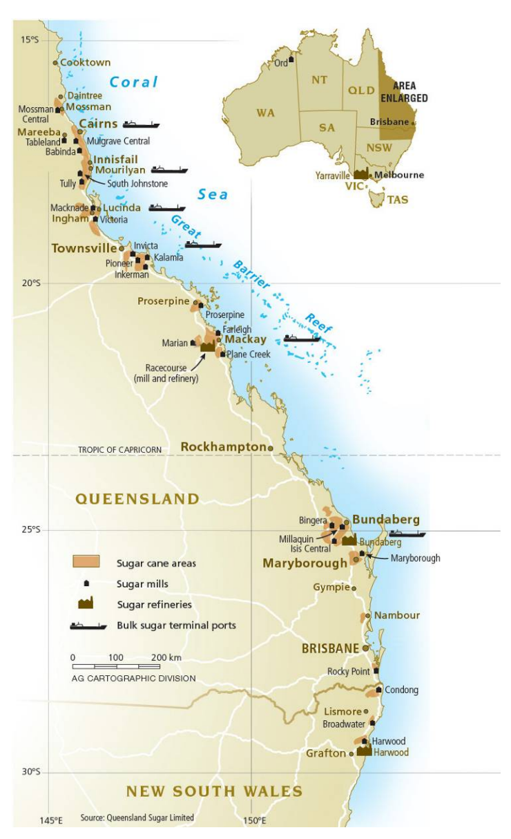
Figure 2. Map of sugarcane industry in Australia, October 2010 (used with permission from Australian Sugar Milling Council).

The cultivation of sugarcane relies on the extensive use of fertilizers and pesticides. Nitrogen especially is widely used. Nitrogen is lost to surface runoff, groundwater, soil storage and the atmosphere (Freney et al. 1994; Weier et al. 1996; Bohl et al. 2000; Macdonald et al. 2009). In Australia, there is a declining nitrogen usage from an average of 206 kg N ha<sup>-1</sup> for the 1997 crop to 164 kg N ha<sup>-1</sup> for the 2008 crop (Wood et al. 2010). Phosphorus is usually applied at 22–80 kg ha<sup>-1</sup> and potassium at 10–140 kg ha<sup>-1</sup> (Bull & Glasziou 1979). Insecticides such as chlorpyrifos may be used to control insect pests, and herbicides, including atrazine, diuron, and paraquat can be used for weed control (Hargreaves et al. 1999). It is estimated that herbicides comprise 90% of the pesticides used on sugarcane farms (Christiansen 2000). These are used both within the crop and in other areas on the farm to reduce nesting areas and food sources for rats (Christiansen 2000). In addition, rodenticides such as coumatetrally and zinc phosphide, and fungicides such as triadimifon and propiconazole, are used to control rodents and diseases (BSES Ltd 2006; Dyer 2010). Chemicals may also be used to help ripen the sugarcane, and increase the accumulation of sugar in the stalk. Etherel ((2-chloro-ethyl) phosphonic acid), a growth regulator, is registered for use in Australia, but is not widely used due to variable yield