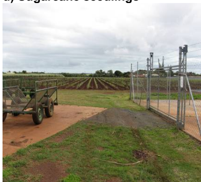
f) Sugarcane seedlings in a field trial