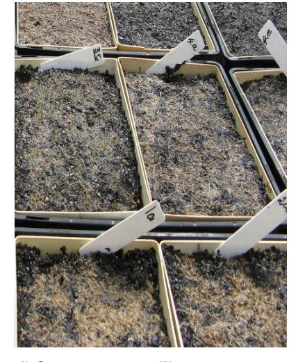
d) Sugarcane seedlings