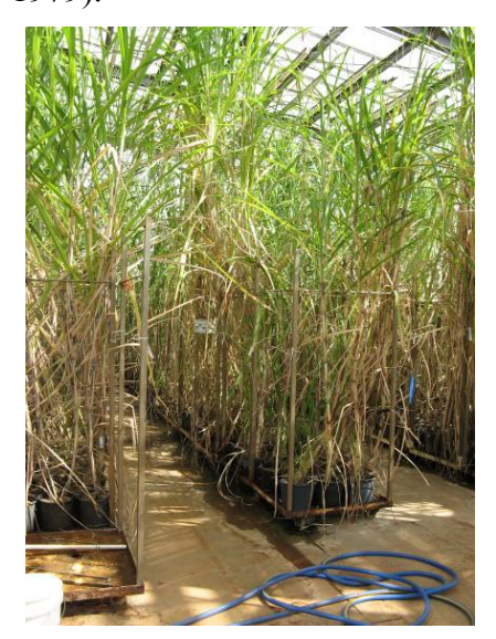
a) Sugarcane cultivars in the glasshouse ready for crossing

photoperiod so that flowers can be available for crossing when required (Bull & Glasziou 1979).