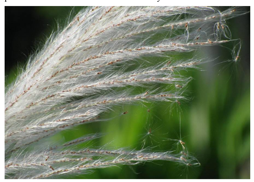
Figure 6. S. spontaneum seed.

Mature fuzz consists of the mature dry fruit (caryopsis), glumes, callus hairs, anthers and stigma (Breaux & Miller 1987). The additional parts of the inflorescence are generally handled, stored and sown with the seed because it is not practical to separate them. Although many commercial cultivars of sugarcane can produce seed, it is only used in breeding programs, because the proportion of sugarcane seedlings with agronomic qualities near to those of the parental commercial cultivars is extremely low.