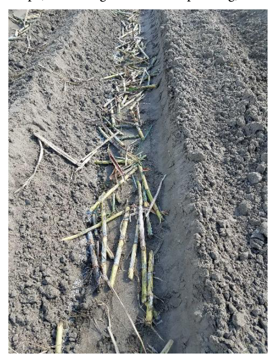
Figure 5. Sugarcane stalks in a furrow before being covered with soil.

is often planted to another crop, such as rice, sweet corn, or a cover crop (termed regular or fallow planting).