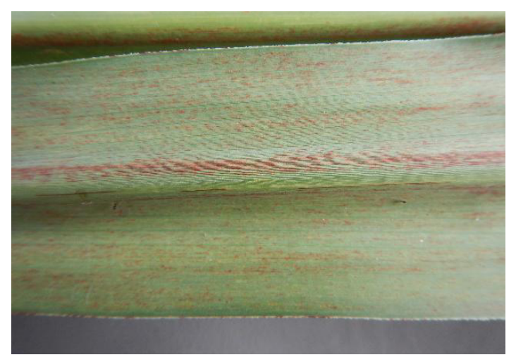
Figure 12. Sugarcane rust mite injury. Sugarcane rust mites are too small to be visible to the naked eye.

however, SRM injury does not cause pustules and tends to be more uniformly distributed on leaves. Injury interferes with photosynthesis and transpiration (Nuessly et al. 2019).