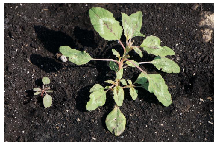
Figure 26. Spiny amaranth seedling (left) and mature plant (right) with spines at the base of leaves.