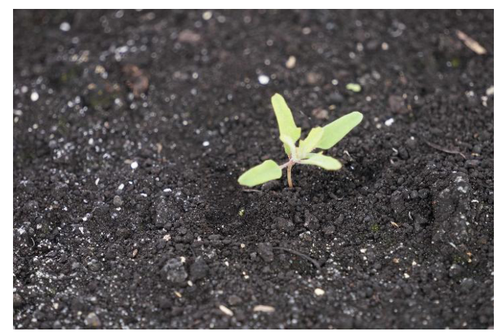
Figure 23. Common lambsquarters seedling.

Common lambsquarters ( Chenopodium album ) is an annual broadleaf weed commonly found in Florida sugarcane during cooler months in the fall and spring. It has large seed-bank reserves that can remain viable in the soil for several years (Roberts and Feast 1973), enabling it to persist in cultivated fields from year to year. Seedlings have egg-shaped to triangular leaves with mealy-gray powdery coating (Figure 23). Common lambsquarters has an erect, grooved stem with a greenish or reddish color and a height of 4 inches to 6 feet (Figure 24). The leaves are alternate. A mealy-gray, powdery coating covers younger leaves in particular. Common lambsquarters is a small-seeded plant. Competitiveness of common lambsquarters with sugarcane is determined by its density and relative time of both plants' emergence.