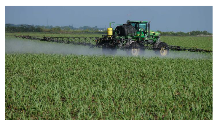
Figure 27. Chemical weed control in sugarcane near Belle Glade, FL.

over the entire field, or directed around the base of cane stalks away from leaves. Spot treatments of nonselective herbicides are sometimes used for management of isolated patches of perennial grasses (bermudagrass, napiergrass). Depending on the label instructions, postemergence herbicides can be applied with adjuvants (surfactants, crop oil concentrates, buffering agents, etc.) to improve herbicidal activity or application characteristics. Before you make a decision regarding herbicide use, you must perform proper weed identification and select the herbicide(s) that will provide maximum control of the target weed(s). Predominantly used herbicides in Florida sugarcane include atrazine, metribuzin, ametryn, 2,4-D amine, asulam, pendimethalin, and halosulfuron. Other commonly used herbicides include mesotrione, topramezone, trifloxysulfuron, dicamba, glyphosate, and the premix of S-metolachlor, atrazine, and mesotrione. Less commonly used herbicides include carfentrazone, diuron, diuron + hexazinone, flumioxazin, and paraquat. These herbicides are mainly used in combinations to broaden the weedcontrol spectrum. Label instructions must be followed by law.