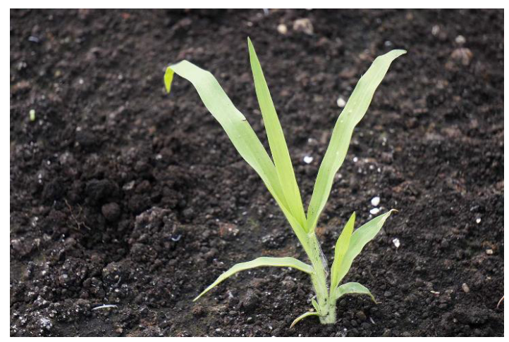
Figure 17. Fall panicum with hairs on the lower surface of the plant.