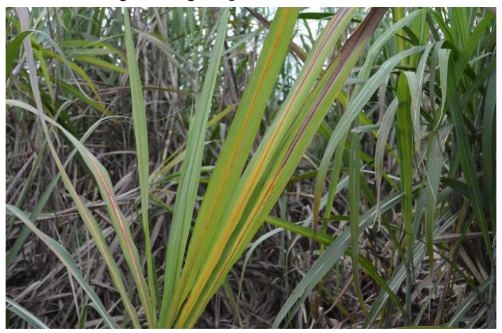
Figure 15. Symptoms of sugarcane yellow leaf: yellow coloration of the lower side of leaf midribs.

Yellow leaf (previously known as yellow leaf syndrome or YLS) was first recognized in Florida in 1993, but the disease had most likely been present in the state for several years (Comstock, Irvine, and Miller 1994; Rott et al. 2016). Symptoms included a bright-yellow coloration on the lower side of the leaf midrib and necrosis starting from the leaf tip and spreading outward from the leaf midrib (Figure 15). Symptoms were most evident on mature sugarcane stalks. In 1997, incidence of Sugarcane yellow leaf virus (SCYLV) exceeded 90% in a majority of Florida's commercial sugarcane cultivars, and 43 of 46 parental clones used in the crossing program for Florida tested positive for the virus (Comstock et al. 1998). These high levels of sugarcane infection suggested that resistance to yellow leaf was rare in the Florida sugarcane germplasm.