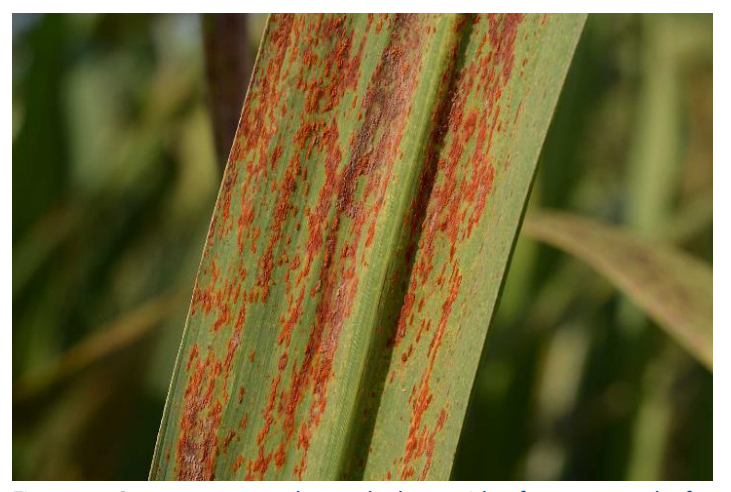
Figure 14. Orange rust pustules on the lower side of a sugarcane leaf.

reductions in sugar per acre of 43%-53% (Raid et al. 2011). CP80-1743, which occupied nearly 25% of the total area when the initial outbreak of orange rust occurred in 2007, was significantly affected. This cultivar has since been withdrawn from commercial production and replaced by less susceptible cultivars. However, several other cultivars, such as CP88-1762 and CP89-2143, which were initially classified as resistant to orange rust based on an absence of disease symptoms during 2007 and 2008 field surveys, rapidly showed disease symptoms following an increase in area planted. Similarly, CP89-2143 was rated resistant during the 2010 crop season, but was rated susceptible two years later (BASF and Glades Crop Care, unpublished data). These breakdowns of rust resistance were attributed to the appearance of new strains of the pathogen (Rott et al. 2016; Sanjel et al. 2016). Occurring over a longer period of time and later in the growing season than brown rust, orange rust may reduce stalk sucrose content as well as stalk populations and biomass.