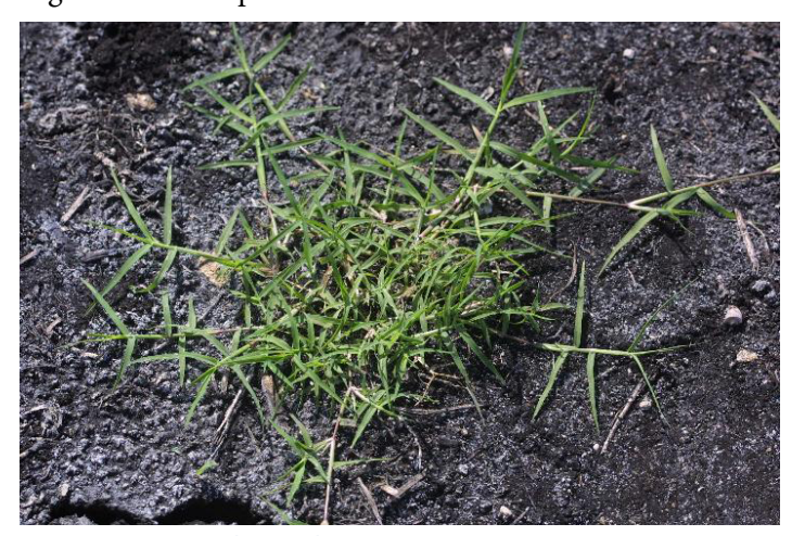
Figure 18. Prostrate bermudagrass.

Bermudagrass ( Cynodon dactylon ) is the most problematic perennial grass weed in Florida sugarcane. It is a wiry, low-growing or prostrate plant with stems arising from aboveground stolons and belowground rhizomes (Figure 18) and rooting at the nodes (Figure 19). Propagation occurs primarily through rhizomes and stolons and less commonly by seed. Bermudagrass is most competitive with sugarcane early in the season before canopy closure because it is not shade-tolerant (Horowitz 1972). It interferes with sugarcane by shading emerging shoots and reducing tiller formation and survival. Once established, it is difficult to manage. It is only sufficiently controlled during the sugarcane fallow period.