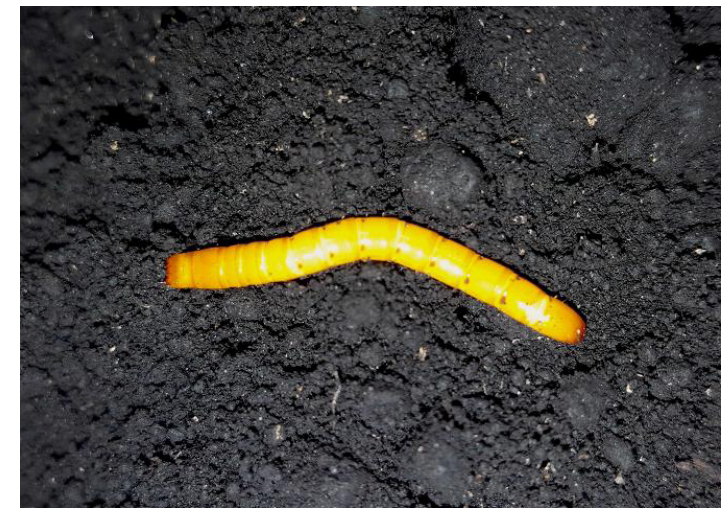
Figure 6. Larva of the corn wireworm, Melanotus communis .

Wireworms are the larvae of click beetles (Figure 6). At least 12 species of wireworms have been found in south Florida, but only the corn wireworm, Melanotus communis , is considered to cause significant economic damage to sugarcane. Wireworms feed on the buds and root primordia during germination of sugarcane seed pieces. After germination, wireworms feed on shoots and roots. Most of the injury to young shoots occurs where the shoots join the seed piece or ratoon stubble (Cherry and Karounos 2021; Beuzelin et al. 2022).