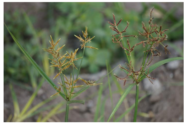
Figure 21. Yellow (left) and purple (right) nutsedge flowers.