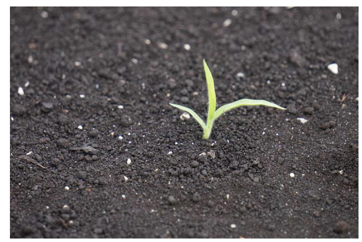
Figure 16. Fall panicum seedling with hairs on the lower surface of the leaf blade.

Fall panicum is a small-seeded grass. Seedlings have hairs on the lower surface of the leaf blades (Figure 16) that disappear with maturity. The growth habit of fall panicum can range from erect to sprawling with formation of large, loose tufts depending on competition (Odero and Sellers 2022). Fall panicum has a waxy-looking stem that is bent and without rooting at the nodes. It typically reaches a height of 1.5–4 feet, but it has also been reported to reach heights of more than 7 feet (Odero and Sellers 2022). The leaf sheath and blades are smooth; however, some hairy biotypes associated with Florida sugarcane exist (Figure 17). The species is sensitive to shading (Vengris and Damon, Jr. 1976) and is usually not found in sugarcane once canopy closure occurs.