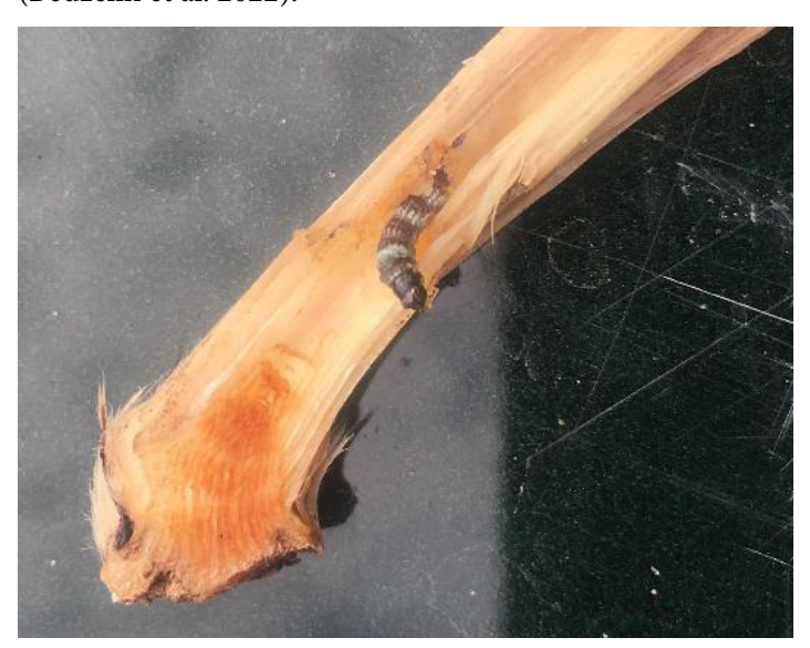
Figure 9. A lesser cornstalk borer larva feeding on a young sugarcane shoot.

The lesser cornstalk borer (LCB), Elasmopalpus lignosellus , is the larva of a moth. LCB larvae (Figure 9) bore into young sugarcane plants at or below the soil surface and usually cause a deadheart comparable to injury caused by the SCB or wireworms. However, LCB larvae construct a silken tube in the soil that extends outward from the plant. The presence of silken tubes and small, circular entrance holes distinguishes deadhearts caused by LCB from those caused by SCB and wireworms. LCB injury above the plant growing point appears as rows of holes in emerging leaves (Beuzelin et al. 2022).