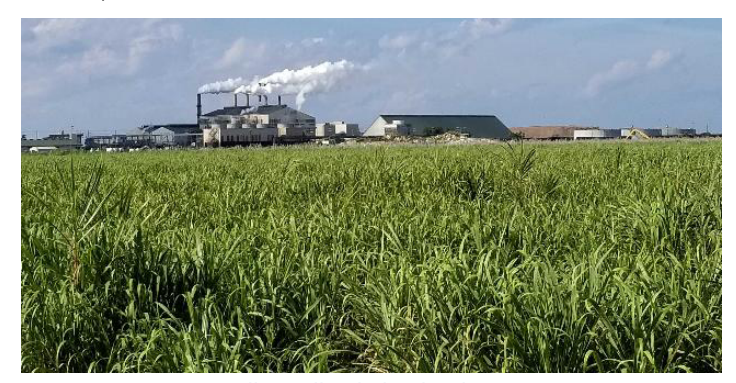
Figure 2. Sugarcane mill in Belle Glade, Florida.

• All Florida sugarcane is crushed at one of four mills in south Florida (Figure 2). Sugarcane milling companies grow about two-thirds of the cane; the remainder is produced by independent farmers. Sugar mills produce raw sugar, which is a combination of sucrose and molasses and is light in color (Figure 3). The raw sugar is then refined at two refineries in the region or shipped by barge to other refineries on the East Coast. The refined sugar is the familiar white crystal and is 100% sucrose. Some sugar is marketed in its raw state (Baucum and Rice 2009).