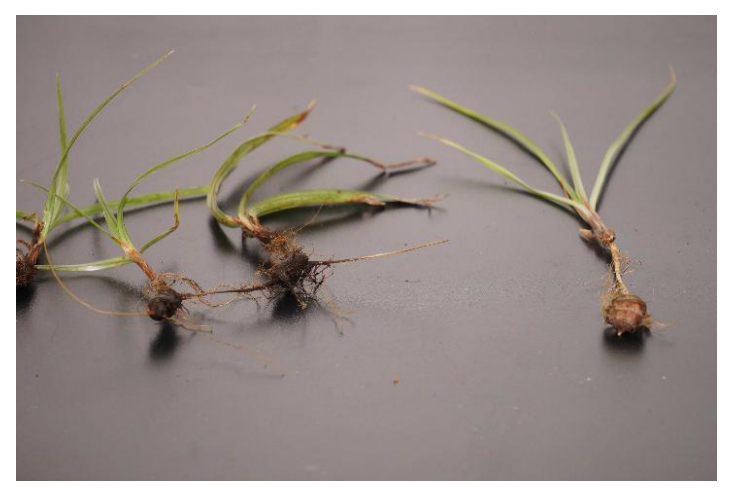
Figure 22. Irregularly shaped purple nutsedge tubers connected in a chain along the length of the rhizome (left) and a round yellow nutsedge tuber at the end of the rhizome (right).