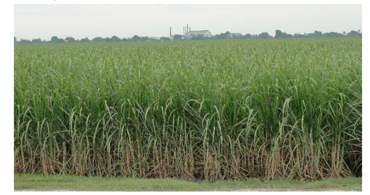
Figure 1. Sugarcane field in Belle Glade, Florida.

of sugarcane and over 2 million tons of sugar (USDA 2022).