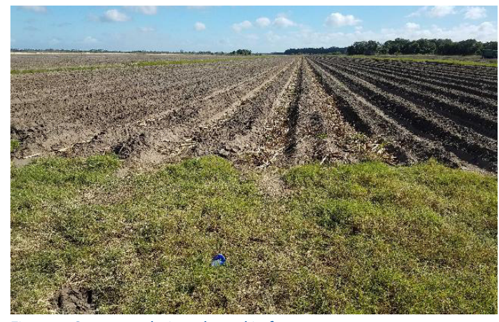
Figure 4. Sugarcane being planted in furrows.

Stalks of seed cane are dropped into furrows, two stalks beside each other, and then cut by hand into smaller pieces. These are covered with soil 3–8 inches deep (Figures 4 and 5). Less than 5% is planted mechanically. One acre of seed cane results in approximately 10 acres of plant cane when hand-planted. However, when mechanically planted, one acre of seed cane yields approximately four acres. In other words, it takes up to three times more seed to plant sugarcane mechanically than manually.