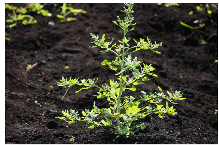
Figure 24. Mature common lambsquarters.