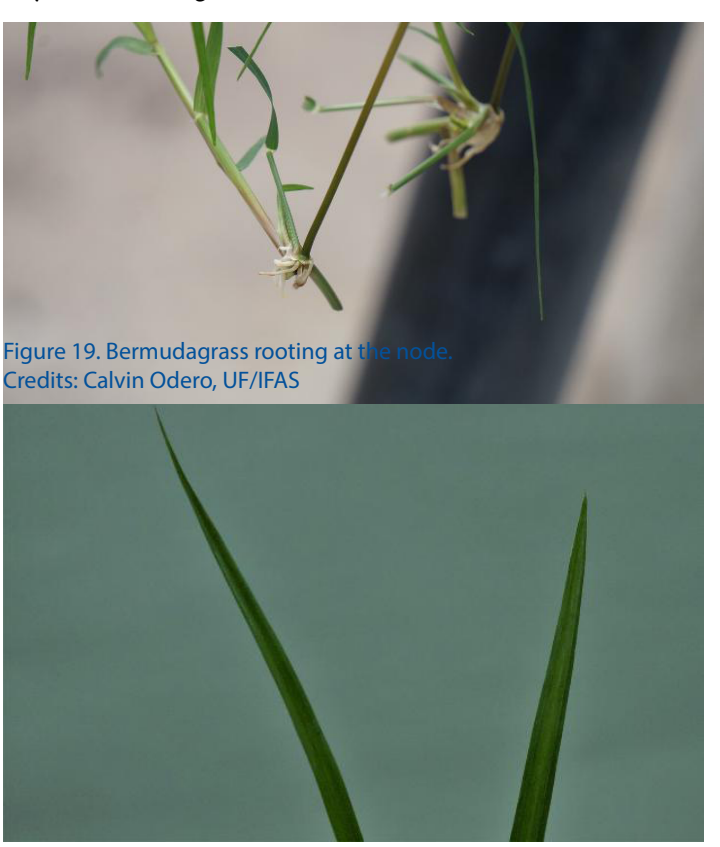
Figure 20. Leaf tips of yellow and purple nutsedge. Note the long, tapered yellow nutsedge leaf tip (left) in contrast to the abrupt taper of the purple nutsedge leaf tip (right). Credits: Calvin Odero, UF/IFAS

shapes, inflorescence, and tubers. Leaves of yellow nutsedge gradually taper to a sharp point, while purple nutsedge leaves abruptly taper to a sharp point (Figure 20). Yellow nutsedge has yellowish-brown flowers that may produce some seed (Figure 21). However, propagation is primarily by smooth, round tubers at the end of rhizomes (Figure 22). Low nitrogen, short photoperiod, and high temperature (27°C-33°C, or 80°F-91°F) are favorable to tuber production (Garg, Bendixen, and Anderson 1967). Both nutsedges are tolerant to high soil moisture but intolerant to shade. This implies that a rapidly developing sugarcane canopy can suppress them. However, shading does not eliminate yellow nutsedge tuber formation because the plant can efficiently divert dry matter into tubers (Patterson 1995; Stoller and Sweet 1987). Purple nutsedge has reddish-purple or reddish-brown flowers that sometimes develop into mature viable seeds (Figure 21). However, propagation is primarily from rough, irregularly shaped tubers connected in chains along the length of rhizomes (Figure 22). Purple nutsedge can survive in a wide range of environmental conditions, including harsh ones, making it especially difficult to control. It grows well in nearly all soil types and over a range of soil moistures, soil pH, and elevations. Purple nutsedge is also able to survive extremely high temperatures compared to yellow nutsedge (Stoller and Sweet 1987).