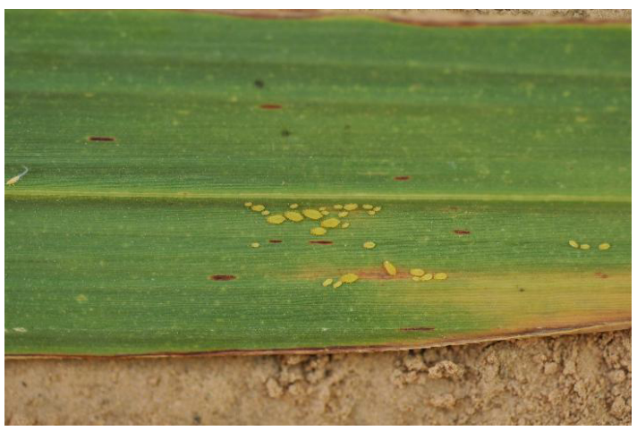
Figure 10. A yellow sugarcane aphid colony feeding on the underside of a sugarcane leaf.

young sugarcane plants or in reduced growth. SA feeding does not cause visible injury to sugarcane leaves; however, large amounts of honeydew excreted by the SA are associated with the development of sooty mold. Sooty mold is a black fungus that can interfere with photosynthesis. In addition, the SA can transmit the sugarcane yellow leaf virus, which is responsible for yellow leaf disease of sugarcane (see below). Aphids observed feeding on sugarcane are generally wingless, but winged forms are produced under conditions unfavorable to the aphids. Abundant rainfall generally reduces aphid infestations (Nuessly et al. 2019).