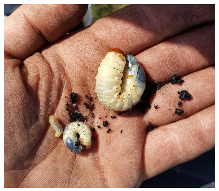
Figure 7. Beetle larvae infesting sugarcane, including a Diaprepes root weevil larva (left), a Cyclocephala sp. larva (center), and a Tomarus subtropicus larva (right).

White grubs are the larvae of several beetle species in the genera Tomarus , Cyclocephala , Phyllophaga , and Anomala (Figure 7). Among these pests, Tomarus subtropicus is considered the most damaging species. White grubs tend to infest sugarcane in organic soils, damaging sugarcane by feeding on roots and underground stems. The first symptom of an infestation is yellowing of the leaves (chlorosis), usually followed by stunted growth, dense browning, lodging, plant uprooting, and in heavily infested areas, plant death. White grub infestations are generally low in plant cane fields, but they increase in ratoon cane fields (Cherry 2012; Beuzelin et al. 2022).