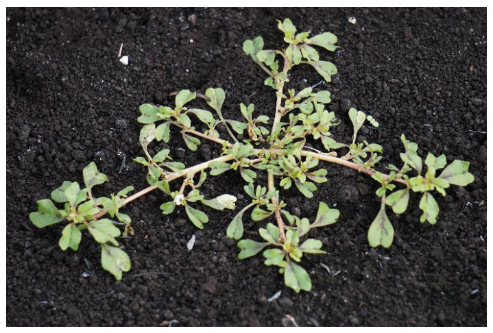
Figure 25. Prostrate livid amaranth.