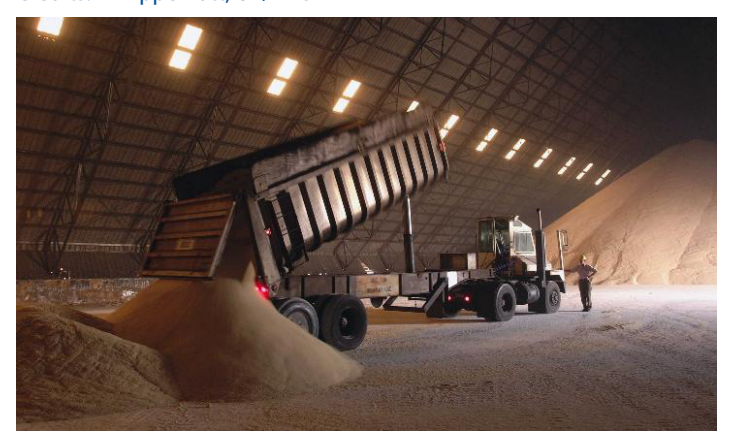
Figure 3. Raw sugar being stored before refining.