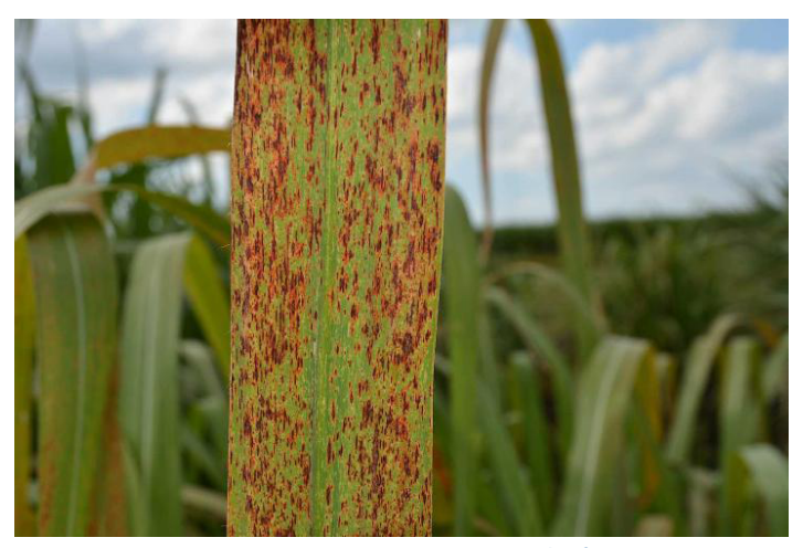
Figure 13. Brown rust symptoms on a sugarcane leaf.

Eventually, brown rust lesions darken, and the surrounding leaf tissues become necrotic. On highly susceptible cultivars, large numbers of pustules may occur on a leaf and coalesce to form large, irregular necrotic areas. Severe rust may even result in premature death of young leaves. These rust infections can cause reductions in both stalk mass and stalk numbers, reducing cane yield (Raid and Comstock 2006).