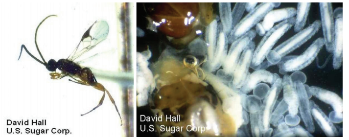
Figure 6. Cotesia flavipes adult on pin and larvae from within a parasitized sugarcane borer larva.

Fields should be scouted every 2 or 3 weeks from March through November. A scouting program developed by one Florida sugar company recommends sampling each 40-acre field in at least 4 locations. At each location, 5 stalks are randomly sampled from each of 5 stools spaced 10 feet apart (5 stalks/5 stools/location). It is desirable to detect borers before they tunnel into stalks so that, if necessary, insecticides can be applied before larvae become protected inside the stalks and further stalk injury occurs. Characteristic signs that plants are infested are window paning of leaf sheaths, holes into stalks, and frass (light-brown fibrous waste material) at these holes. Pinholes in leaves and tiny holes into midribs are also signs of infestation. However, an infestation cannot be positively identified until the sugarcane borers are actually observed. The whorl, leaves, and leaf sheaths should be examined. Stalks should be split to detect borers tunneling inside stalks (Figure 5). Detecting 2 to 3 live larvae per 100 sampled stalks is generally thought to be enough to cause concern about economic damage. When this 2-to-3% threshold is reached, sugarcane borer larvae should be dissected to determine the level of parasitism. If <50% of the borers are parasitized (Figure 6), an insecticide should be applied.