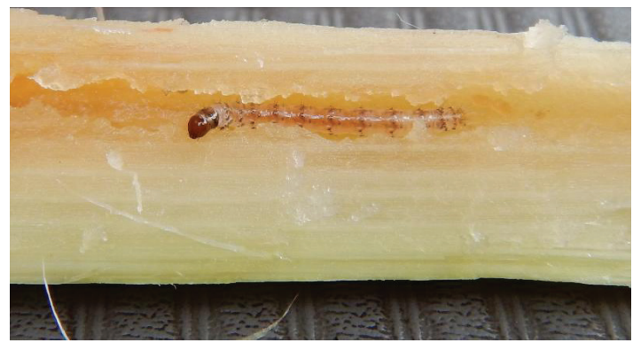
Figure 5. Sugarcane borer larva in its tunnel in a sugarcane stalk.

The sugarcane borer, Diatraea saccharalis , has historically been considered the most important aboveground insect pest of sugarcane in Florida. Sugarcane borer larvae have a brown head and are pale yellow-white with dark brown spots on each body segment along the dorsal side (Figure 5). They can grow to 1.2 inches long. Sugarcane borer adults are straw colored moths with delta-shaped wings. Sugarcane borer population levels in Florida sugarcane fields have declined since the 1990s, likely associated with successful biological control from natural enemies. Although this insect feeds on sugarcane, numerous other grasses have been reported as hosts in Florida, including rice and weeds.