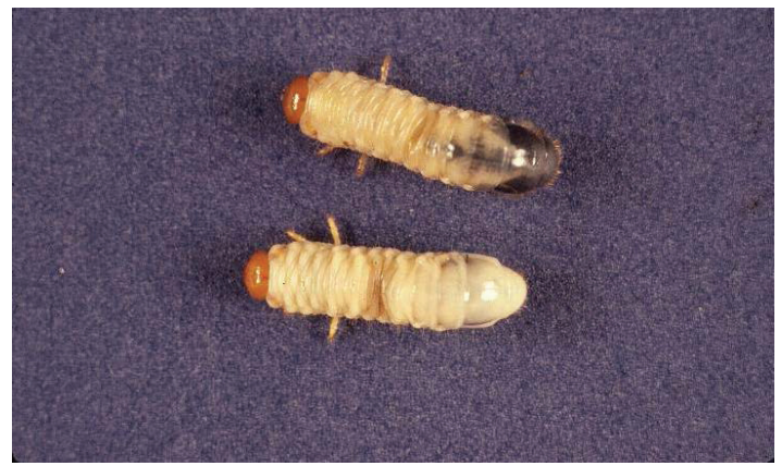
Figure 2. Sugarcane grubs. The grub on the bottom is very white because it has "milky disease," which is a bacterial disease.

White grubs are beetle larvae that are belowground sugarcane insect pests in Florida. They have soft bodies but tough heads and legs that allow them to move through the soil to find and hold on to roots and underground stalks to feed (Figure 2). White grubs tend to curl into a "c shape" when disturbed or removed from the soil. Species that have been found in Florida sugarcane fields are in the genera Anomala, Cyclocephala, Dyscinetus, Euphoria , and Tomarus . Of these grub species, the sugarcane grub, Tomarus subtropicus , has historically been a major pest in fields on organic soils where most Florida sugarcane is grown. However, sugarcane grub population levels have drastically decreased recently, potentially due to higher water tables and more frequent flooding in shallow organic soils.