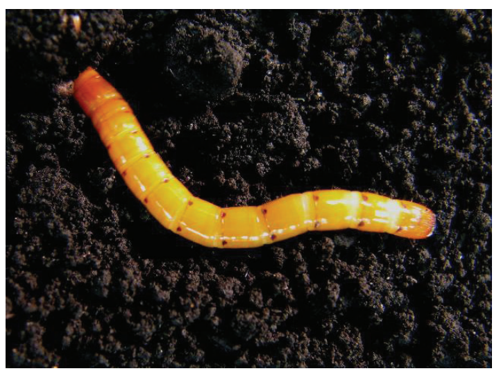
Figure 1. Larva of the wireworm, Melanotus communis .

pest in Florida sugarcane grown on organic (muck) soil than on mineral (sandy) soil. Wireworm densities appear to have decreased recently in organic soils, potentially because of the implementation of best management practices and organic soil subsidence, which result in higher water tables and more frequent flooding.