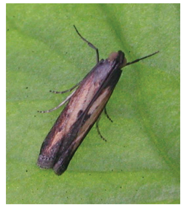
Figure 4. Lesser cornstalk borer adult.