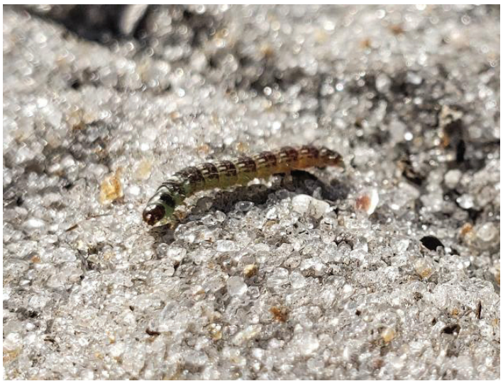
Figure 3. Lesser cornstalk borer larva.

borer larvae are white to creamy yellow with reddish to brown patterns adorning each thoracic segment, except for the first, which is covered with a broad black shield. Older larvae develop a green to turquoise blue color between the darker patterns, particularly between the head and thoracic segments (Figure 3). Lesser cornstalk borer larvae wiggle energetically when handled. Lesser cornstalk borer adults are small, slender moths about ½ to ½ inch long (Figure 4). Adults are easily disturbed by walking through the field, but these quick fliers usually move no more than 10 feet at a time. They are most active at dawn and dusk, and females lay their shingle-like, translucent eggs on soil or detritus near young sugarcane shoots.