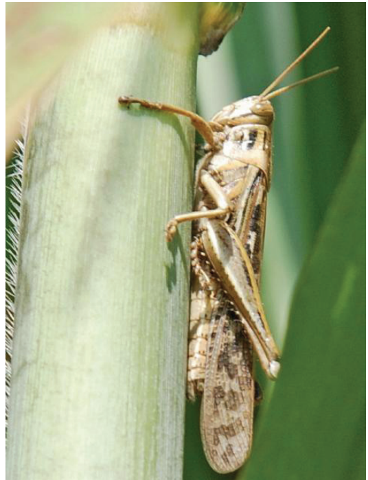
Figure 1. An American grasshopper on a sugarcane stalk.

The American grasshopper (Figure 1), Schistocerca americana , is a birdwing grasshopper that occasionally causes serious injury to sugarcane. This grasshopper eats leaf blades down to the midrib in jagged, irregular patterns, removing valuable photosynthetic tissue from the plant (Figure 2). The insect has been common in southern Florida since 2009 and has been more commonly found feeding on sugarcane grown on the sandy soils west and southwest of Lake Okeechobee. The eggs are deposited in groups in the soil. Nymphs emerge to feed on many different plants throughout the landscape. Current status as a pest of sugarcane has not been determined.