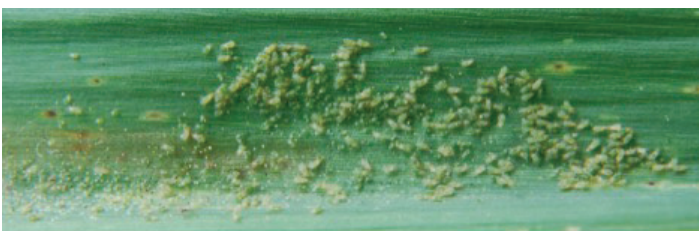
Figure 9. Spider mites on a sugarcane leaf.

Spider mites, primarily Oligonychus stickneyi , have been occasional pests in Florida sugarcane since the 1970s. These mites live and feed on the undersides of leaves. They form fine webs in which eggs are laid and young nymphs develop (Figure 9). Leaves infested by spider mites display an orange to reddish-brown discoloration (red russetting) similar to that associated with sugarcane lacebugs. Severe injury by spider mites can result in leaf death.