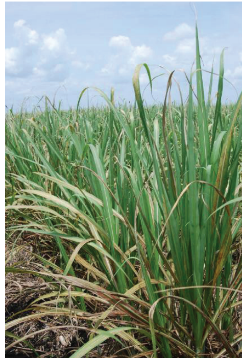
Figure 10. Spider mite injury on sugarcane showing injured and dead leaves throughout the canopy.

Spider mite infestations generally occur during March-June. The lower leaves of sugarcane are usually colonized first. Prolonged heavy infestations accompanied by extensive injury to the middle and upper leaves (Figure 10) of young plants may reduce growth. Predaceous mites, a predaceous thrips, and rainfall help control spider mites. Products with elemental sulfur are registered for use in sugarcane and may control spider mites. Multiple applications would be required to try to bring the mites under control, particularly because the mites are found predominantly under the leaves, rather than on the top of the leaves where most of the applied sulfur would be deposited.