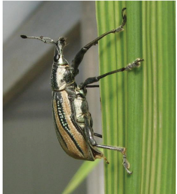
Figure 5. Diaprepes root weevil adult on a sugarcane leaf.

Injury is similar to grub injury whereby sugarcane plants suffer yellow discoloration, become highly stunted, and are prone to lodging. Damage has been significant locally with stalk lodging, exposed root balls, and stand loss (Figure 6). Several weed species found in Florida sugarcane fields are suitable food sources and egg-laying sites for Diaprepes root weevils. These include the Brazilian pepper tree, a highly invasive woody plant found throughout central and southern Florida, including around sugarcane fields. Weed control is important in preventing Diaprepes root weevil infestations in sugarcane.