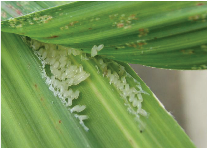
Figure 3. Diaprepes root weevil eggs between sugarcane leaves.