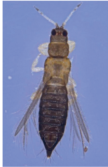
Figure 18. Female sugarcane thrips adult.

Sugarcane thrips nymphs and adults use their rasping-sucking mouthparts to feed on leaf surfaces. Feeding causes dried and curled leaf tips and margins (Figure 19) that can cause injured whorl leaves to remain tied together with a whip-like appearance. Feeding also causes yellowish streaks and dried necrotic patches on injured leaves. Sugarcane leaf death can occur under severe thrips infestations.