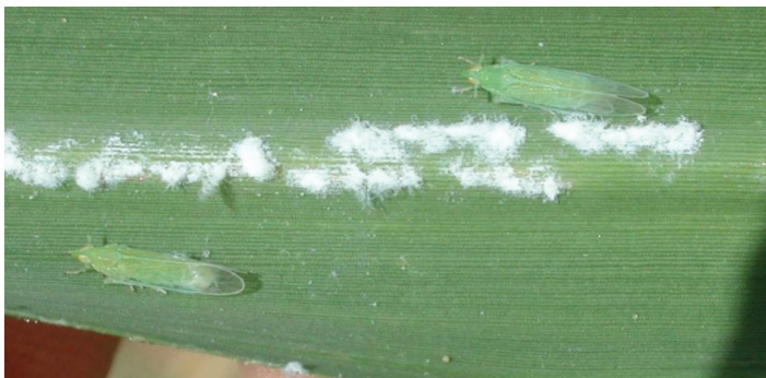
Figure 20. West Indian canefly adults and egg masses on sugarcane leaves.

The West Indian canefly, Saccharosydne saccharivora , was first recorded in Florida in 1909. This insect is not a true fly, despite its common name, and is also called West Indian sugarcane fulgorid. The adult is light to medium green with wings that are nearly transparent. The head is narrower than the body and narrows to a point in front of the golden-yellow to orange eyes. Eggs are inserted into the leaf tissue, frequently along the underside of leaves into or along the midrib of sugarcane plants. A white, waxy plug produced by the females covers egg masses (Figure 20). The nymphs are yellow to light green in color and produce copious amounts of wax, which collects at the end of their abdomens and resembles a cotton string that can exceed twice their body length. The nymphs develop through five instars in 6.5 to 7 weeks at 80°F.