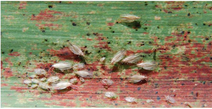
Figure 14. Sugarcane lacebug adults and immatures with leaf russetting and black frass spots beneath sugarcane leaves.