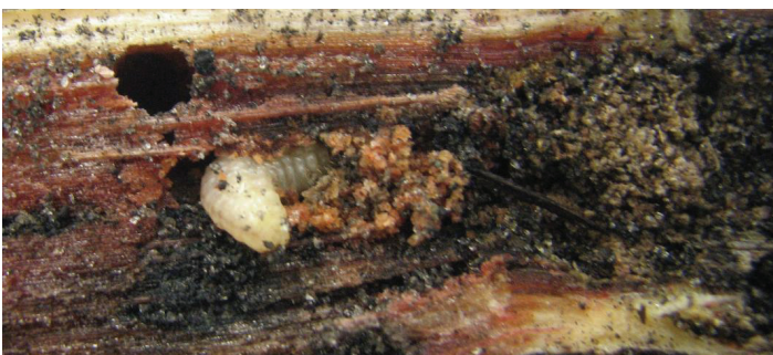
Figure 4. Diaprepes root weevil larva in sugarcane seed piece.