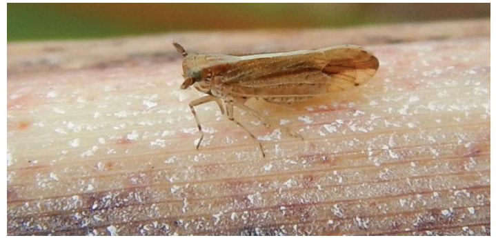
Figure 13. Sugarcane delphacid on a sugarcane leaf sheath.

The sugarcane delphacid, Perkinsiella saccharicida (Figure 13), was first observed in Florida in 1982. Surveys quickly revealed that the delphacid ranged throughout the Florida sugarcane production area. To date, little economic damage from the pest has been reported. However, if a rapid population expansion were to occur, there could be serious economic damage due to its feeding and reproductive activities. The sugarcane delphacid is the vector of Fiji disease; however, the disease is not present in Florida.