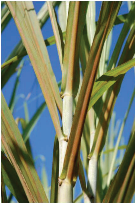
Figure 17. Sugarcane rust mite symptoms on sugarcane cultivar CP89-2143.