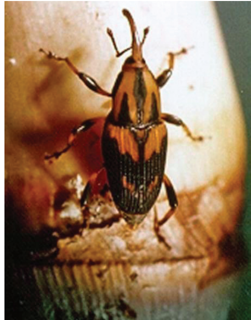
Figure 21. West Indian cane weevil adult.

usually attracted to sugarcane stalks that are already injured (e.g., damage by other insects or rats). However, the weevils may be attracted to some cultivars such as CP85-1382 that have growth cracks, but no other obvious abnormalities.