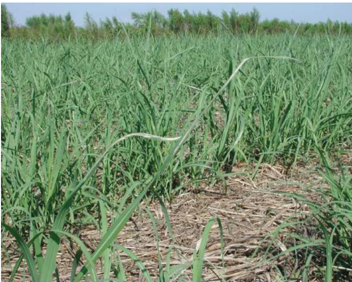
Figure 8. Terminal leaf on sugarcane stalk tied together and killed by M. trapezalis larvae.