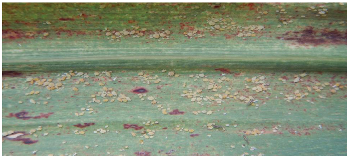
Figure 12. Sugarcane aphids on the underside of a sugarcane leaf.