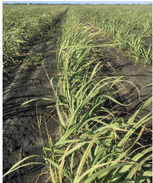
Figure 19. Sugarcane leaves exhibiting dried leaf tips and margins because of sugarcane thrips feeding.