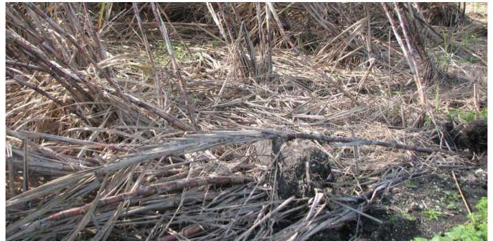
Figure 6. Diaprepes root weevil damage to sugarcane. Note stalk lodging, root balls uplifted, and poor stand.

Injury is similar to grub injury whereby sugarcane plants suffer yellow discoloration, become highly stunted, and are prone to lodging. Damage has been significant locally with stalk lodging, exposed root balls, and stand loss (Figure 6). Several weed species found in Florida sugarcane fields are suitable food sources and egg-laying sites for Diaprepes root weevils. These include the Brazilian pepper tree, a highly invasive woody plant found throughout central and southern Florida, including around sugarcane fields. Weed control is important in preventing Diaprepes root weevil infestations in sugarcane.