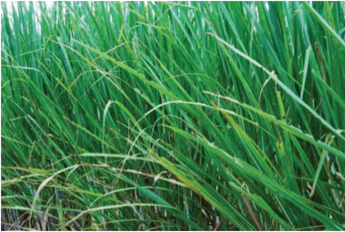
Figure 2. American grasshopper injury to sugarcane leaves.

plants. Although this root weevil was observed in or near Florida sugarcane areas, damage to Florida sugarcane was not observed until 2010. Eggs are yellowish white and are deposited between leaves cemented together by the female (Figure 3). Larvae are white and look like grubs but have no legs. Larvae feed on roots and tunnel into the stool and belowground stalks (Figure 4). Adult coloration is variable, ranging from all black with a few white to orange markings to nearly all white to orange with black markings (Figure 5).