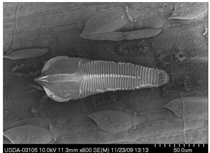
Figure 16. Female sugarcane rust mite on the undersurface of a sugarcane leaf (low temperature scanning electron microscopy).

All stages of the sugarcane rust mite are oval-elongate, tapering toward the end of the abdomen, and have two pairs of legs. Waxy growths from the body vary by environment and plant host (Figure 16). These mites develop through egg, larval, and nymphal stages before reaching adulthood. Development is completed in less than 7 days. The mites can be found throughout the year but reach elevated population levels only during the mid to late summer months when temperature and humidity are relatively high.