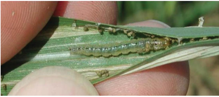
Figure 7. Sugarcane leaf tied together by a M. trapezalis larva.

is not uncommon during the spring months to find the youngest leaf tied together with a dead terminal end (Figure 8); however, this injury is not known to affect long-term growth or overall crop yield.