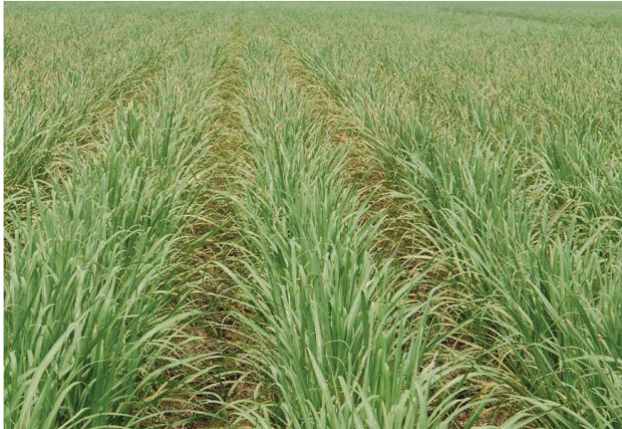
Figure 11. Spider mite injury on sugarcane from field edge.

on the leaf as with the yellow sugarcane aphid. However, sugarcane aphids produce large amounts of honeydew that collect mostly on the upper leaf surfaces and provide a substrate for sooty mold fungi. The fungal growth blocks sunlight and reduces photosynthesis, thereby negatively affecting yield. The sugarcane aphid also transmits viruses that reduce yield (e.g., Sugarcane yellow leaf virus). Large sugarcane aphid colonies are not common on sugarcane in Florida because the aphid is held under control by the same predators as for the yellow sugarcane aphid, as well as by a parasitic wasp ( Lysiphlebus testaceipes ) and fungal pathogens.